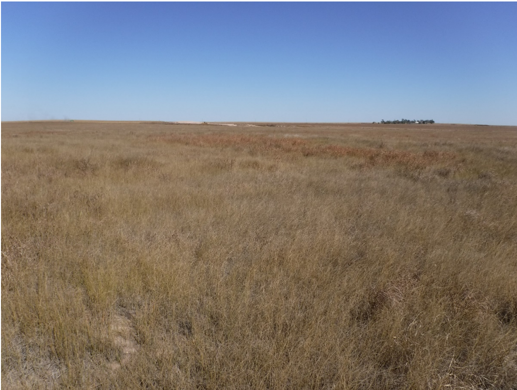
Photo 4. Expansion overview; looking northeast from the southwest conversion boundary marker.