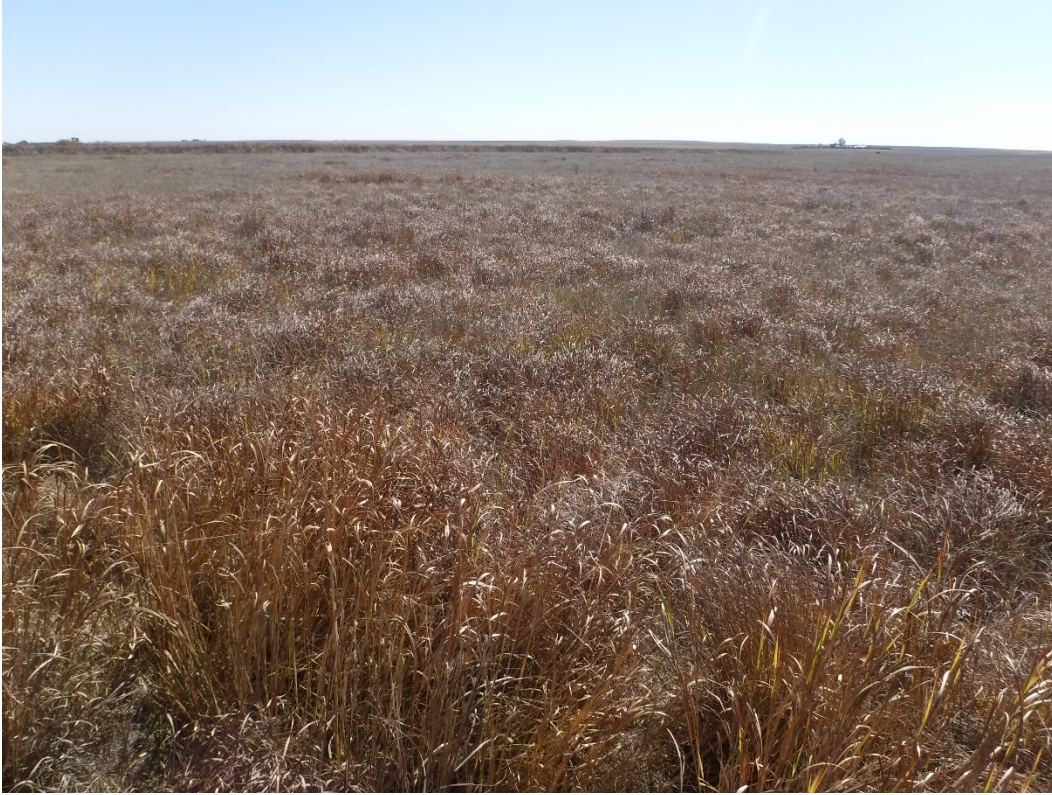
Photo 3. Expansion overview; looking southeast from the northwest conversion boundary marker.