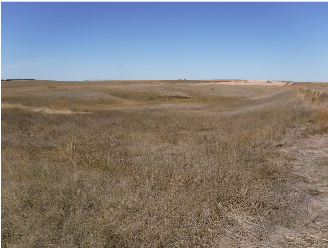
Photo 6. Old 111 pit located south of current 110c permit; looking north.