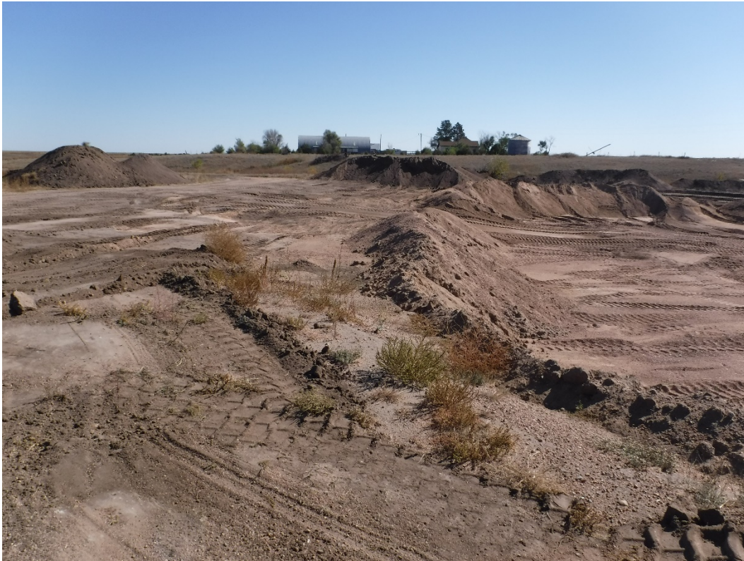
Photo 3. Active mining face of the northern portion of the excavation; looking east.