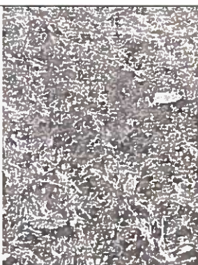
Picture 4a Asphalt