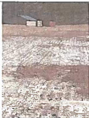
Picture 1 Salt Contamination