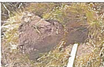
Picture 6 Adjacent Top Soil