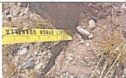
Picture 5 Reclaimed Top Material