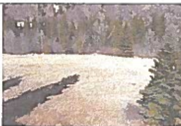
Picture 2 Adjacent Pasture