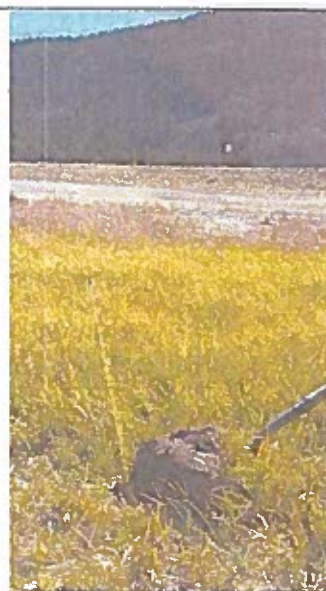
Picture 6a Adjacent Top Soil