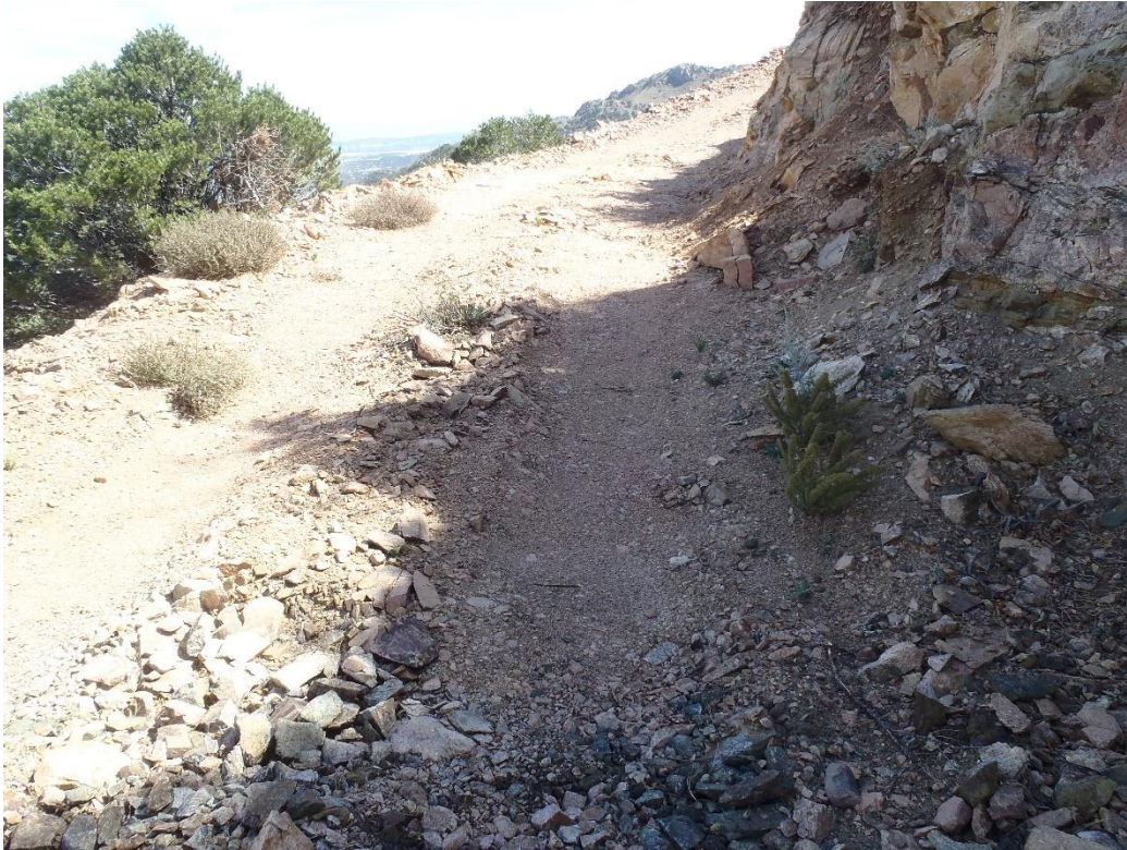
Photo 4. Typical access road.