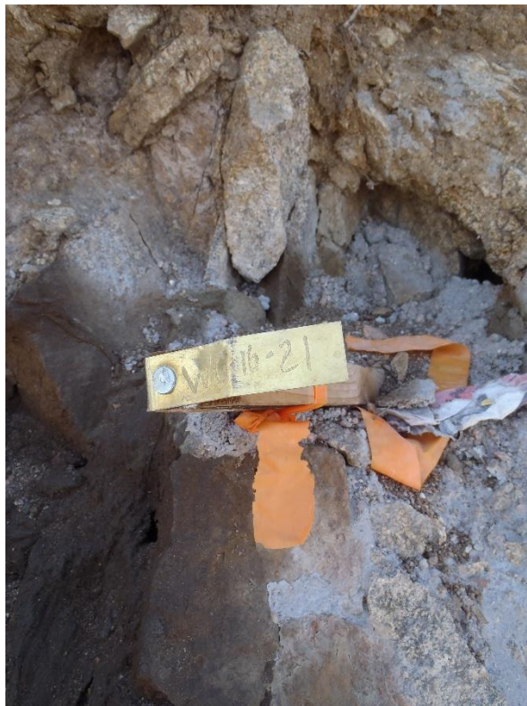
Photo 3. Petroleum product staining observed at drill site WG-16-21.