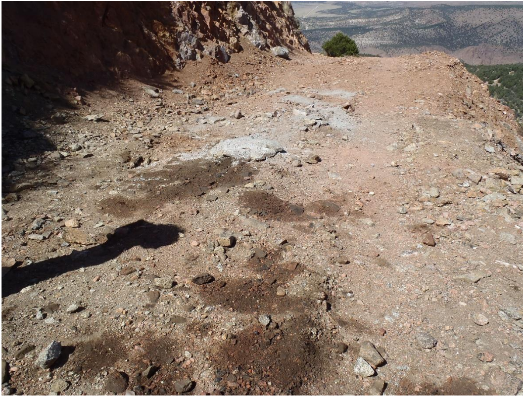
Photo 2. Petroleum product staining observed at drill site WG-16-30.