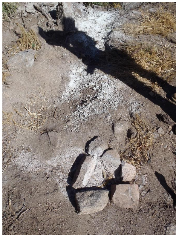
Photo 5. Grout overflow was observed at WG-16-36.