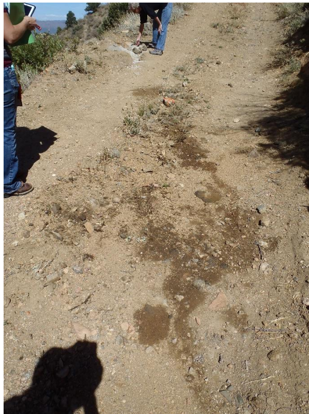
Photo 1. Petroleum product staining observed at drill site WG-16-35.