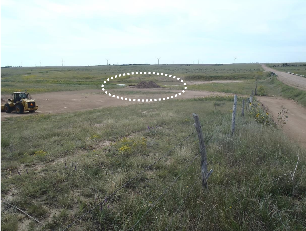
Photo 1. Standing water observed in or near the Arikaree River (looking south).