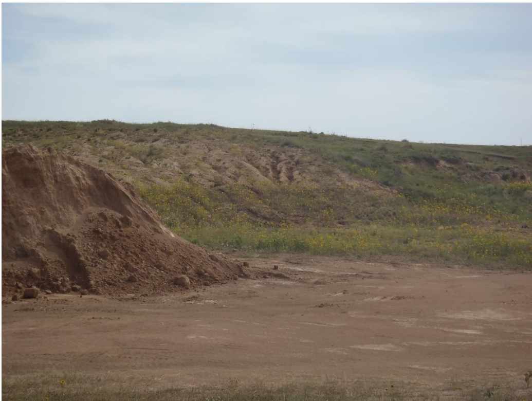
Photo 2. Erosion gullies on northeast slope.