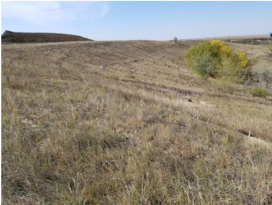
Figure 11. From the southeast corner of the Tract 6 area looking west.