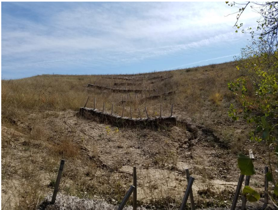
Figure 14. Erosion gully repair on the southwest corner of the Tract 6 area.