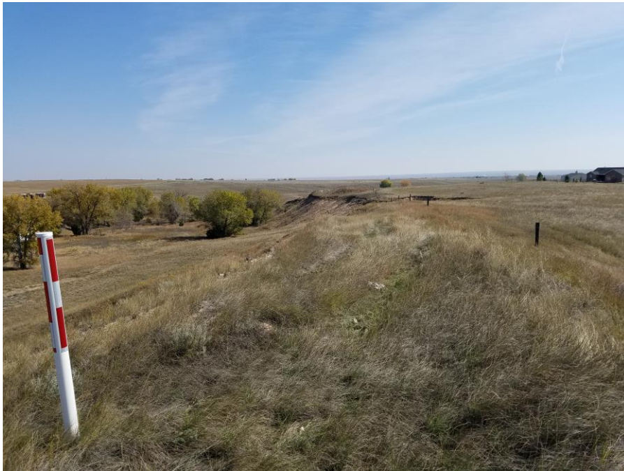
Figure 7. From the southeast corner of the Tract 1 area looking east.