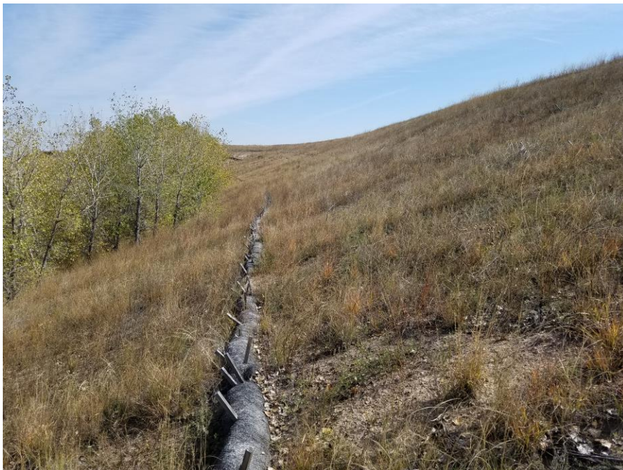
Figure 12. From the west end of the Tract 6 area looking east.