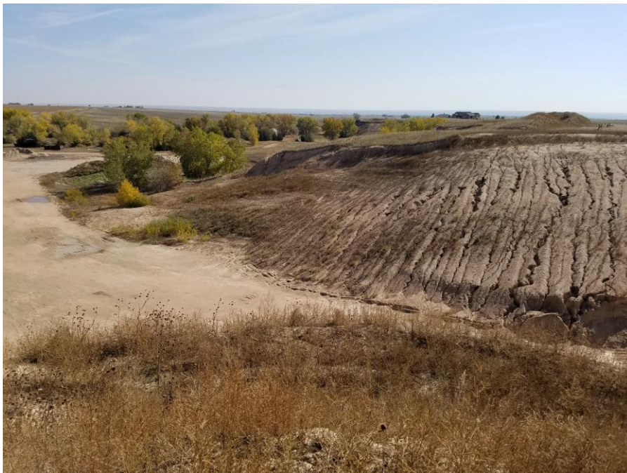
Figure 4. From the southwest corner of the Tract 5 area looking east.