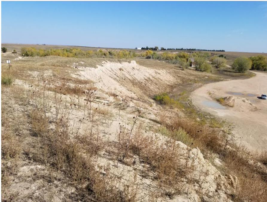
Figure 3. Southwest corner of the Tract 5 area looking northeast.