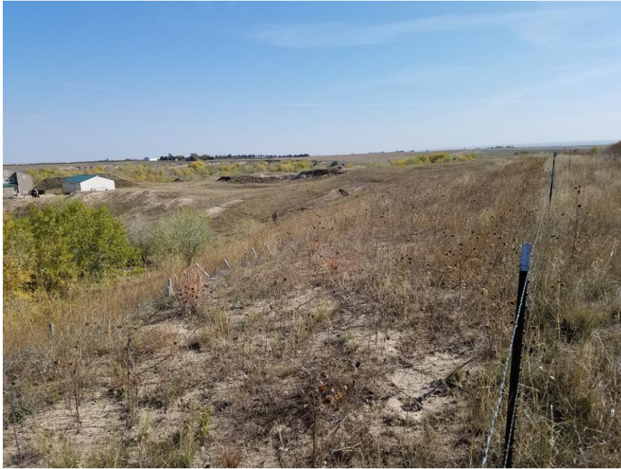
Figure 1. From the southwest corner of the Tract 6 area looking northwest.

Kym Schure 12826 CR 37 Sterling, CO 80751