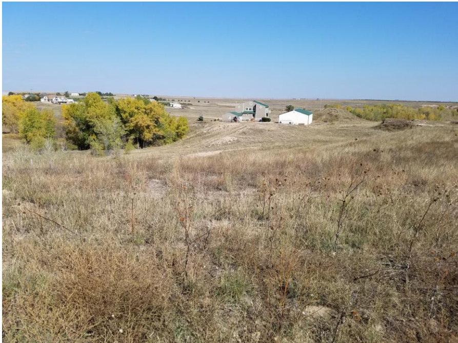
Figure 2. From the southeast corner of the Tract 6 area looking north.