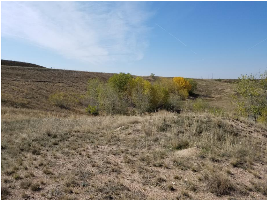
Figure 10. From near the northeast corner of the Tract 6 area looking southwest.