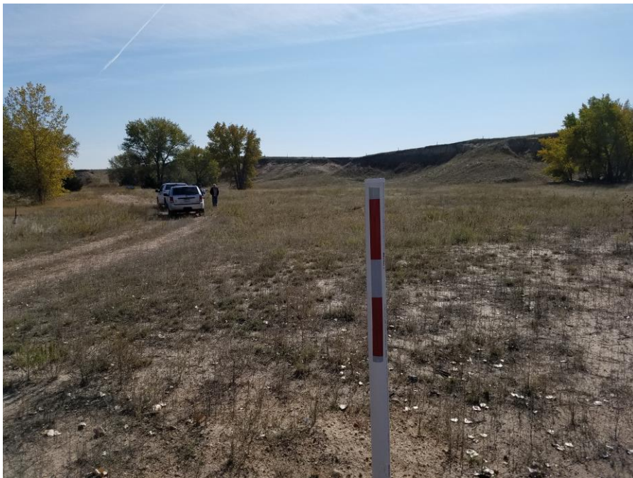
Figure 6. From the northeast corner of the Tract 1 area looking southeast.