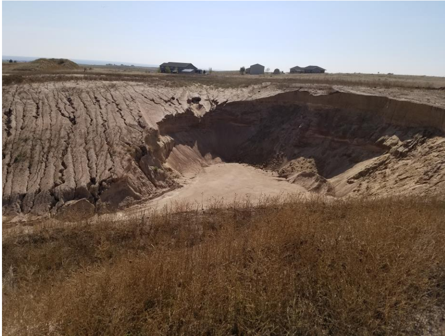
Figure 5. From the southwest corner of the Tract 5 area looking southeast. Active mine area.