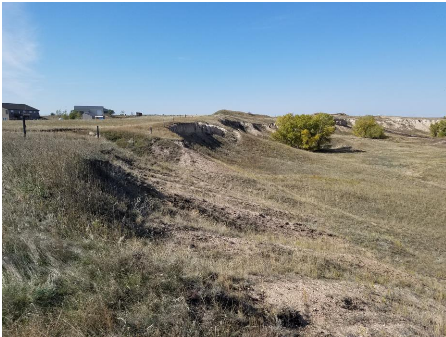
Figure 8. From near the center of the Tract 4 area looking east.