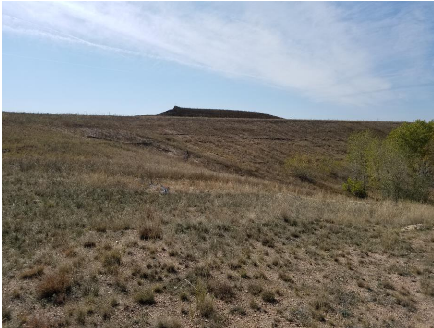
Figure 9. From near the northeast corner of the Tract 6 area looking southwest.