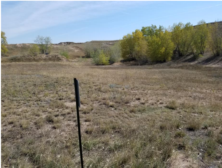
Figure 13. From the northwest corner of the Tract 6 area looking southeast.