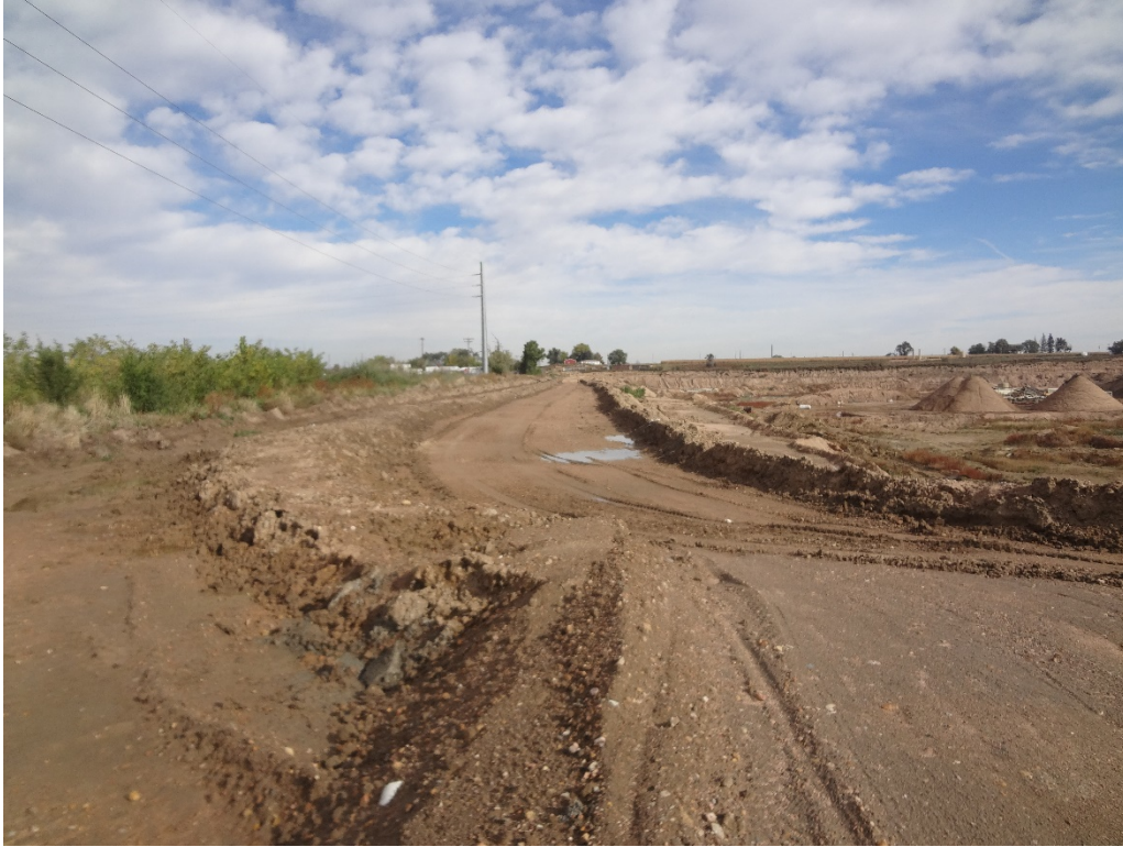
View of the completed slurry wall cap along the west side of the Loloff Pit looking north from the southwest corner of the site