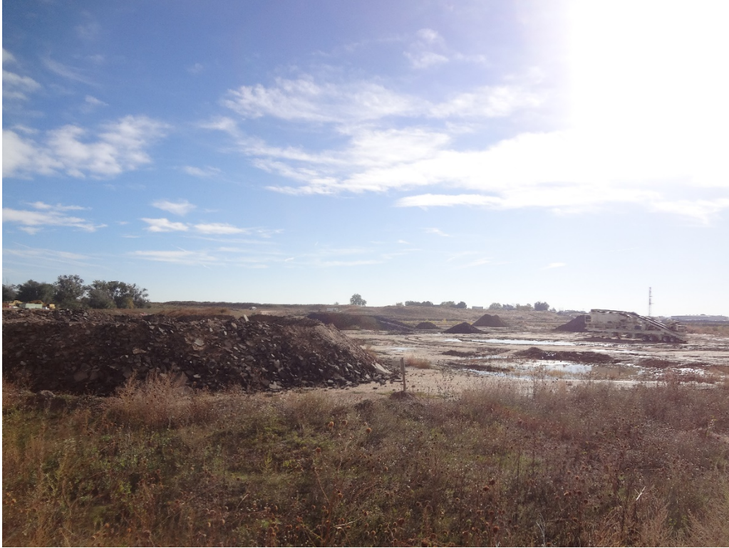
View of asphalt stockpile (near) and milling stockpiles (far) at the Derr Pit looking west from the office