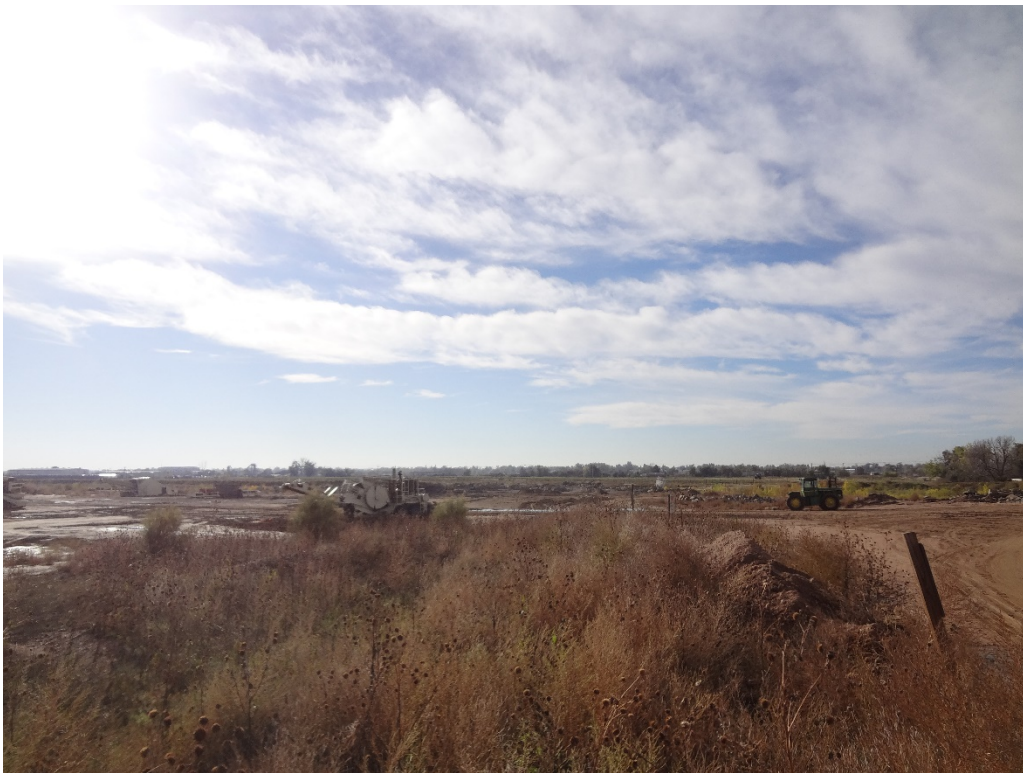
View of concrete stockpiles in the southern portion of the Derr Pit looking south from the office