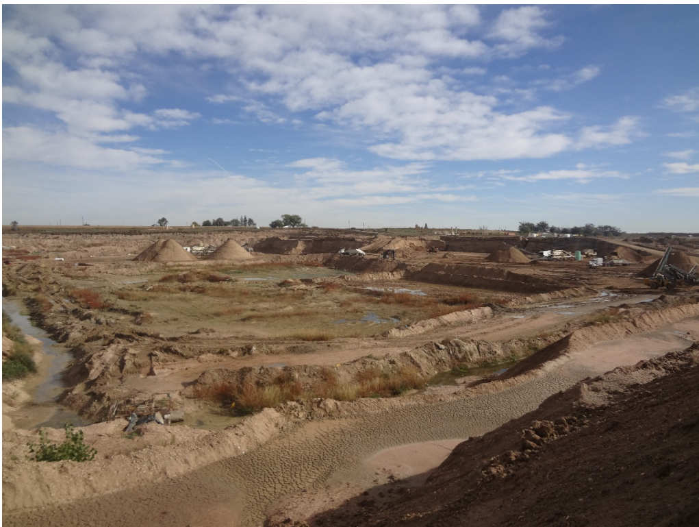
View of the Loloff Pit from the southwest corner of the site looking northeast