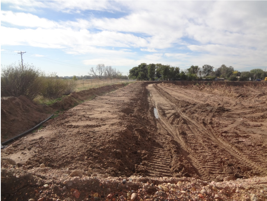
View of the completed slurry wall cap in the southeast corner of the Loloff Pit looking south from the entrance