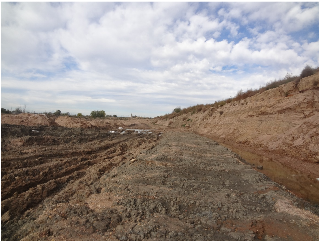
View of the completed slurry wall cap along the north side of the Loloff Pit looking west