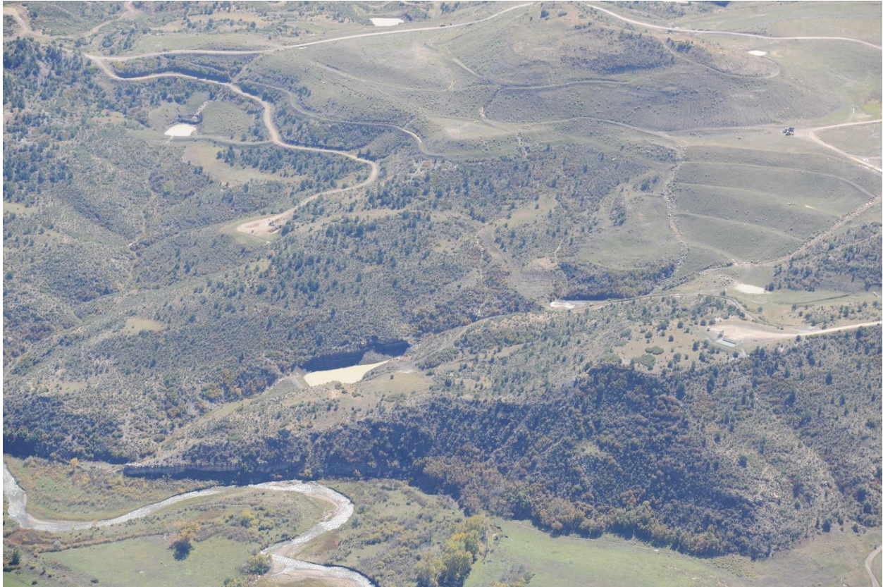
Pond 8 and Fill 8 with “the knob” in upper right part of photo

Number of Partial Inspection this Fiscal Year: 4