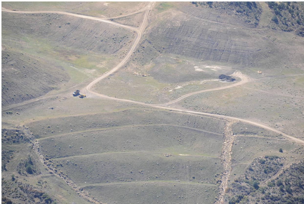
Fill 8 and pond cleanings dump area

Number of Partial Inspection this Fiscal Year: 4