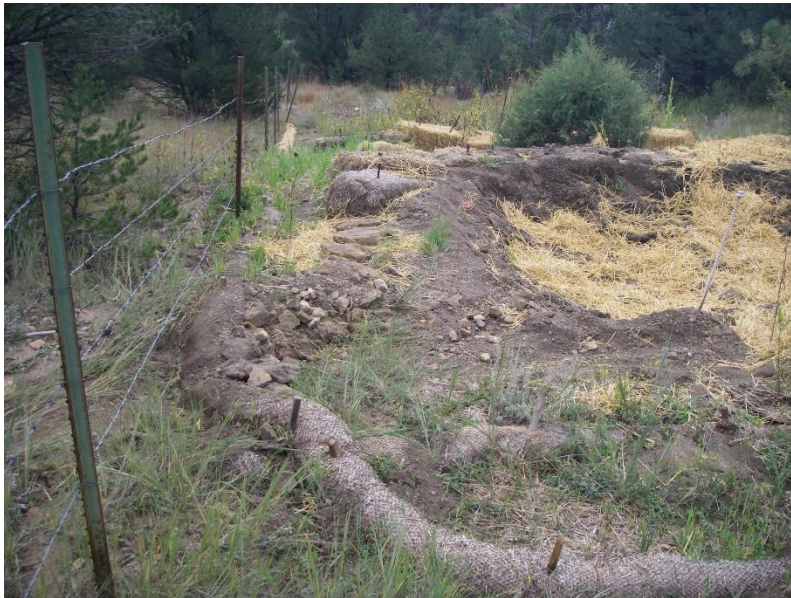
Wattles added to north end of site

Number of Partial Inspection this Fiscal Year: 3