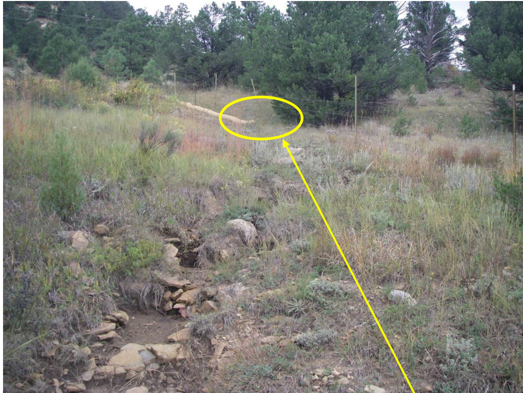
Erosion below the straw bales