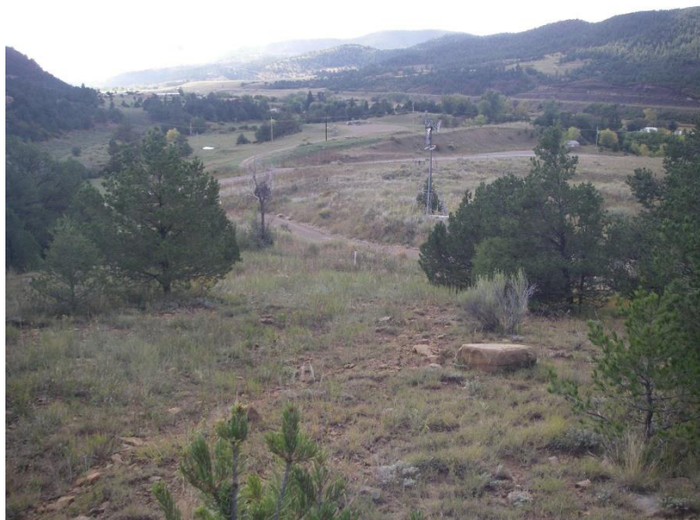
Former road up to pad site

Number of Partial Inspection this Fiscal Year: 3