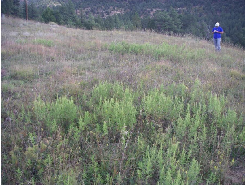
Former pad site