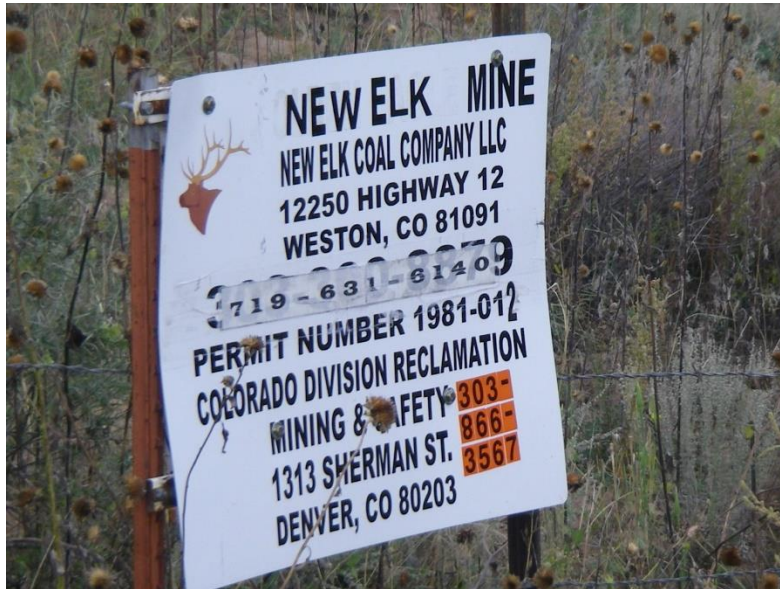
Entrance sign with information for New Elk Mine