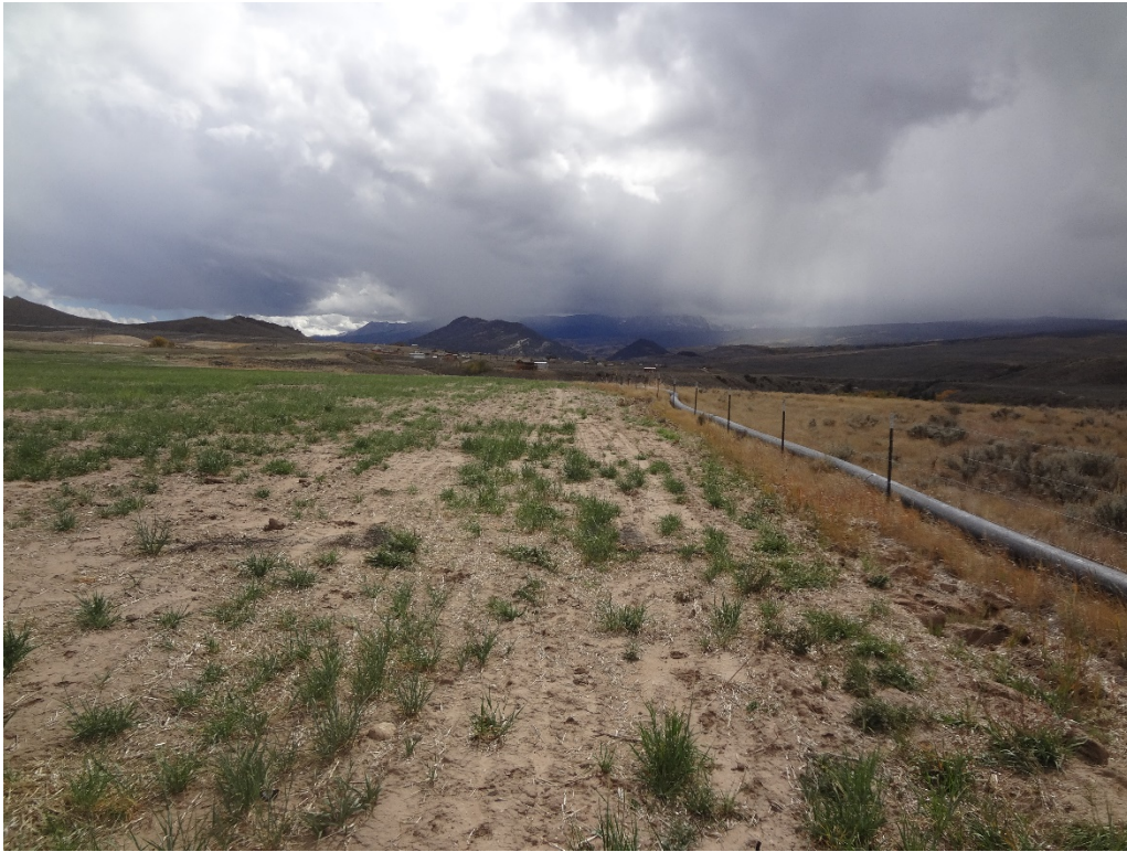
View from northwest corner of the site looking south