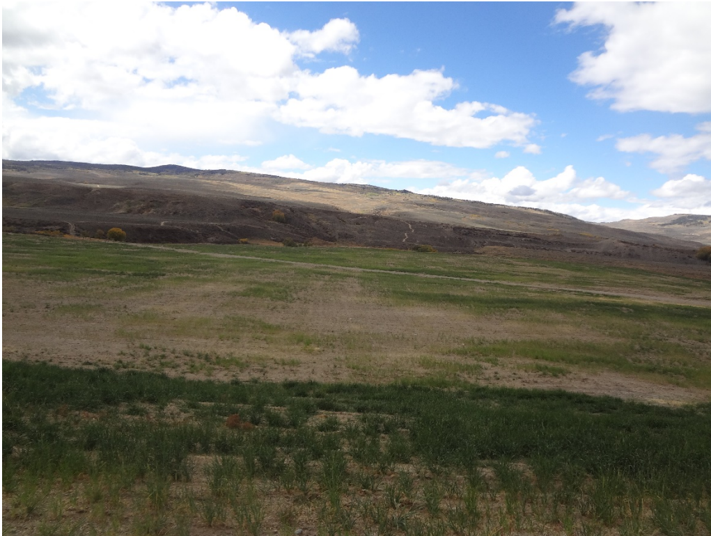
View from the east side of the site looking west