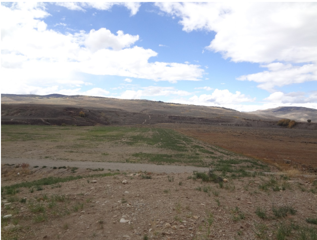
View from the northeast corner of the site looking west