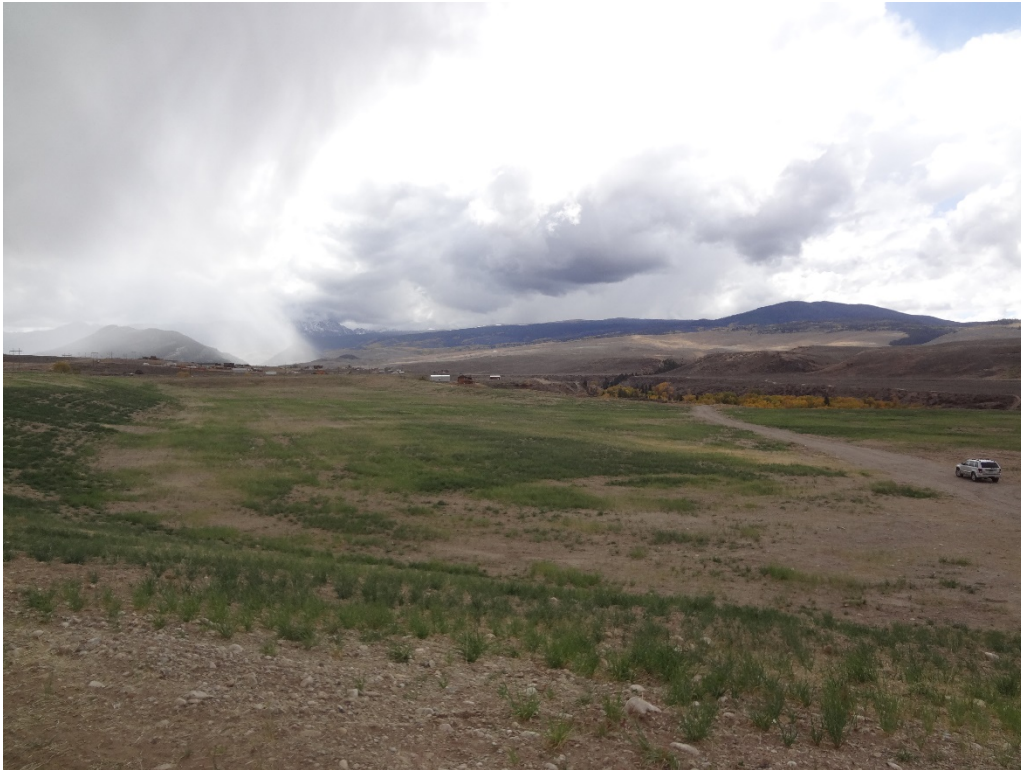
View from the northeast corner of the site looking southwest