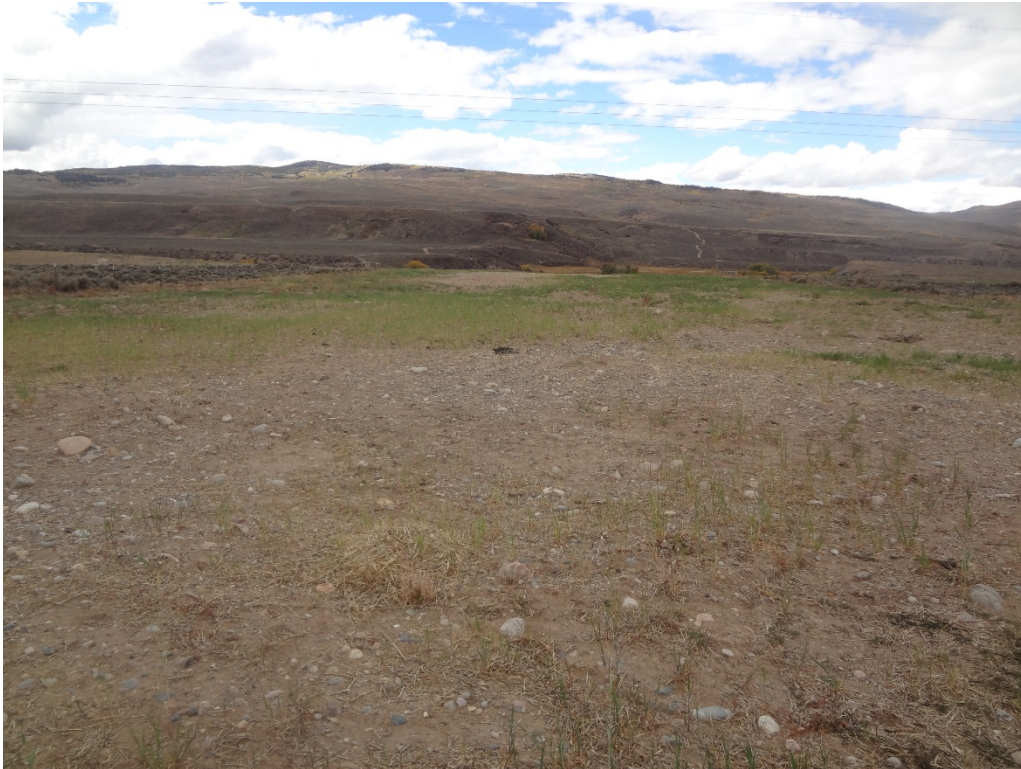
View of former access road area from Hwy 9 looking west