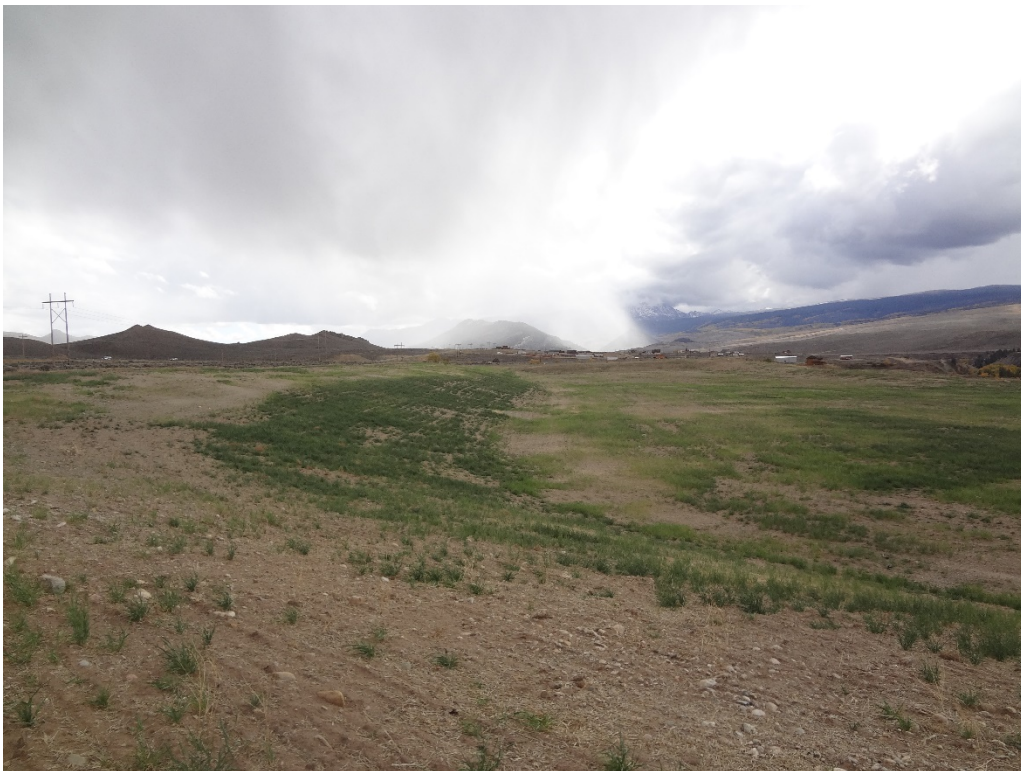
View from the northeast corner of the site looking south