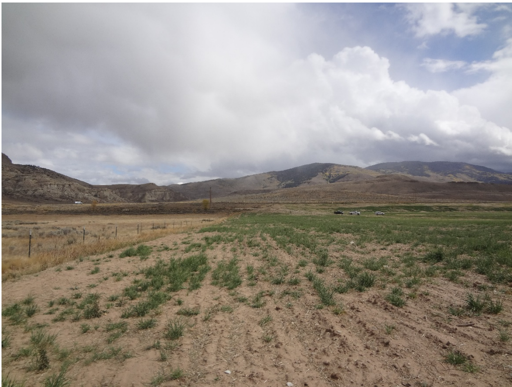
View from northwest corner of the site looking east