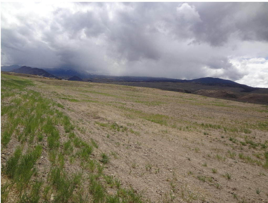
View from the east side of the site looking southwest