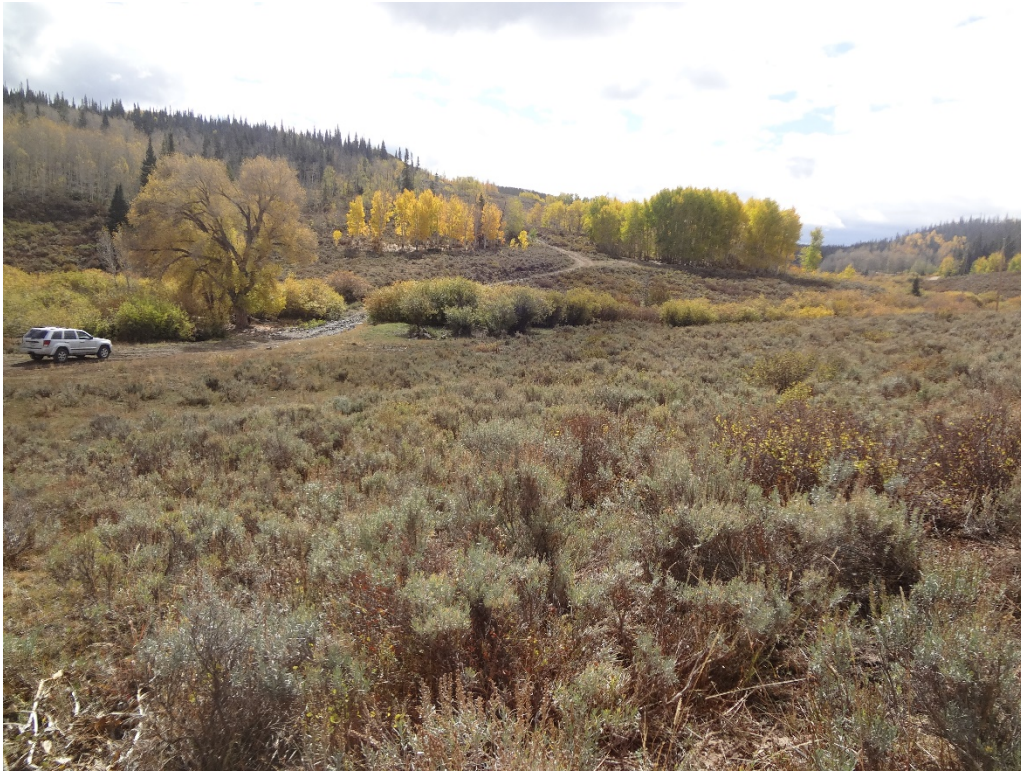
View of amendment area from the north side looking south