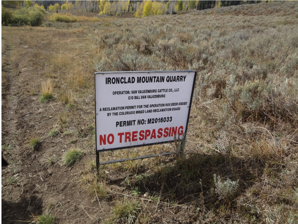
View of Van Valkenburg Quarry mine sign