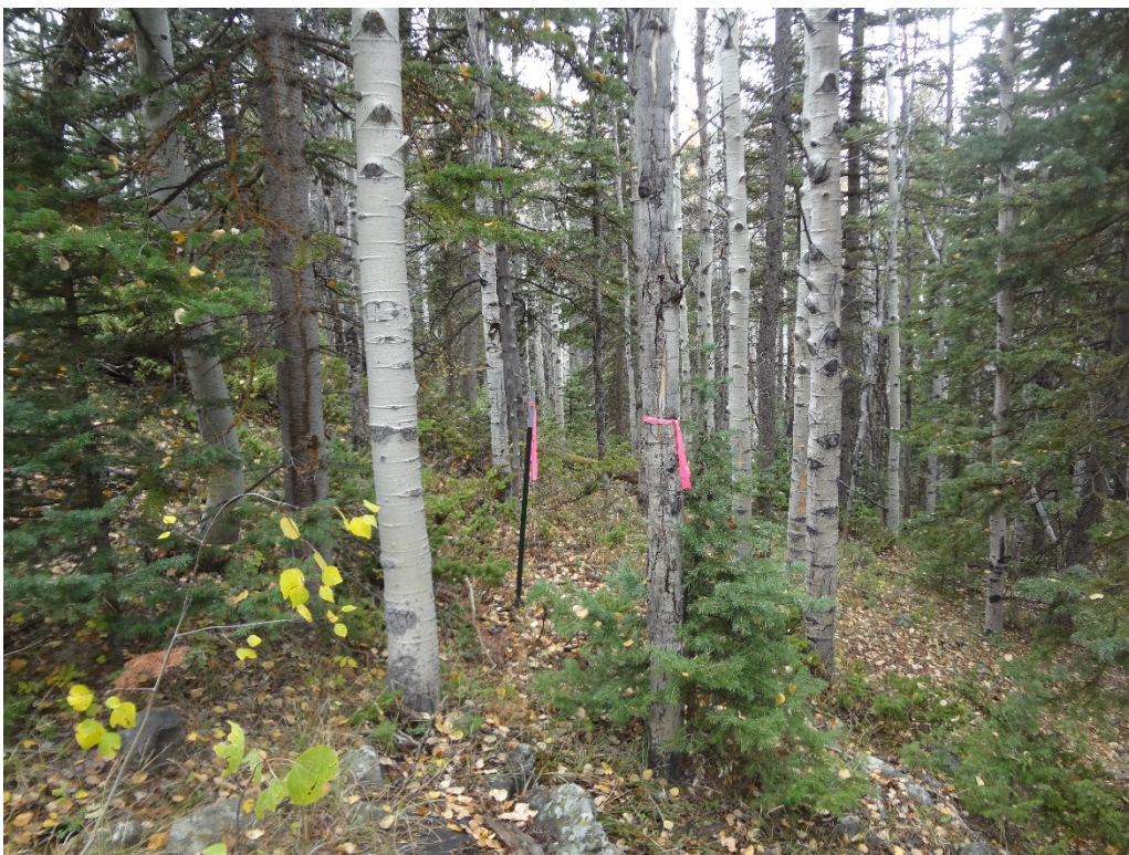
View of the southwest corner marker