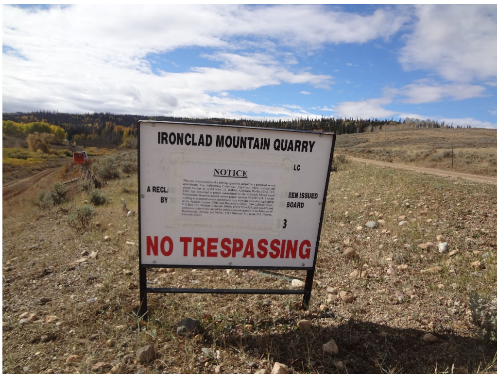
View of the notice sign for the amendment application