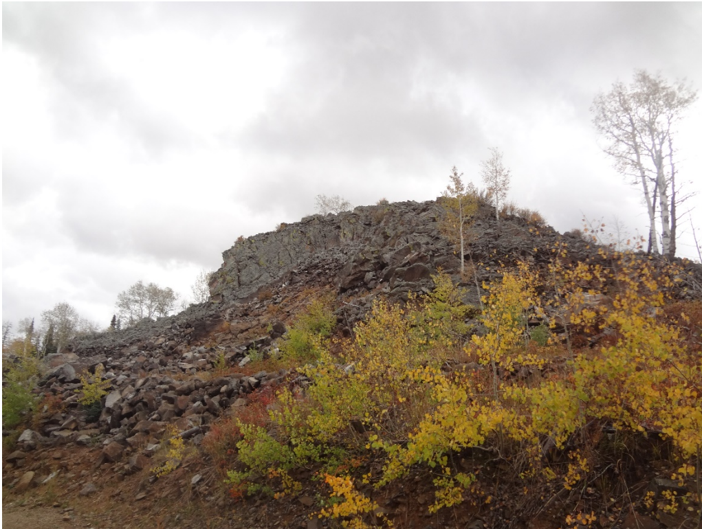
View of highwall from the pit floor looking southeast