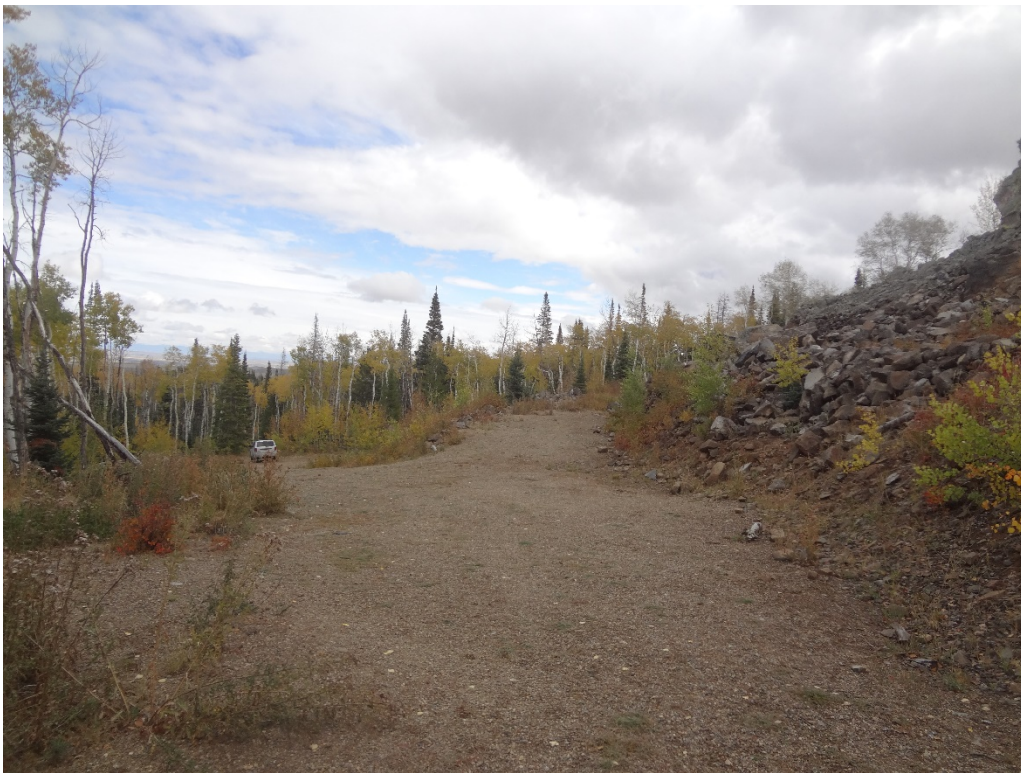
View of pit floor from south site looking northeast