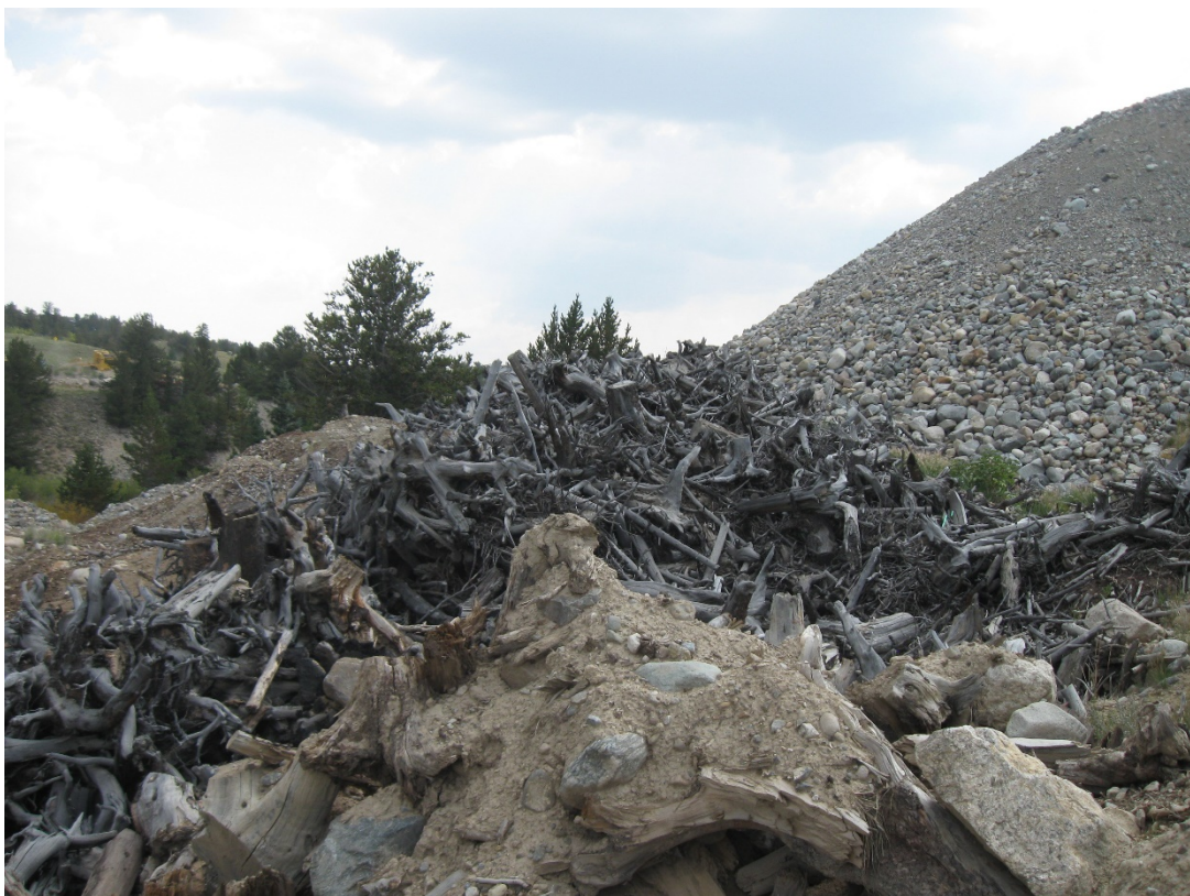
8. Tree stump and slash stockpile. (Note: soil and rock intermixed with vegetation)