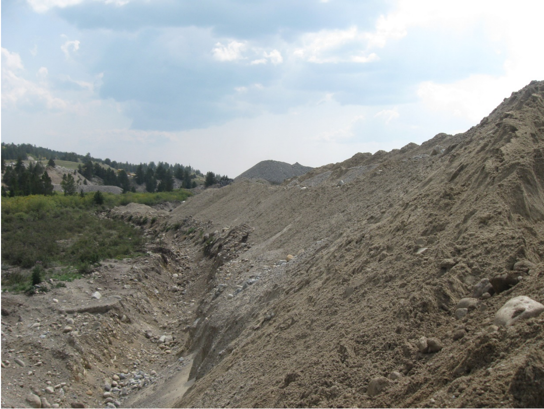
11. Outward facing slope of reclaimed plant settling ponds. (Note: the slope is steeper than 5H:1V)