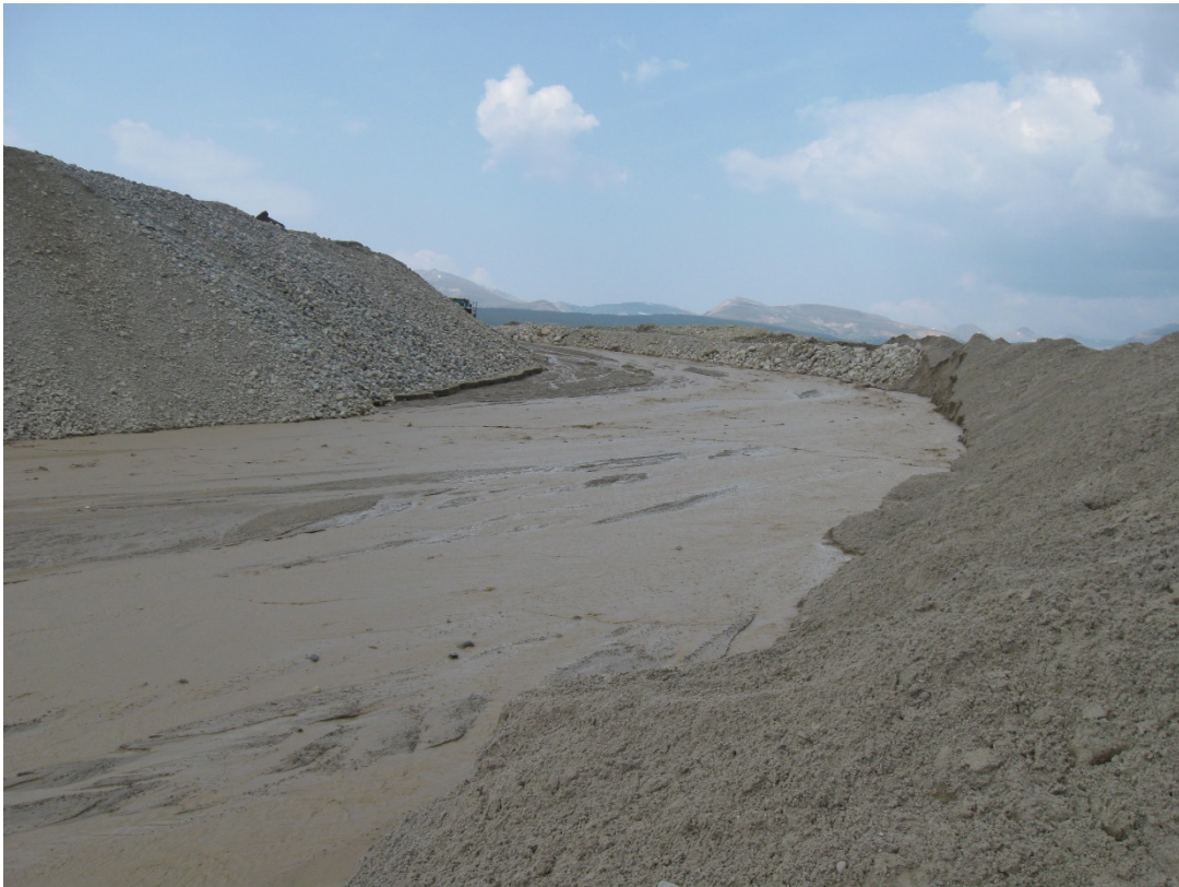
15. Return water from the gold recovery plant.