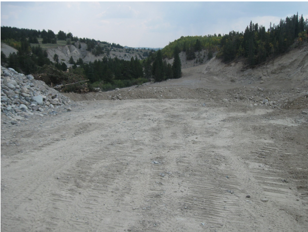
20. Earthen berm across newly constructed access road.