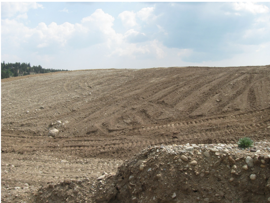
12. Outward facing slope of reclaimed plant settling ponds. (Note: reclaimed slopes are at 3H:1V)