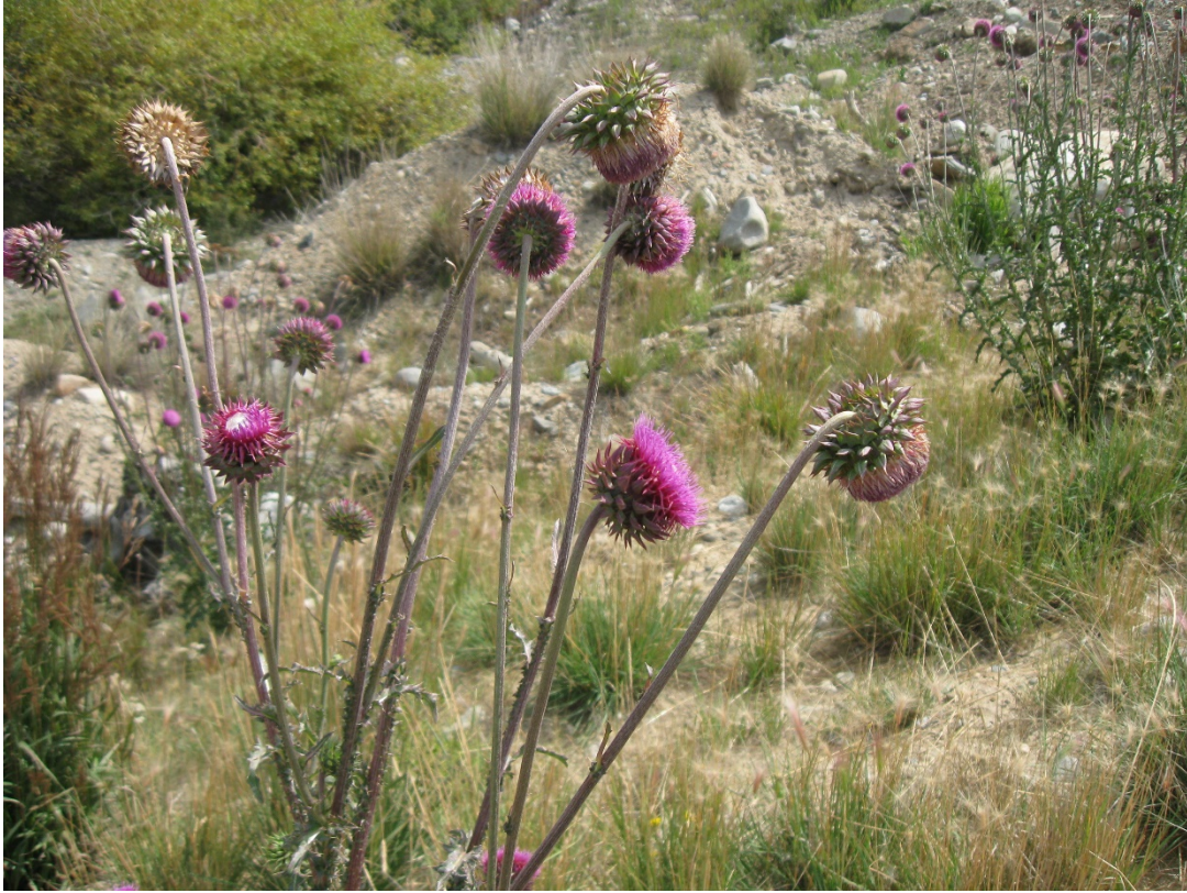
17. Musk thistle.