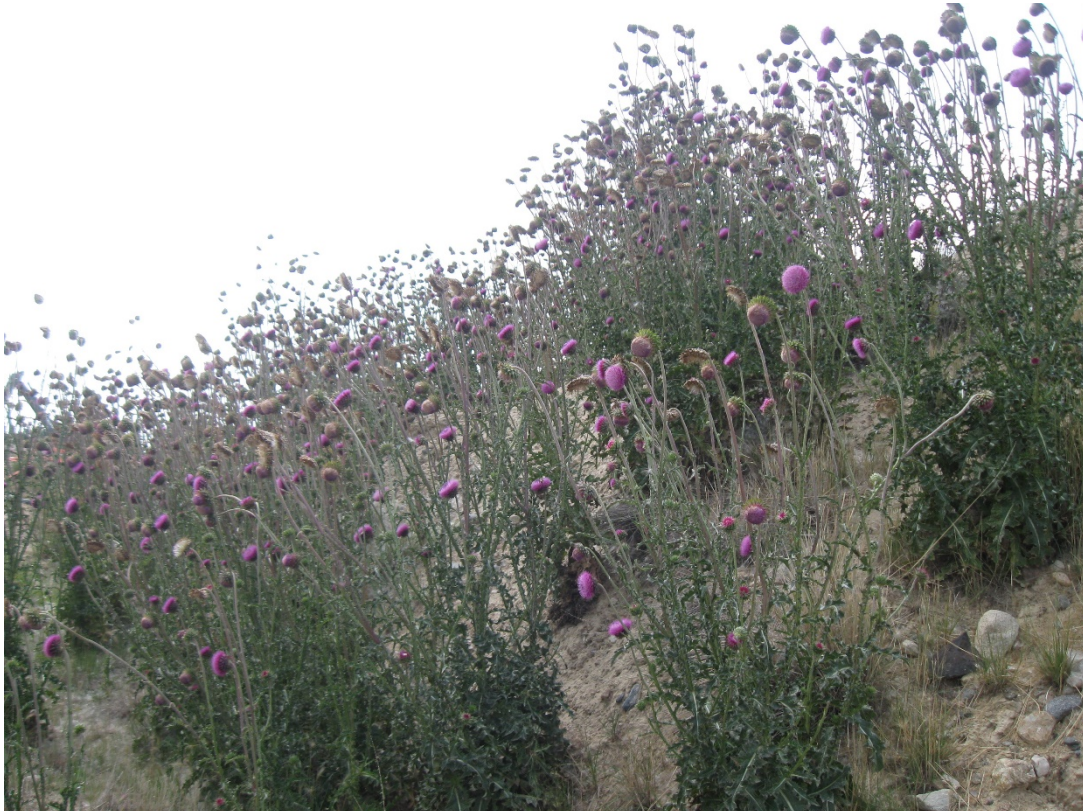
16. Musk thistle.