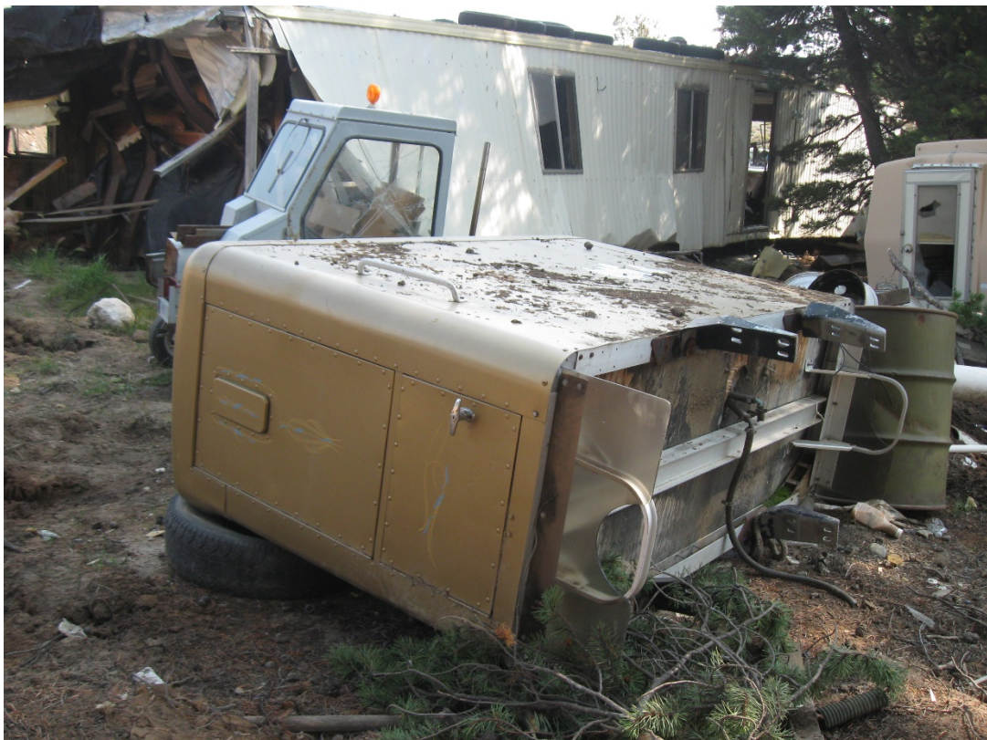
2. Vehicles and structures.