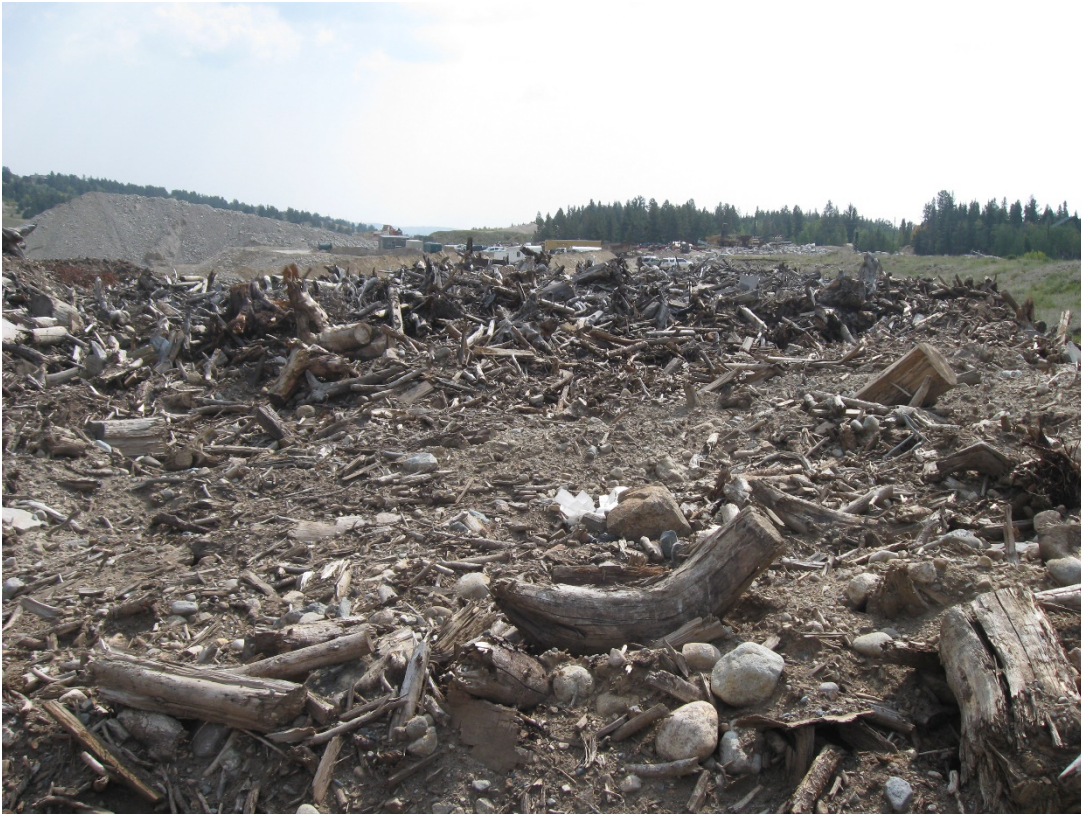
7. Tree stump and slash stockpile. (Note: soil and rock intermixed with vegetation)