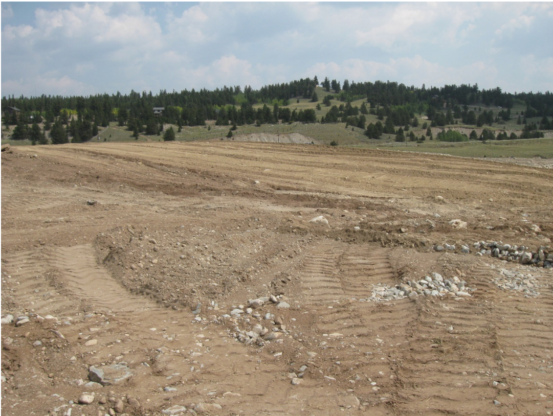
13. Top of reclaimed plant settling ponds.