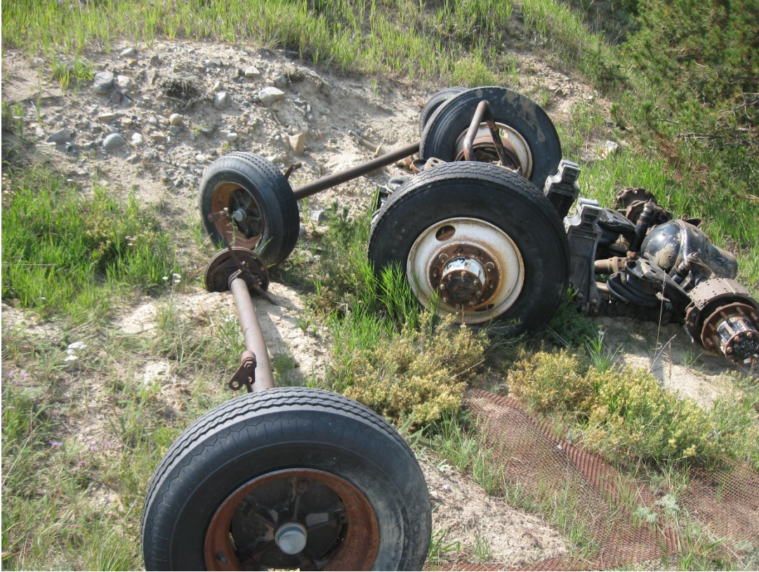
3. Vehicle parts.