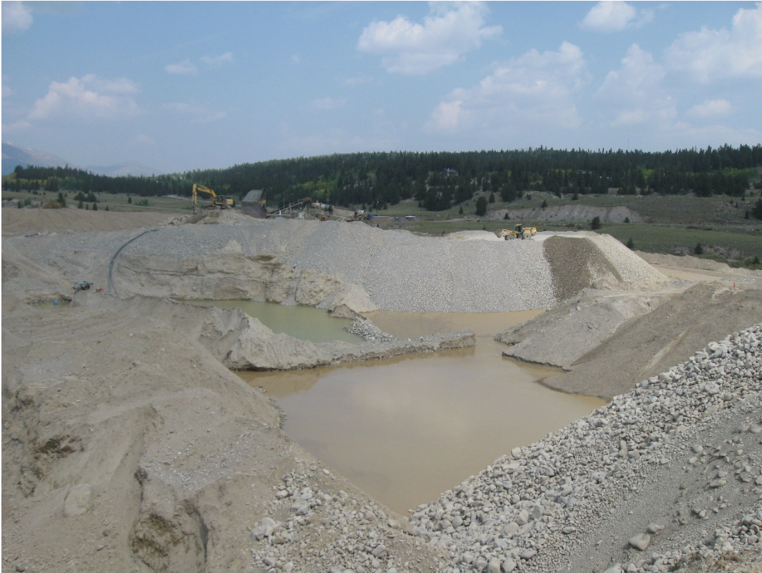
9. Gold recovery plant and settling ponds.