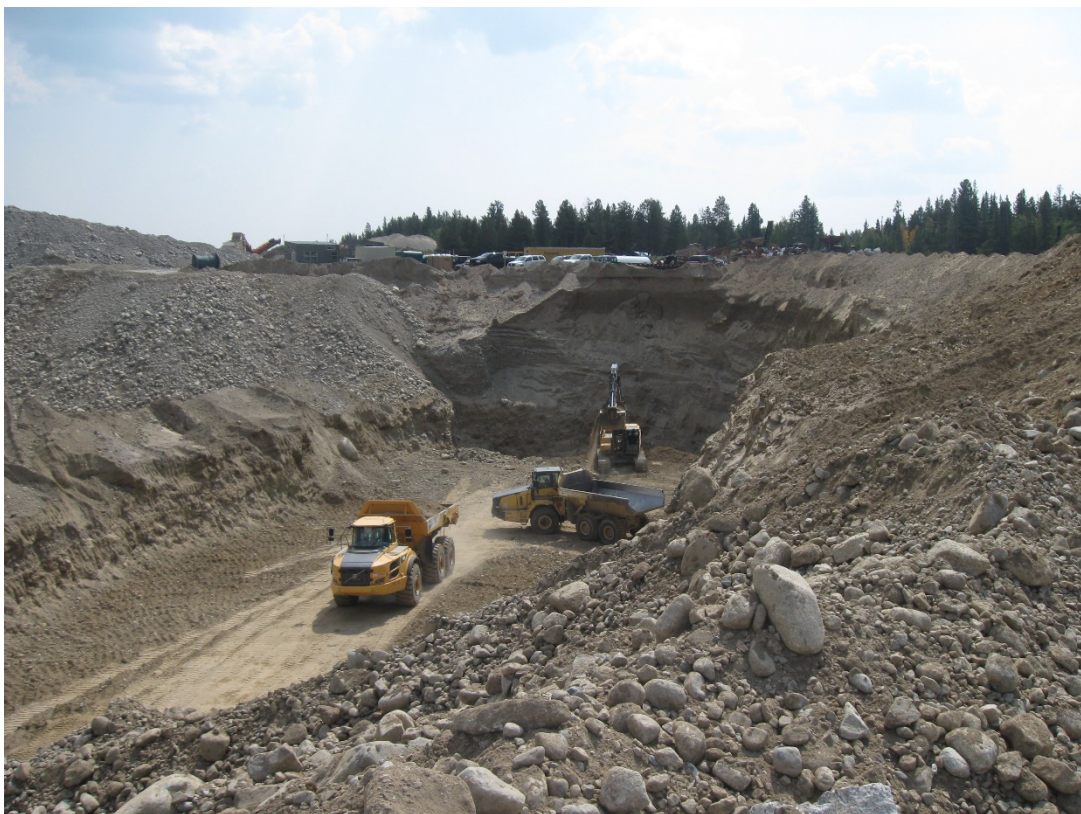
10. Highwall. (Note: no benches constructed in highwall)