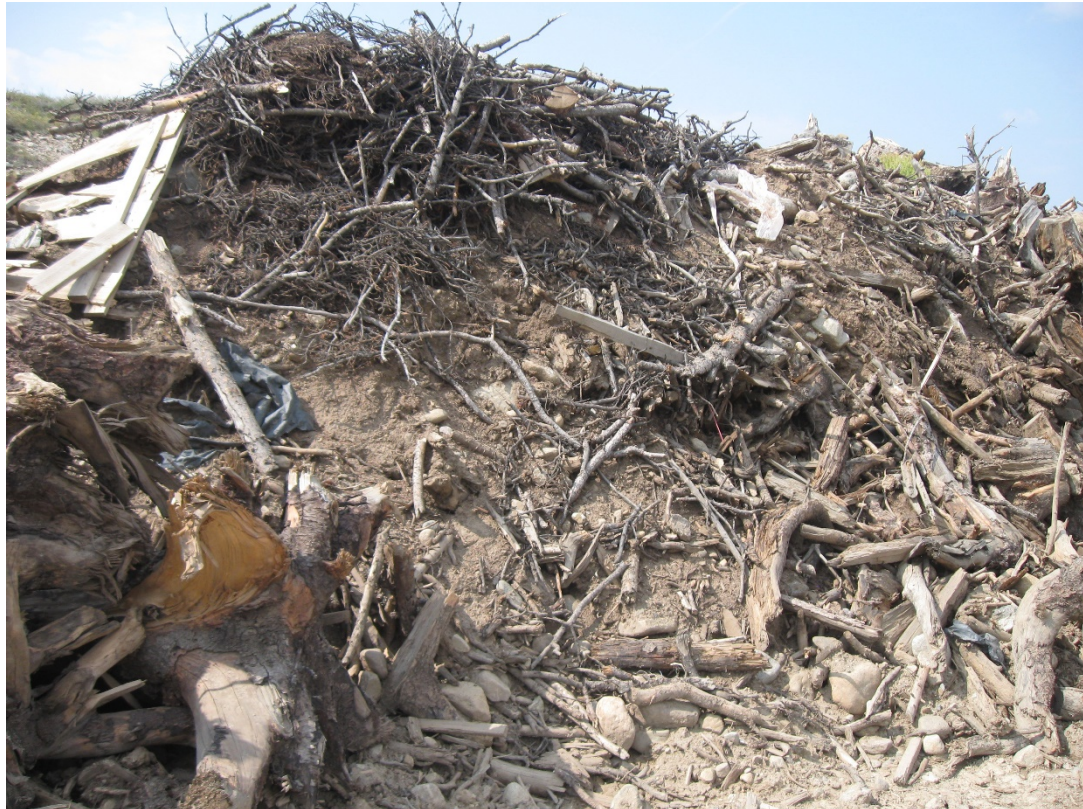
6. Tree stump and slash stockpile. (Note: soil and rock intermixed with vegetation)