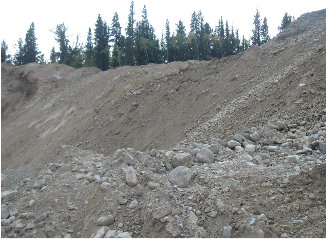
21. Recently affected lands in area designated as 'Old Pre-law Hydraulic Mining Disturbance.