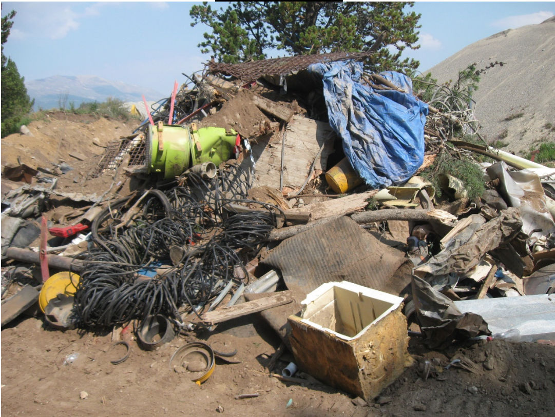
1. Miscellaneous refuse.