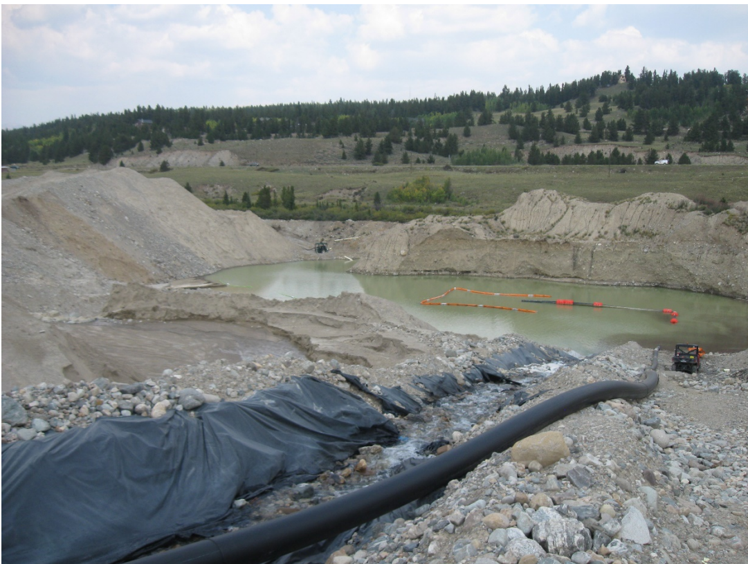
14. Water infiltration pond.