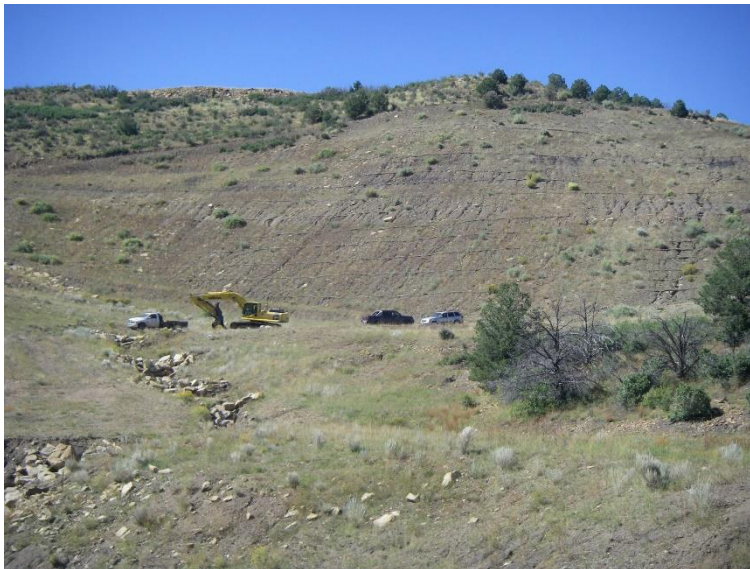
Hillside above Pond 6

Number of Partial Inspection this Fiscal Year: 2