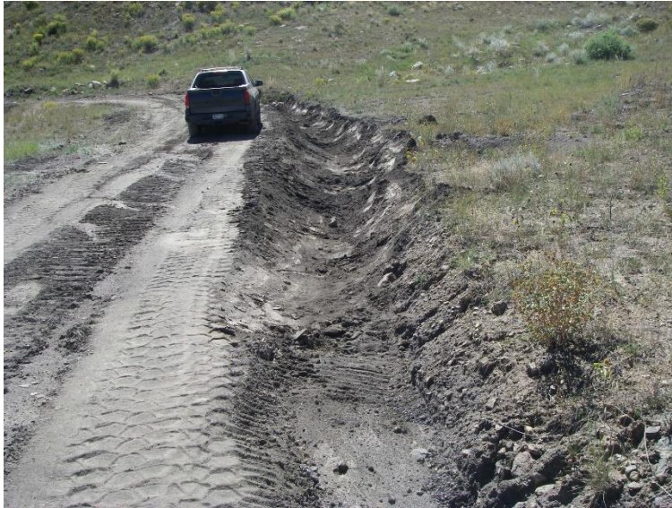
Roadside ditch on way to Pond 6