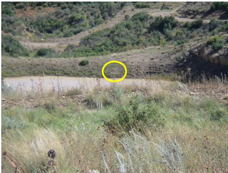
Fill 9 (repair within circle)

Number of Partial Inspection this Fiscal Year: 2