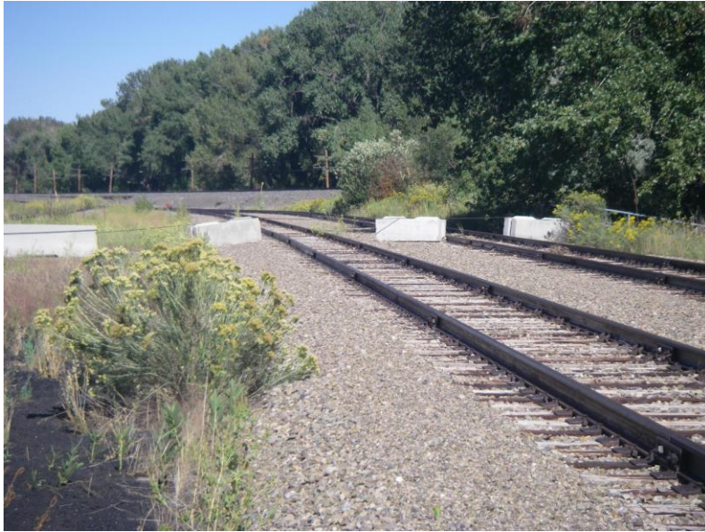
East end of loadout