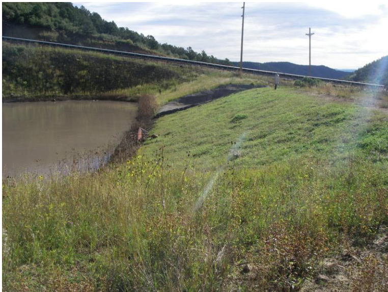
Pond 08 embankment

Number of Partial Inspection this Fiscal Year: 2