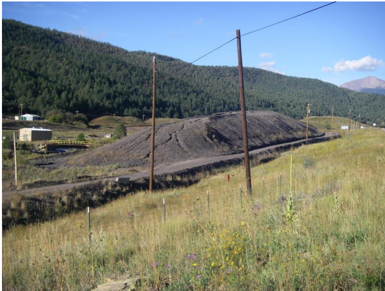
East and north sides of DWDA#2

Number of Partial Inspection this Fiscal Year: 2