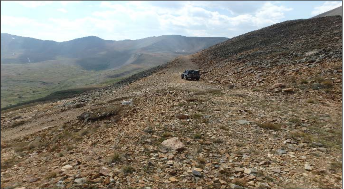
1. Upper access road.