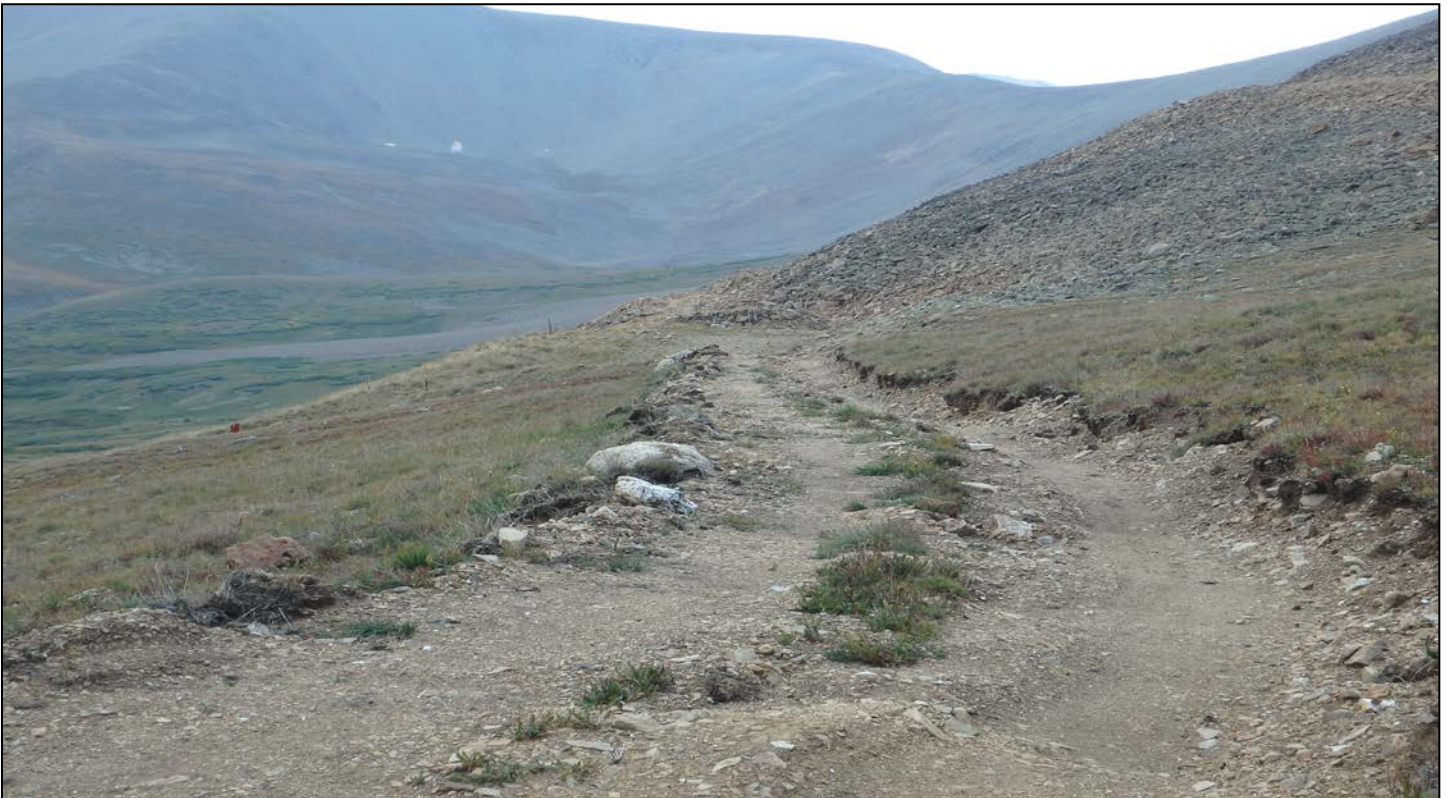
2. Lower access road.