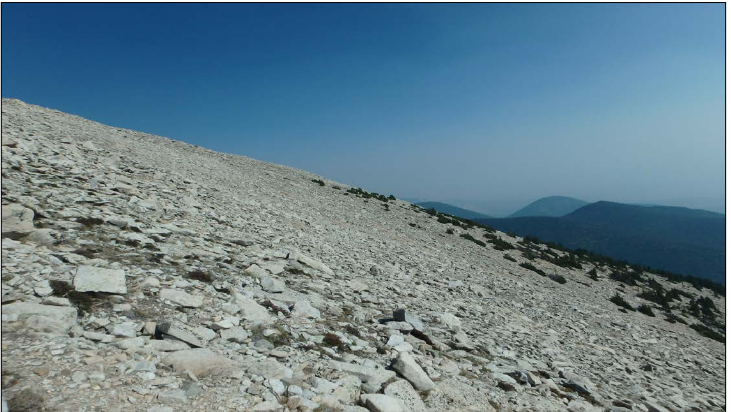
2. Overview of site.