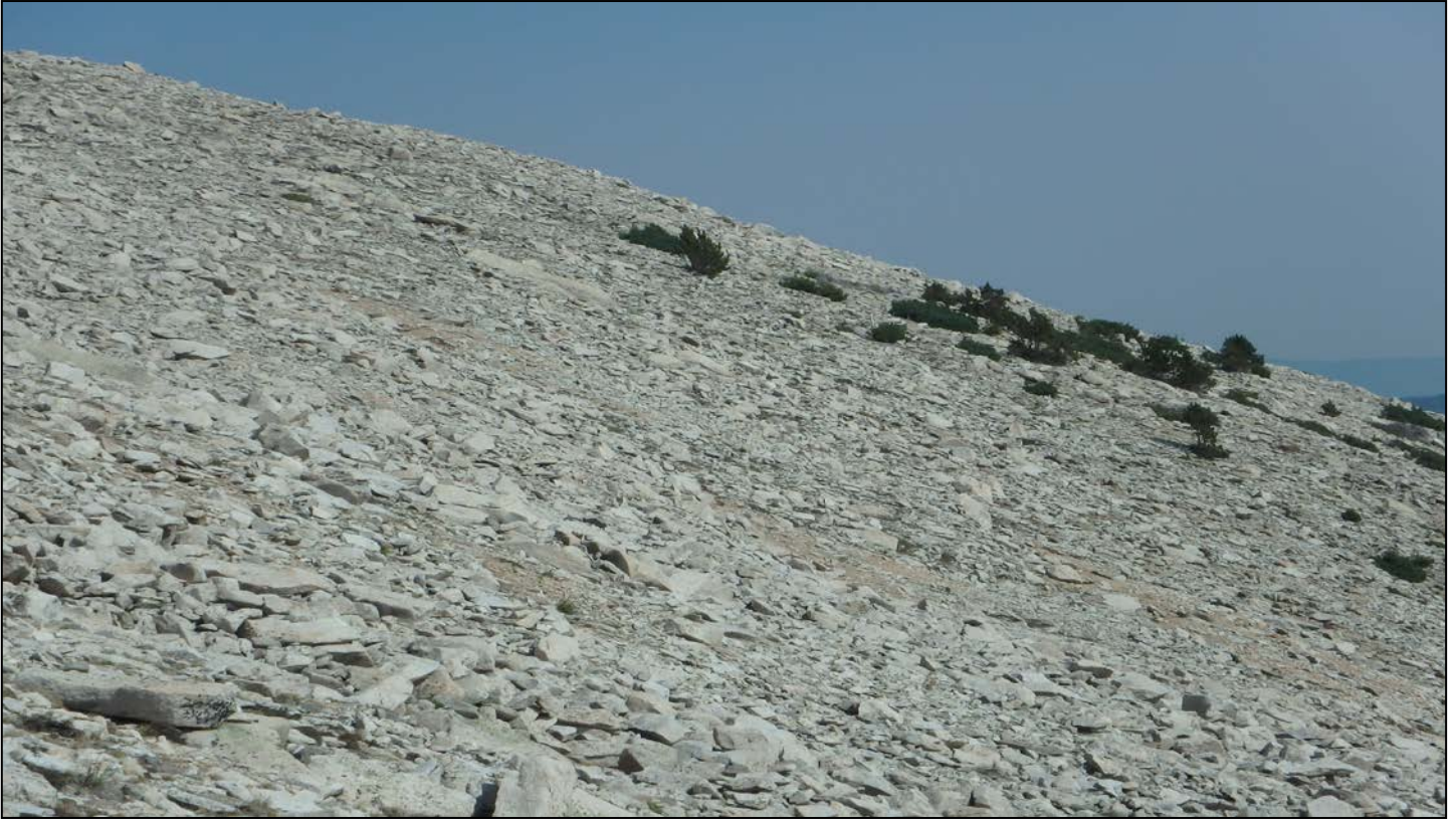
1. Overview of site.