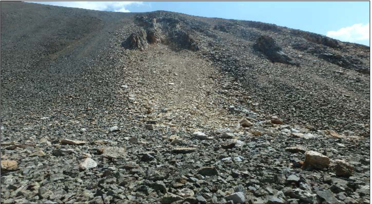
1. Overview of site, photo taken from bottom of slope.