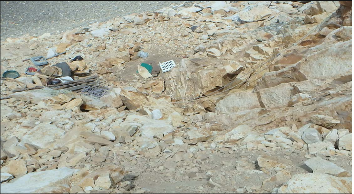
3. Tools/equipment on site.

Brian Busse 1437 G Sreet Salida, CO 81201