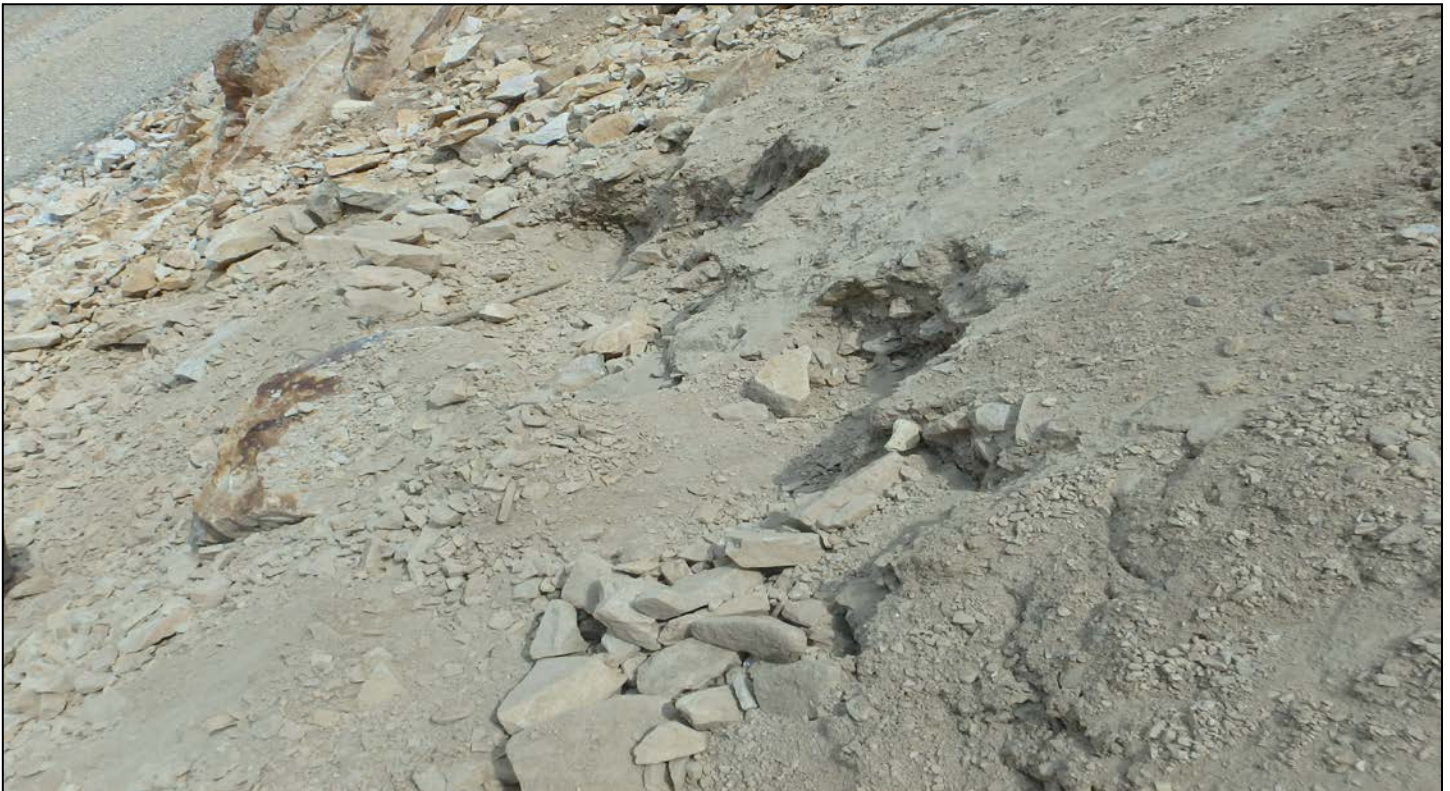
2. Mining bench/excavation area.