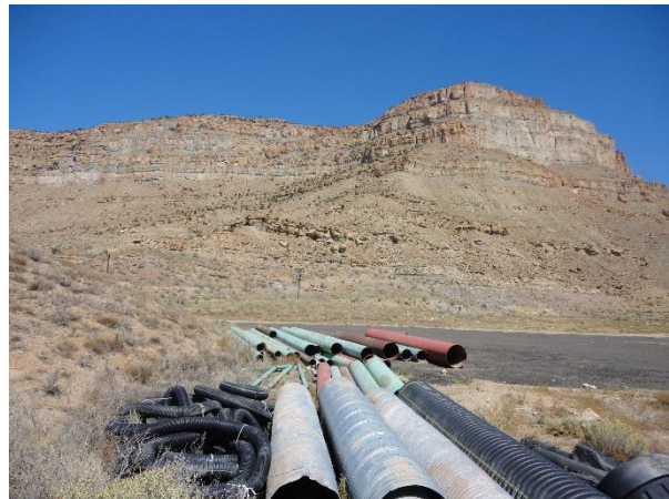
Photo 4: pipes stores at gravel parking lot in Sec.27 (this area has previously received Phase III bond Release, and has been approved to be removed from the permit area.)

Number of Partial Inspection this Fiscal Year: 3