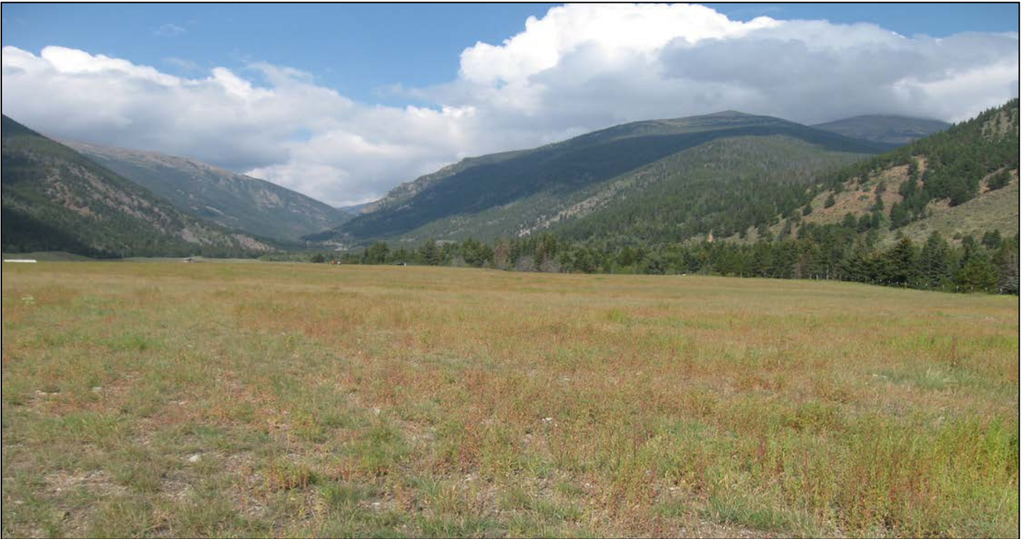
1. Overview of Phase II, facing west.