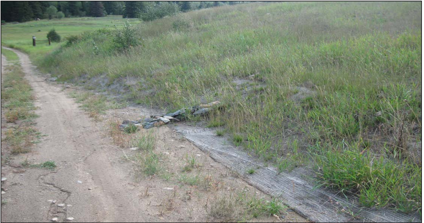
7. Erosion repair along access road.