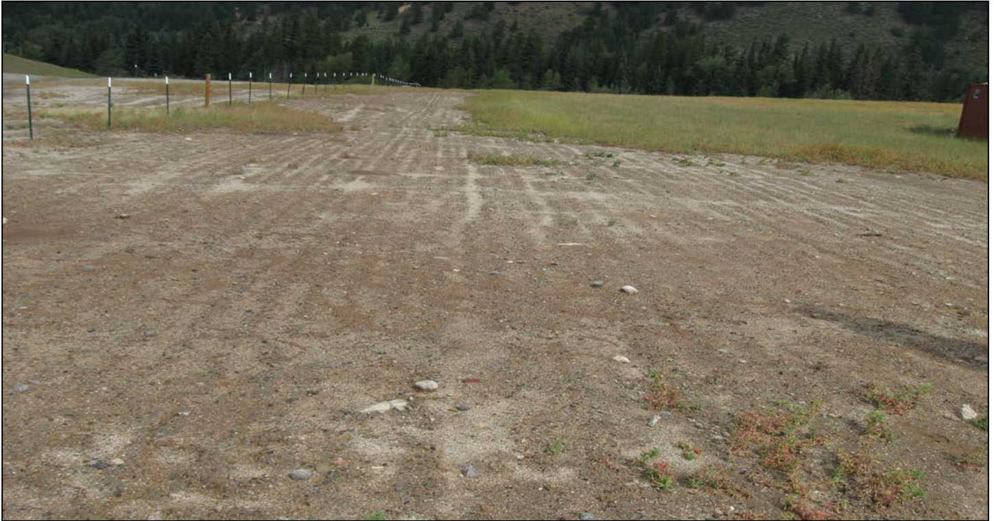
5. Area requiring revegetation, west side of Phase II.