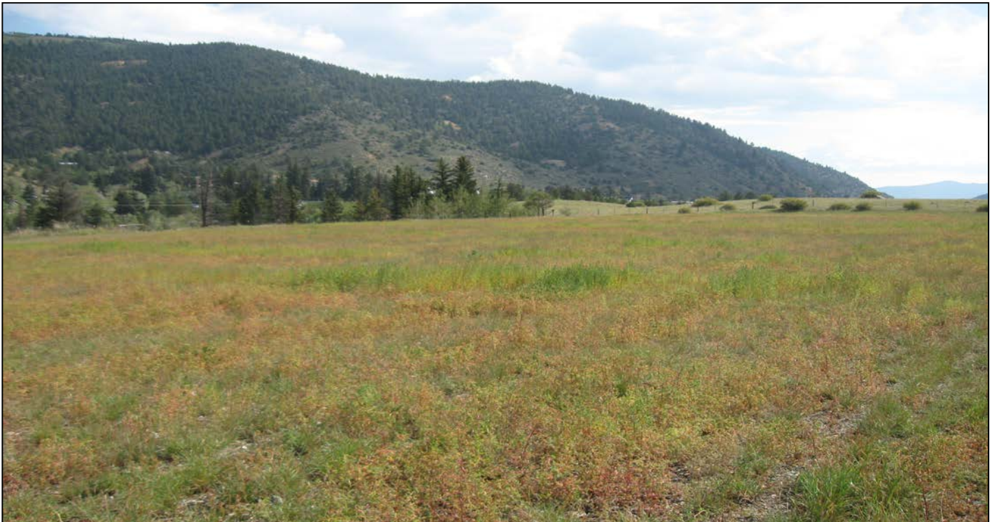
2. Overview of Phase II, facing east.