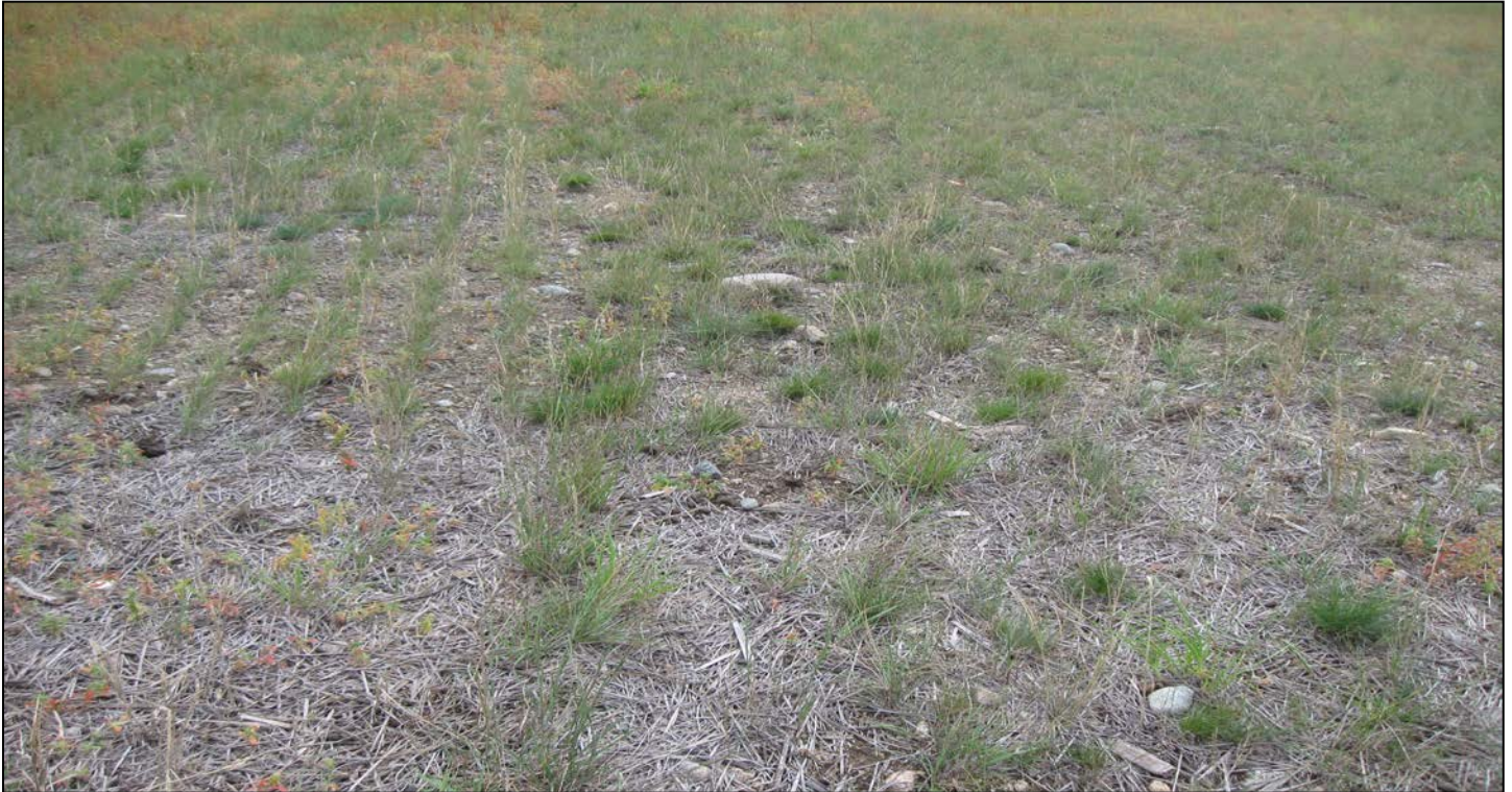
3. Vegetation establishment in Phase II.