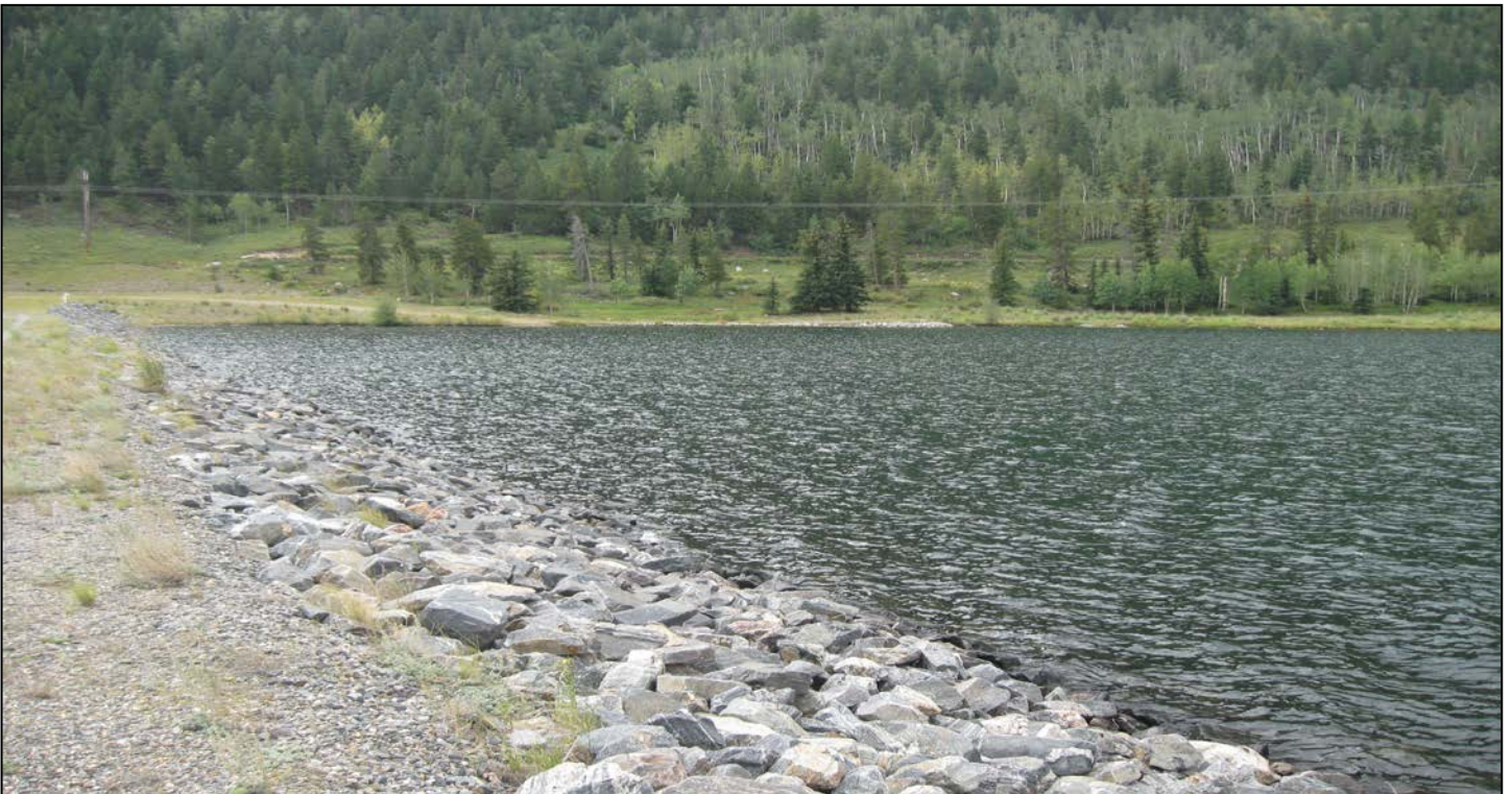
10. Overview of reservoir in Phase I.