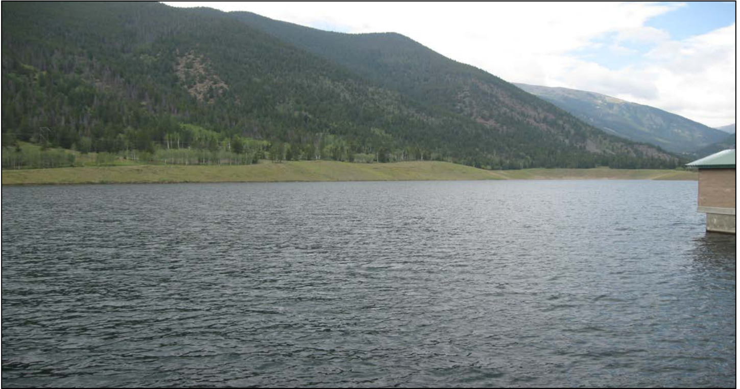
9. Overview of reservoir in Phase I.