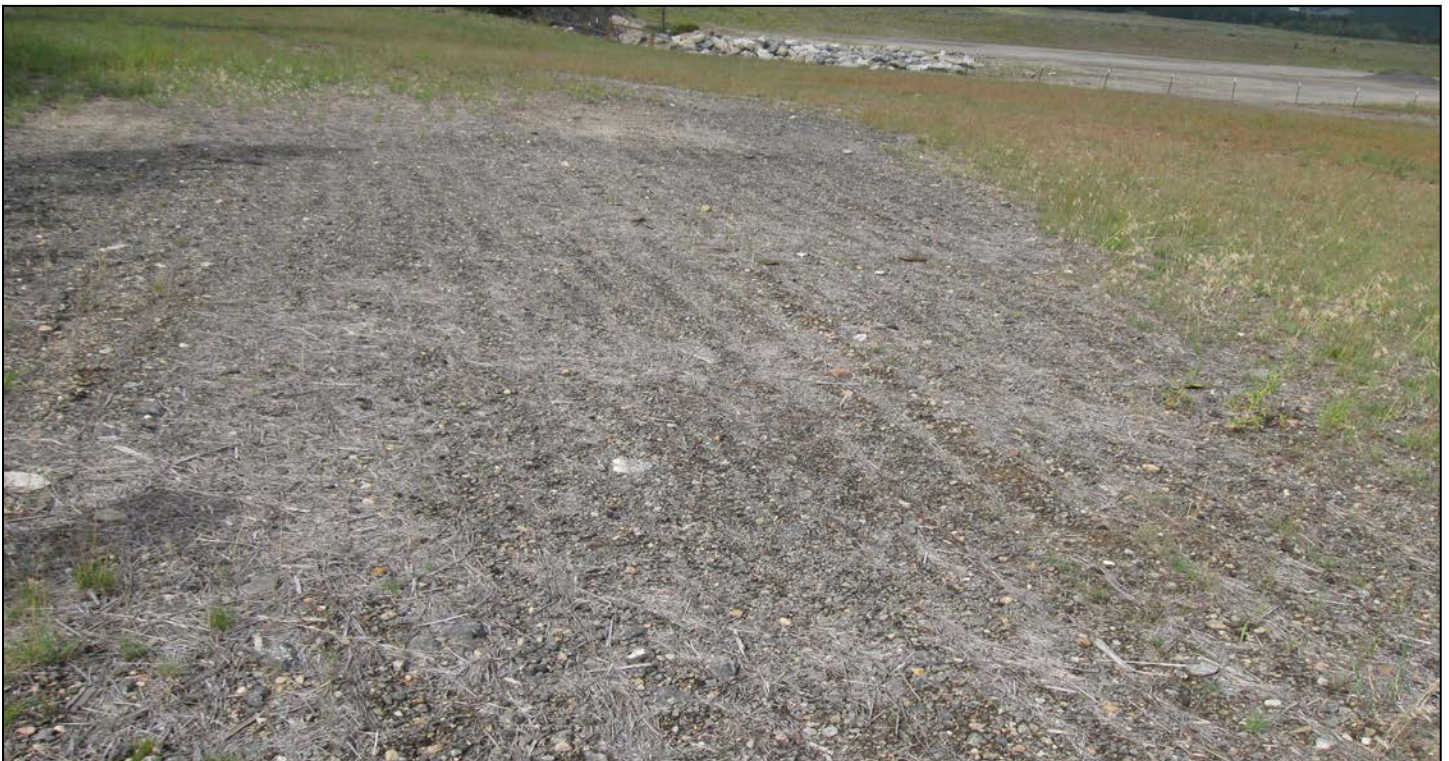
4. Area requiring revegetation, southwest corner of Phase II.