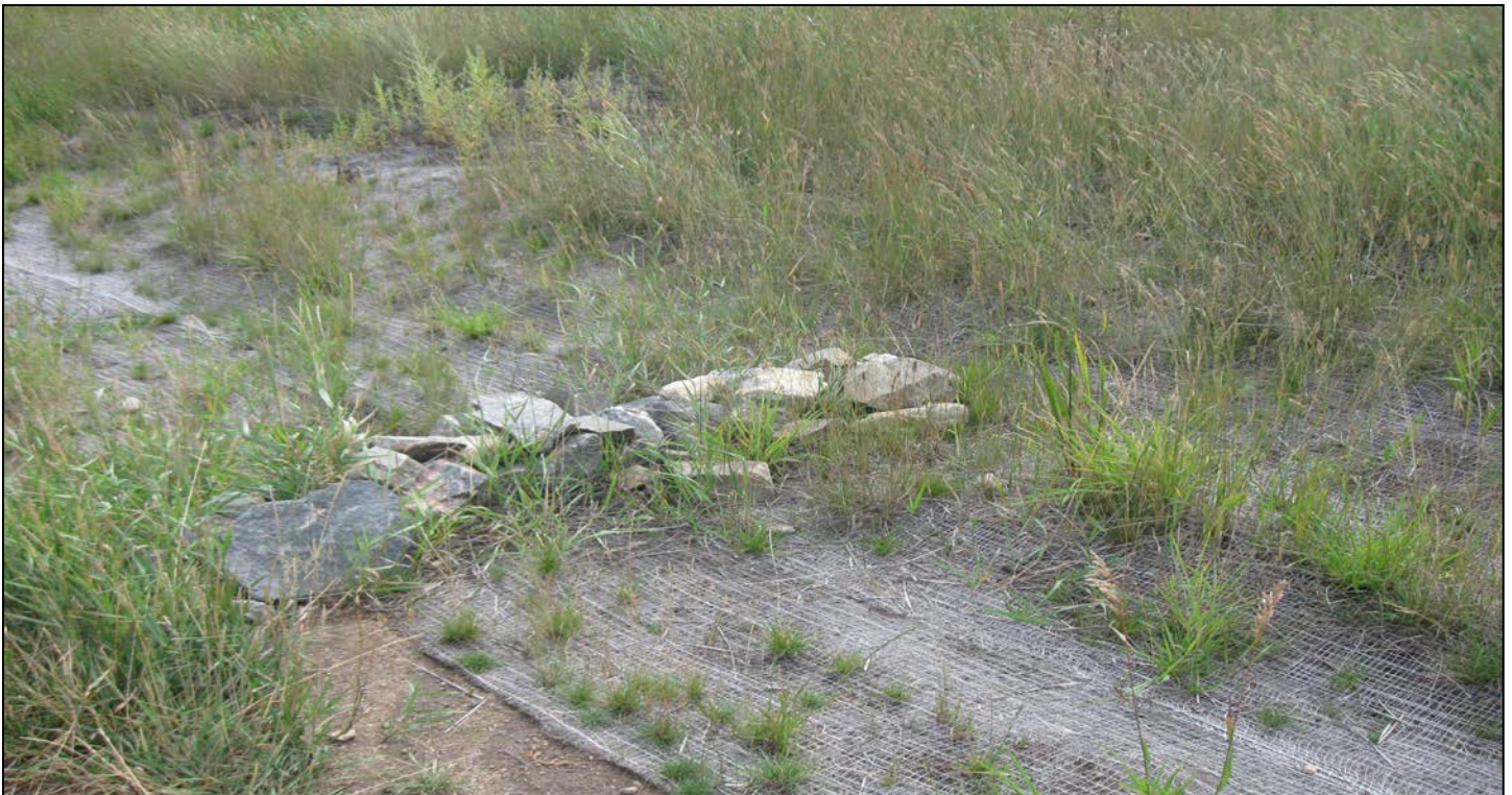
8. Erosion repair along access road.