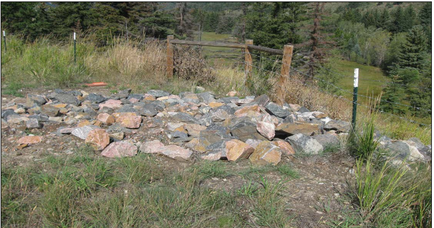
6. Erosion repair along northeast corner of Phase II.