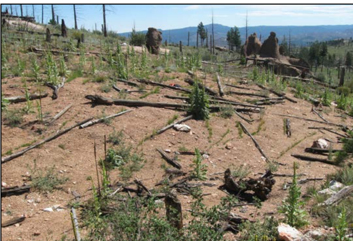
5. Overview of reclaimed site.