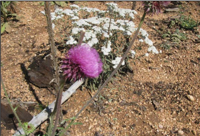
1. Musk thistle.