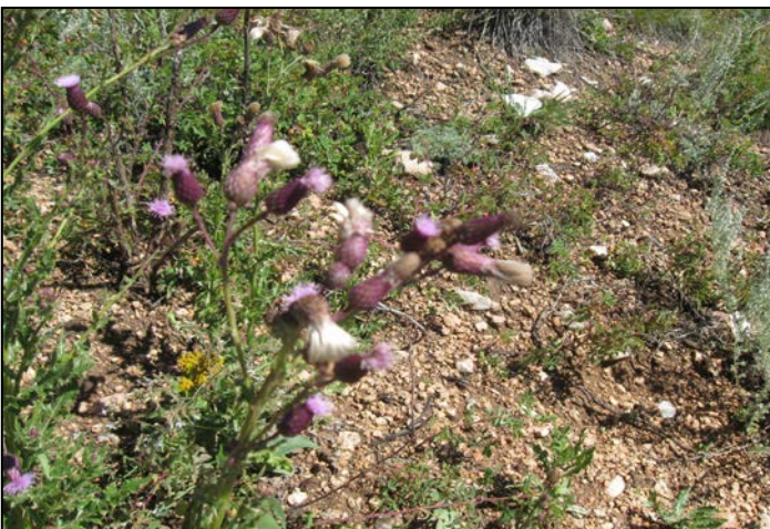
3. Canada thistle.