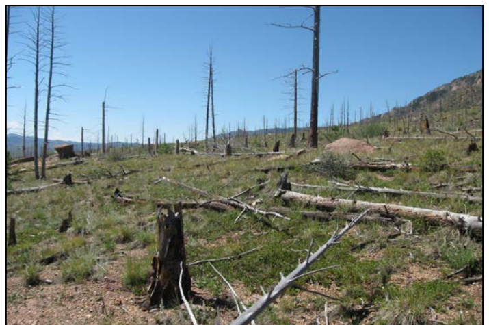
6. Representative vegetation on unaffected surrounding area.