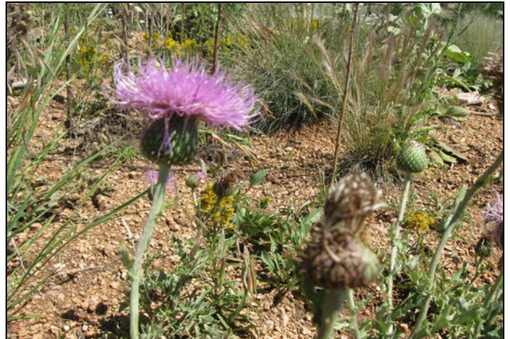
2. Bull thistle.