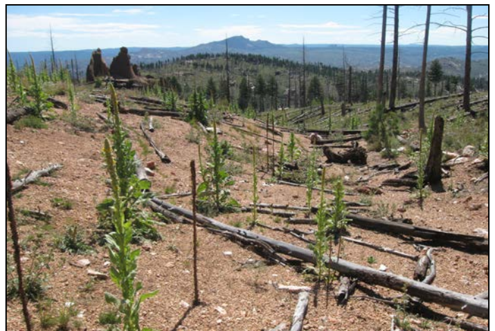
4. Overview of reclaimed site.