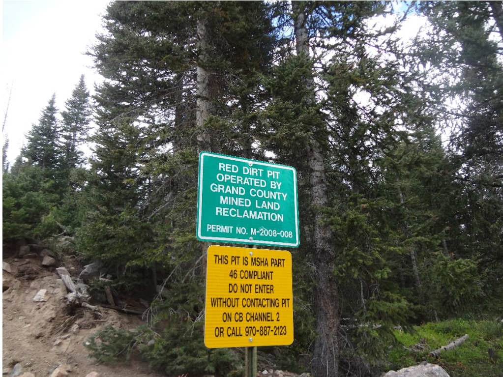
Red Dirt Pit mine sign