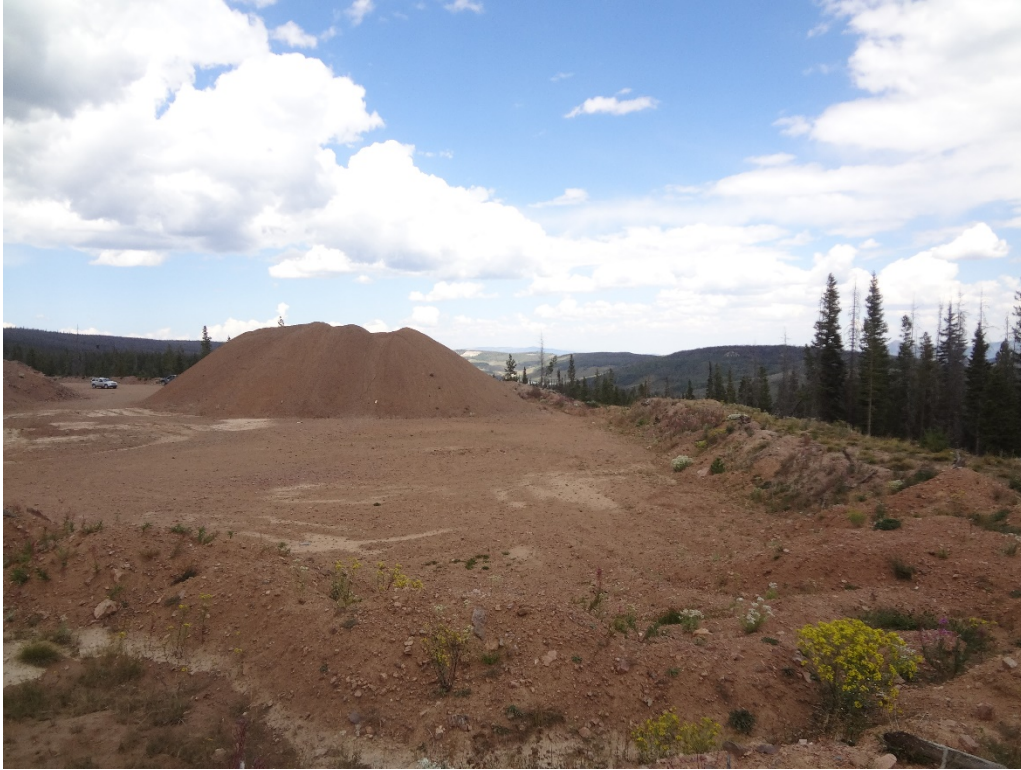
View of the pit floor and stockpile from the southeast corner of the site looking north