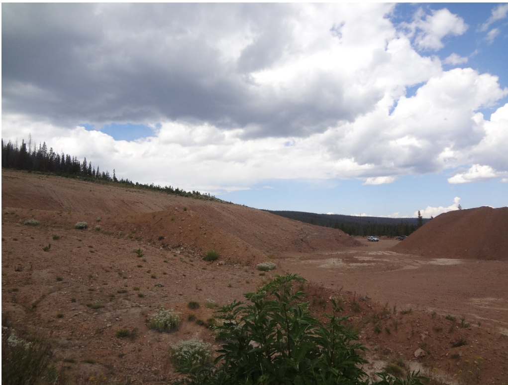
View of the highwall and pit floor from the southeast corner of the site looking northwest