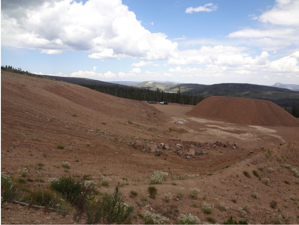
View of the temporarily sloped mine highwall looking north