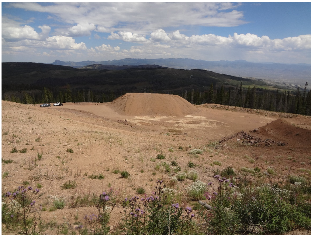
View of the pit floor from the southwest corner of the mining disturbance