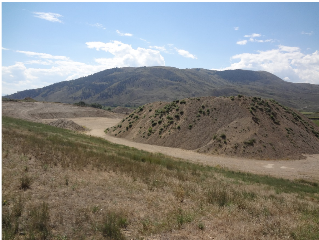
View of pit from the northwest corner looking southeast