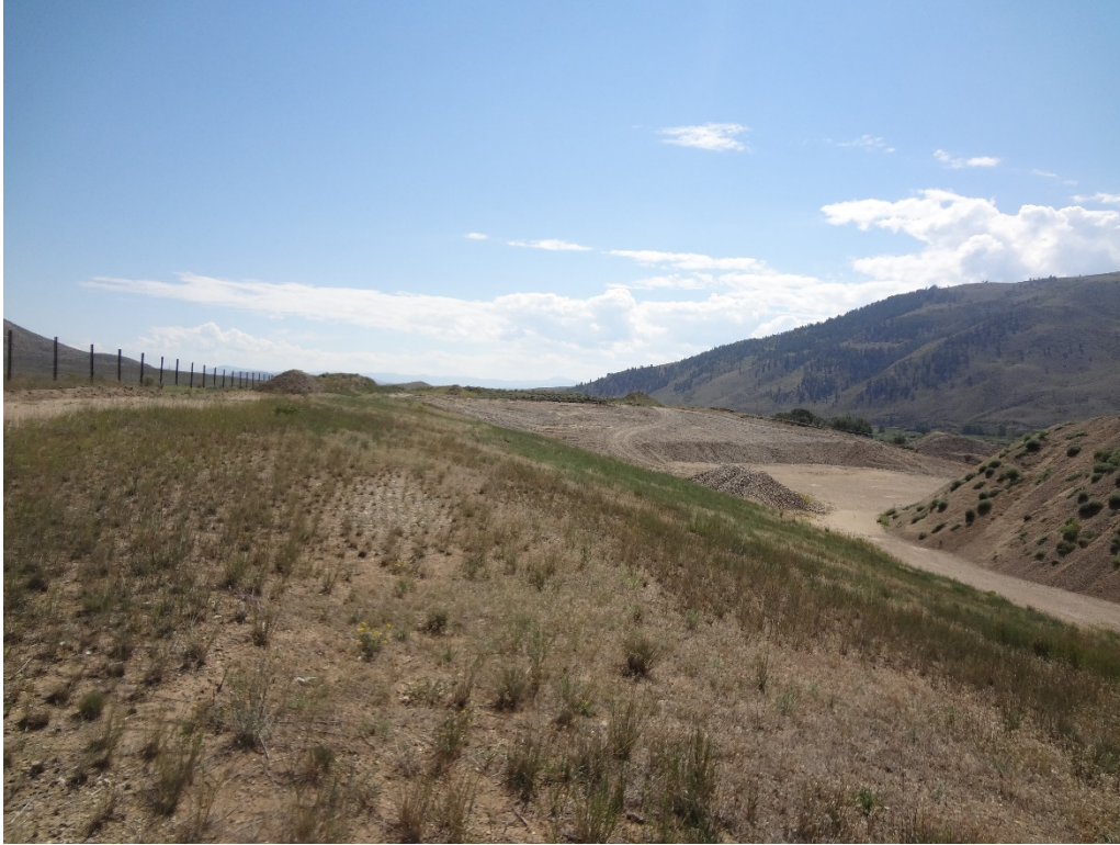
View of pit from the northwest corner looking east