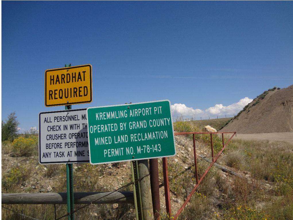
Kremmling Airport Pit mine sign