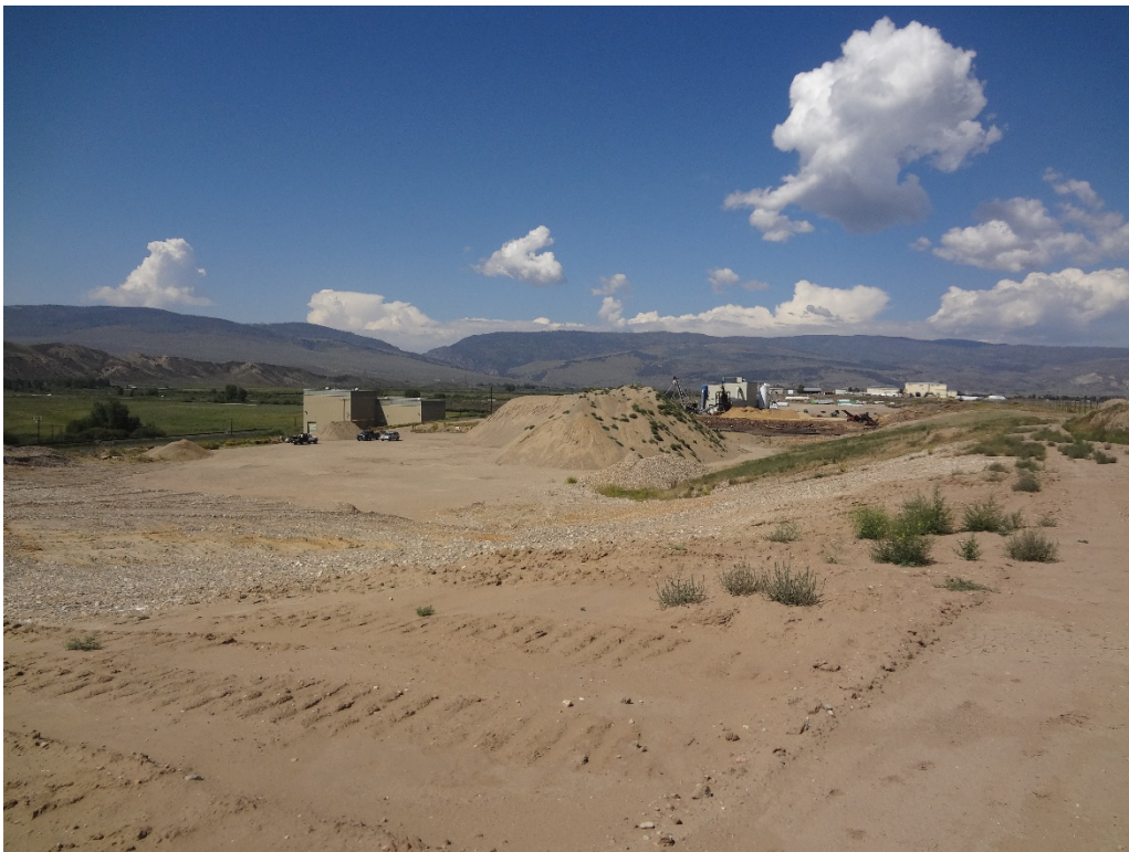
View of pit from northeast corner of mining disturbance looking southwest