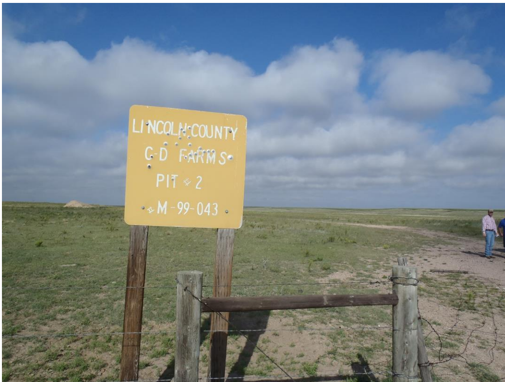
Photo 3. Permit sign.