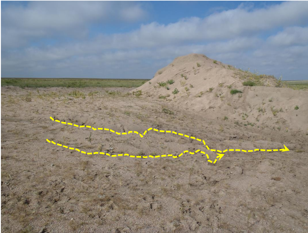
Photo 2. Erosion rills – south side (material stockpile beyond – looking west).