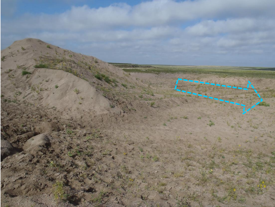
Photo 1. Arikaree River bottom (right) and material stockpile (left) (looking west). Arrow shows river flow direction