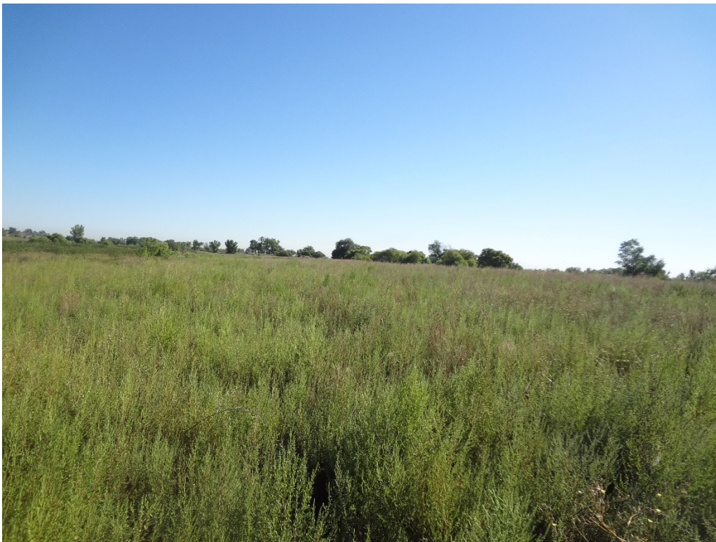
Area 2 looking north at the middle portion of the area