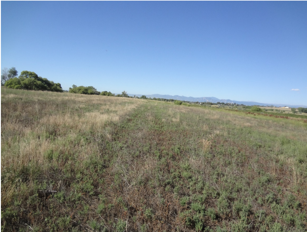
Area 2 looking south at the north portion of the area