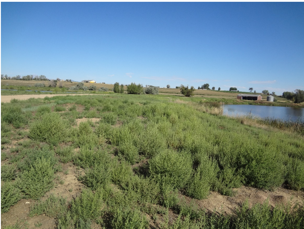
Area 3 looking west along the south shoreline of the north lake