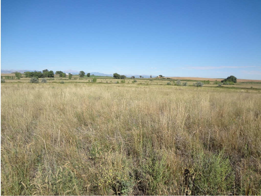
Area 2 looking west at the south portion of the area