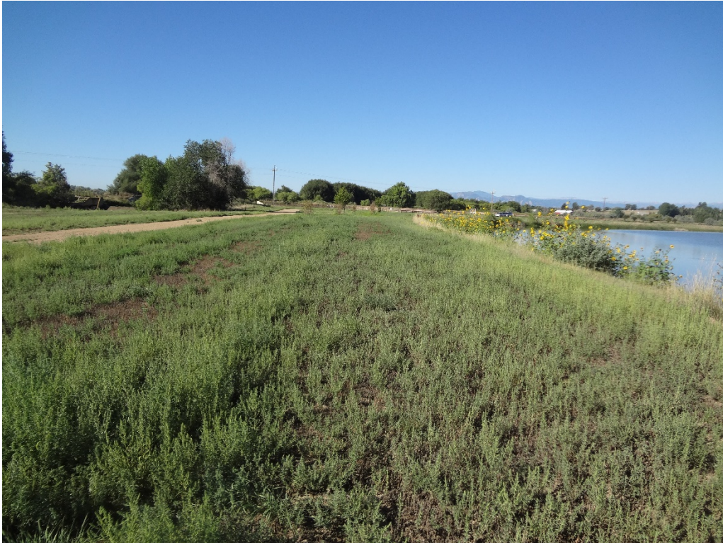
Area 3 looking south along the east shoreline of the south lake