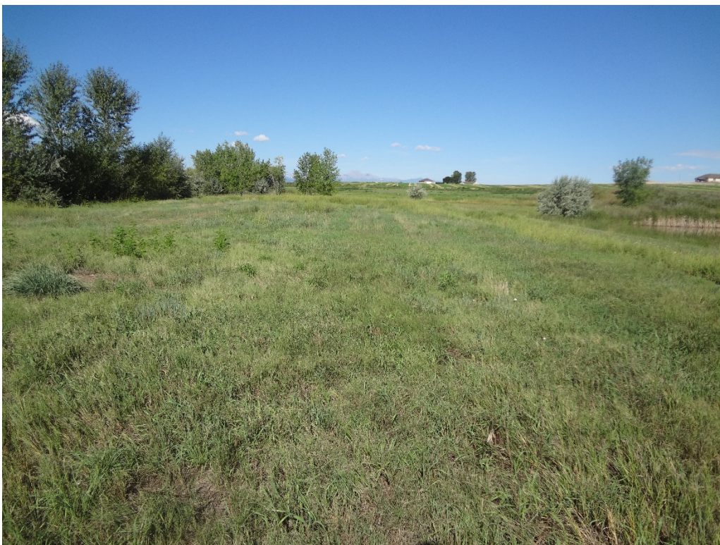
Area 1 looking west from the east side of the area