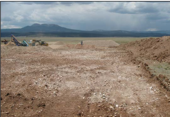
3. Area stripped of topsoil.