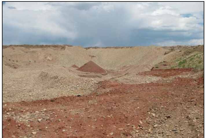
4. Pit walls along perimeter of mining Cell A.