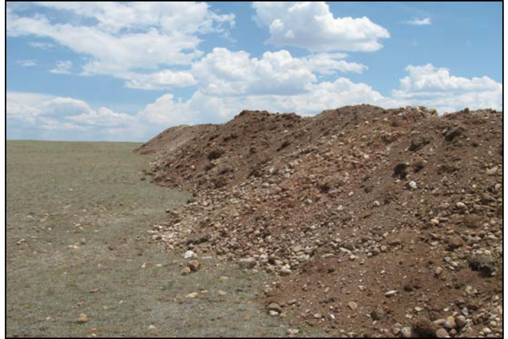
2. Topsoil stockpile along perimeter of mining Cell A.