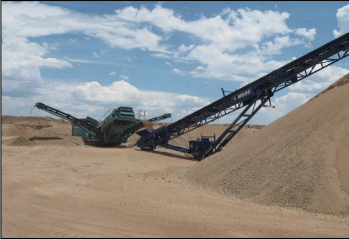
1. Screening of sand and gravel on pit floor.