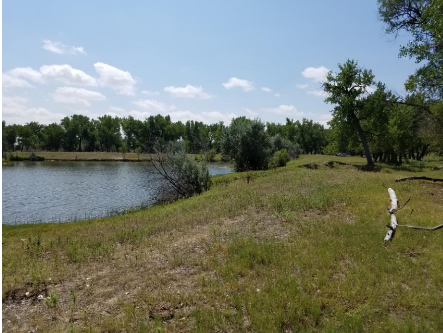
Figure 5. From the northwest corner of the pit looking south.