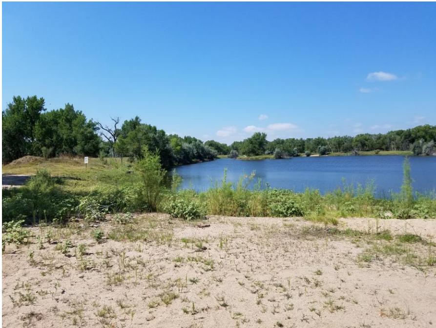
Figure 2. View from the southeast corner of the pit looking southwest.