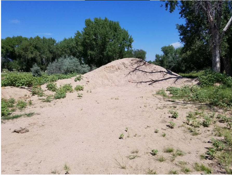
Figure 1. Small stockpile of "pit-run" material east of the current pit area.