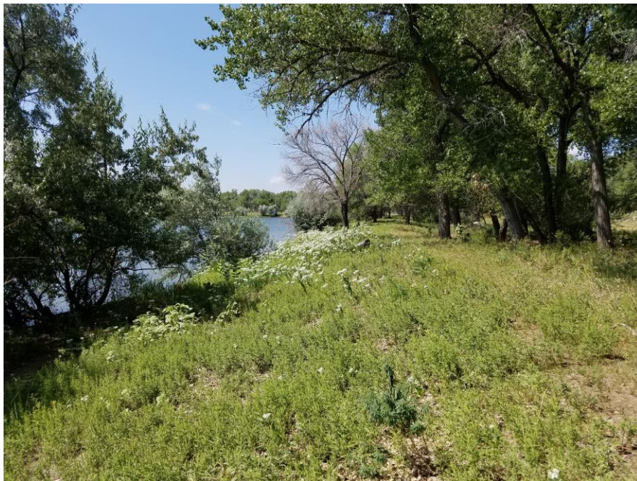
Figure 4. From the northeast end of the pond looking southwest.