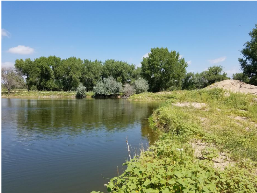
Figure 3. From the east end of the pond looking north.