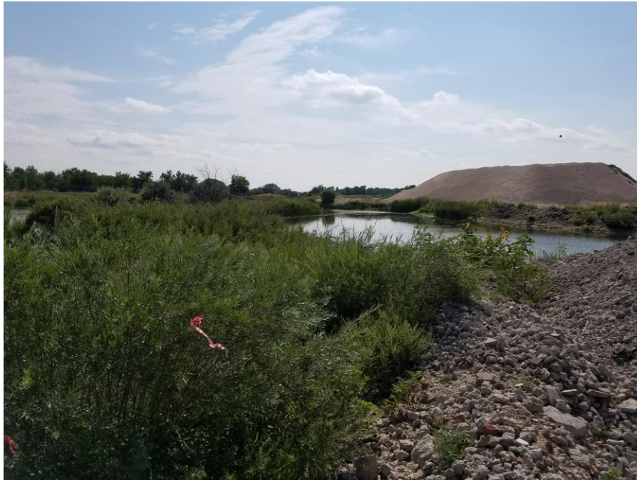
Figure 3. From Point 1 looking east.