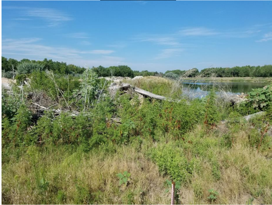
Figure 1. From Point 0 (See Map) looking northwest.