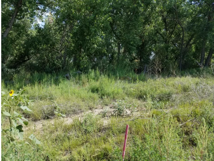
Figure 7. From Point 4 looking north.