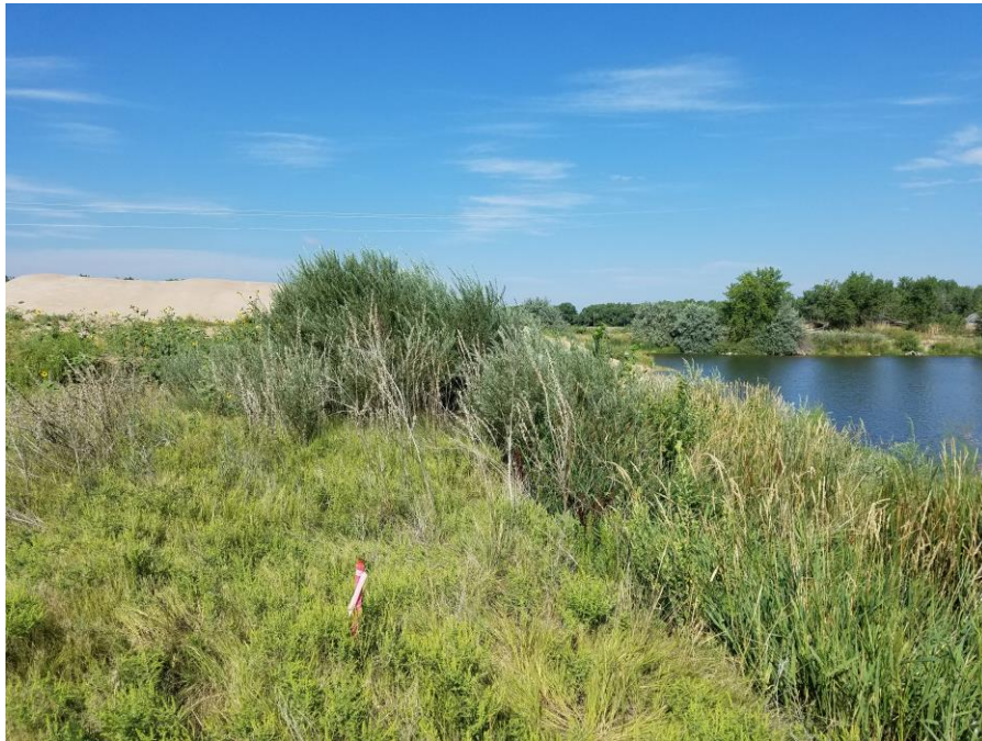
Figure 4. From Point 2, looking west.