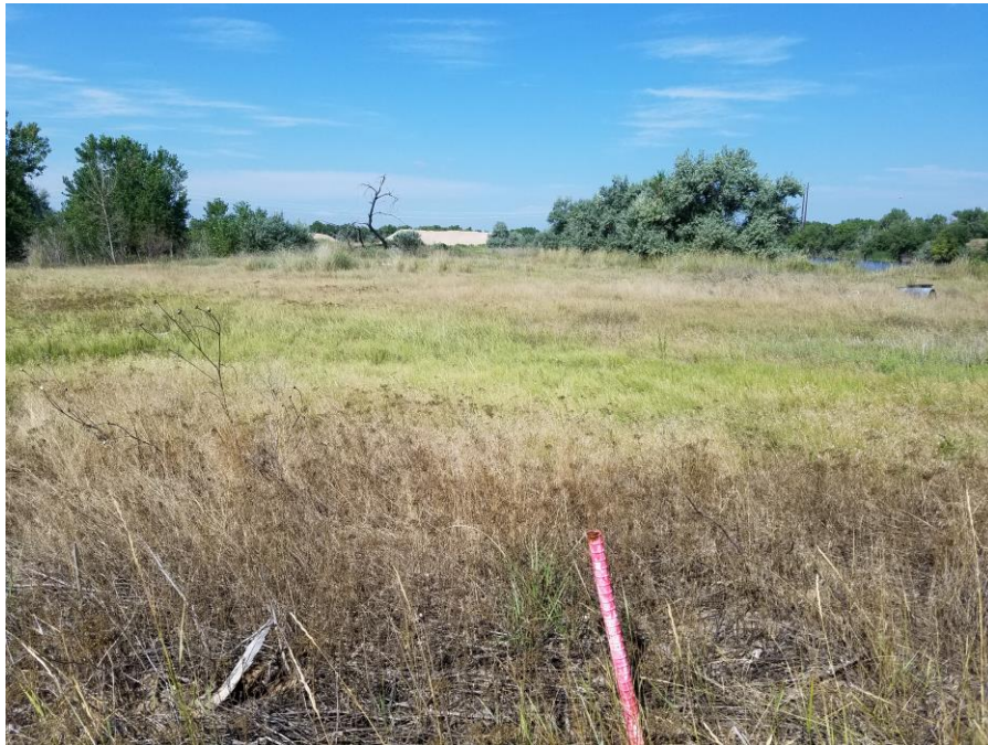
Figure 6. From Point 3, looking west.