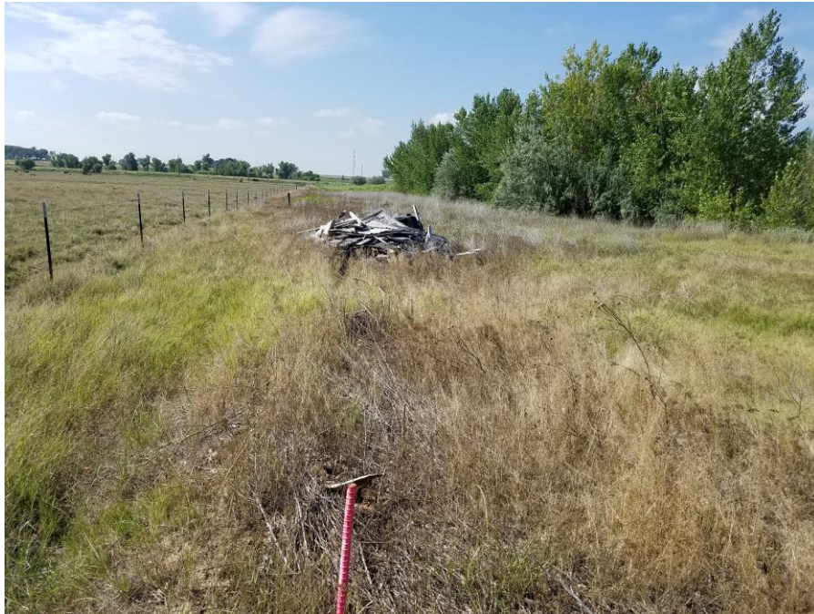
Figure 5. From Point 3, looking south.