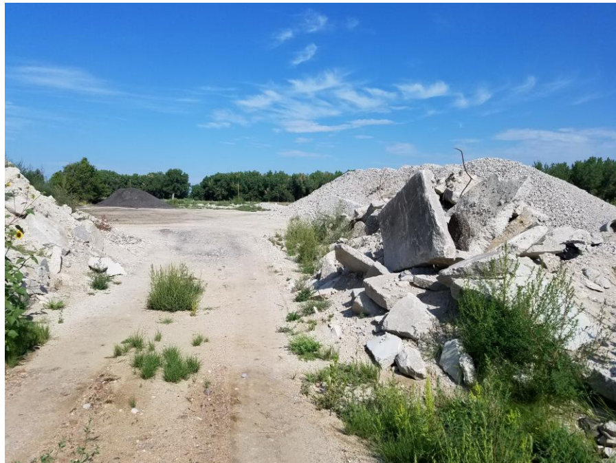
Figure 2. Concrete and Asphalt Pad area. From east end looking west.