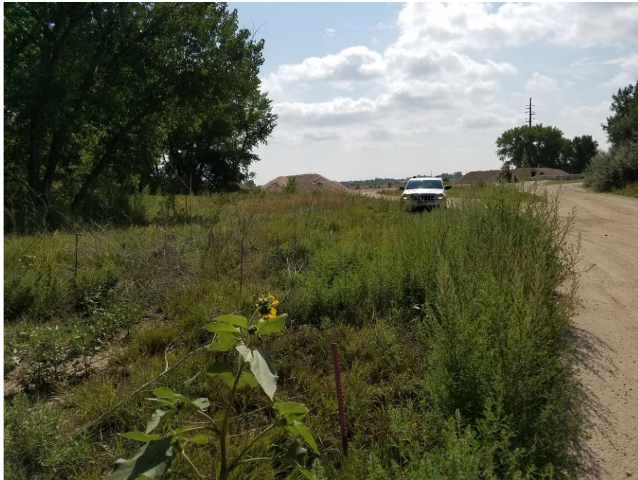
Figure 8. From Point 4 looking southeast.