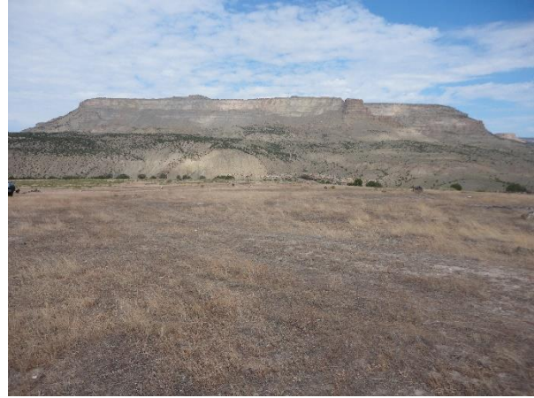
Photo 6: Section 34 looking west towards TR69 Approved repair area. Vegetation is cheatgrass