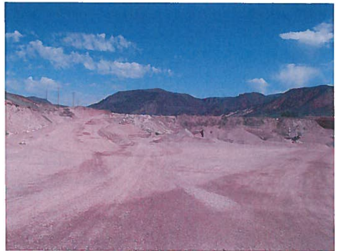
Figure 4: Facing north toward the backfilled highwall in the Phase 1 area.