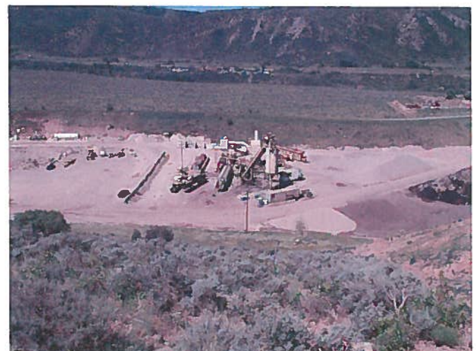
Figure 10: Asphalt plant

Gayle Lyman Elam Construction, Inc. 556 Struthers Ave Grand Junction, CO 81501