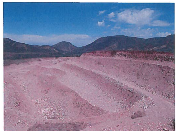
Figure 6: Phase 2 expansion area