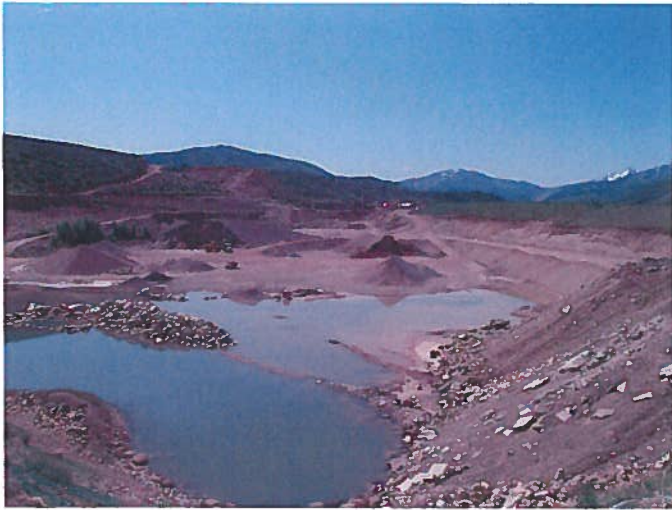
Figure 3: Facing south from the backfilled highwall