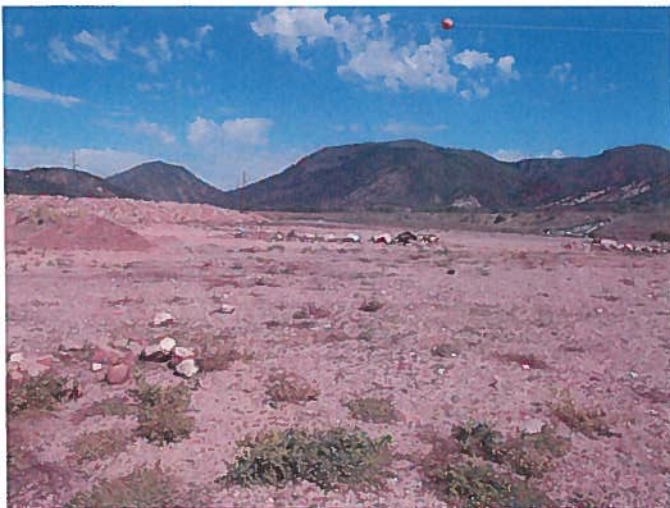
Figure 1: Backfilled area in north side of Phase 1