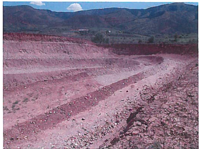
Figure 8: Phase 2 expansion area