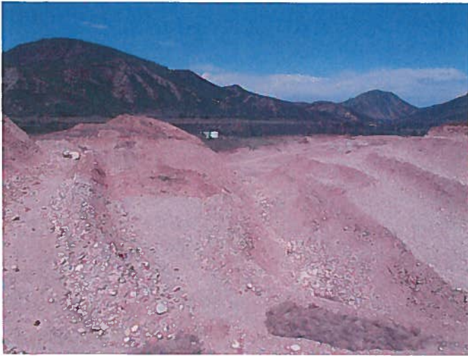
Figure 7: Phase 2 expansion area