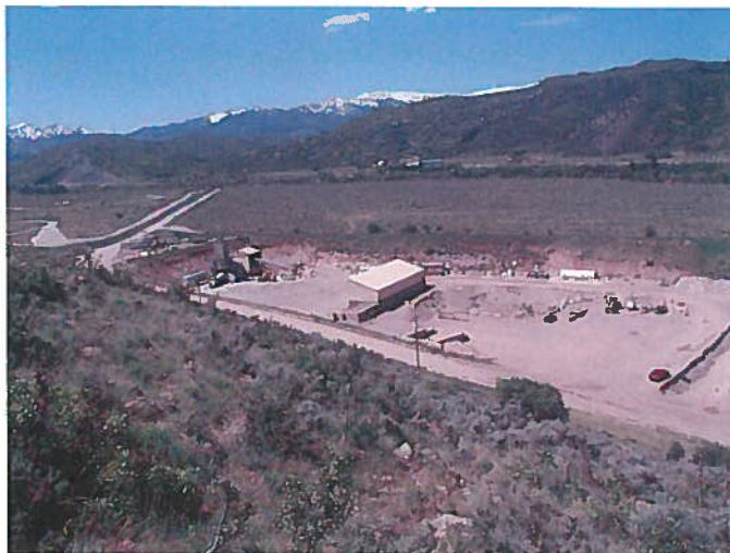
Figure 9: Concrete batch plant