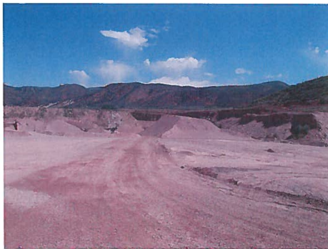
Figure 5: Facing north toward the backfilled highwall in the Phase 1 area.