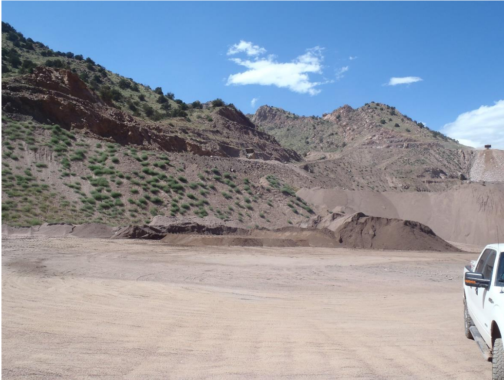
Photo 1. Existing phase 1 working area to be covered by TR-09 approved fines stockpile (looking NW)