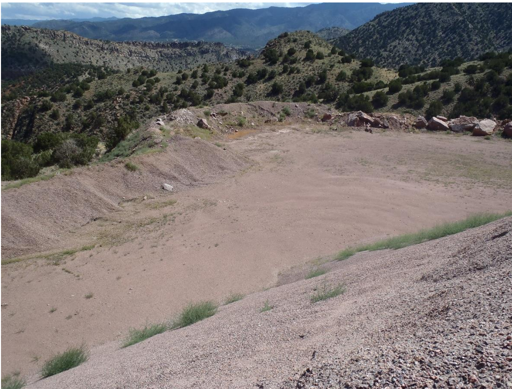
Photo 2. Bench below phase 1 working area to be covered by TR-09 approved fines stockpile (Looking SE).