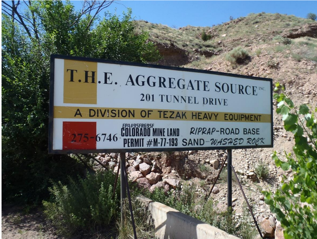
Photo 5. Permit sign.