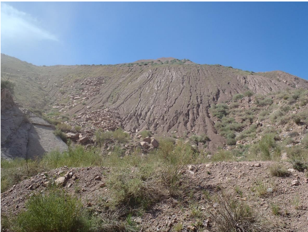
Photo 4. Eroded slope likely below newly approved TR-09 process fines stockpile (looking north).