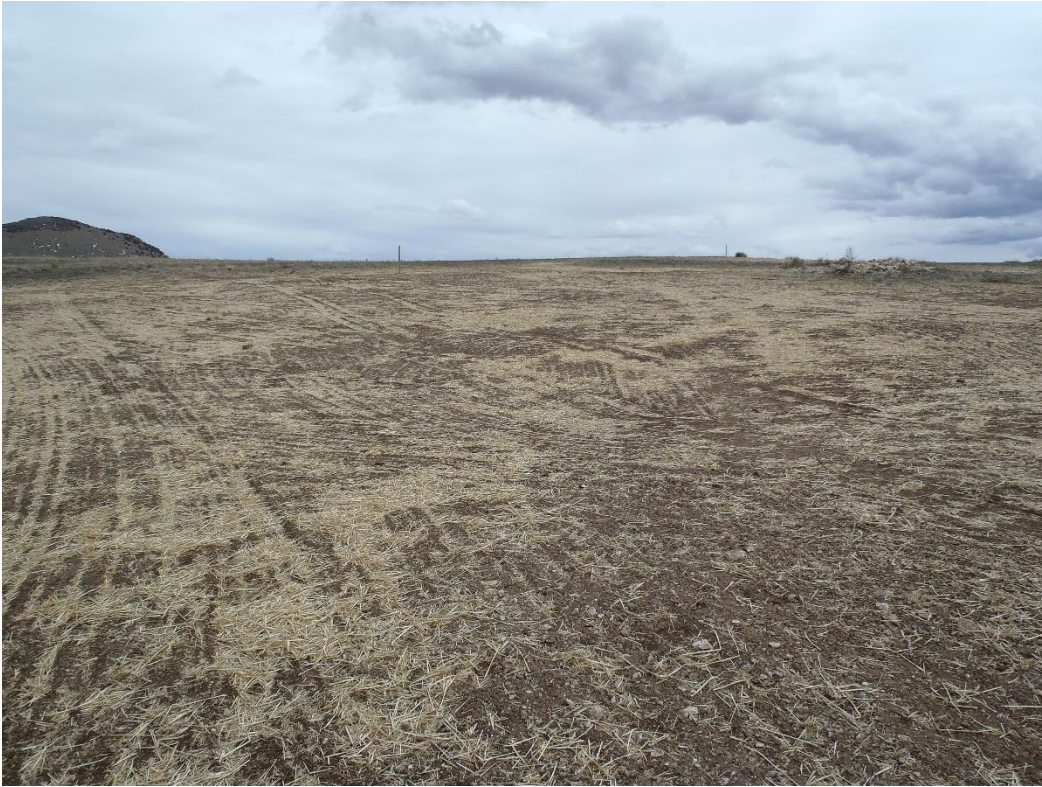
Photo 3. Recent revegetation effort: seeded and mulched (looking SE).

James Ebisch Viscount Colorado Holdings, LTD 15101 S. Cheney Spokane Rd Cheney, WA 99004