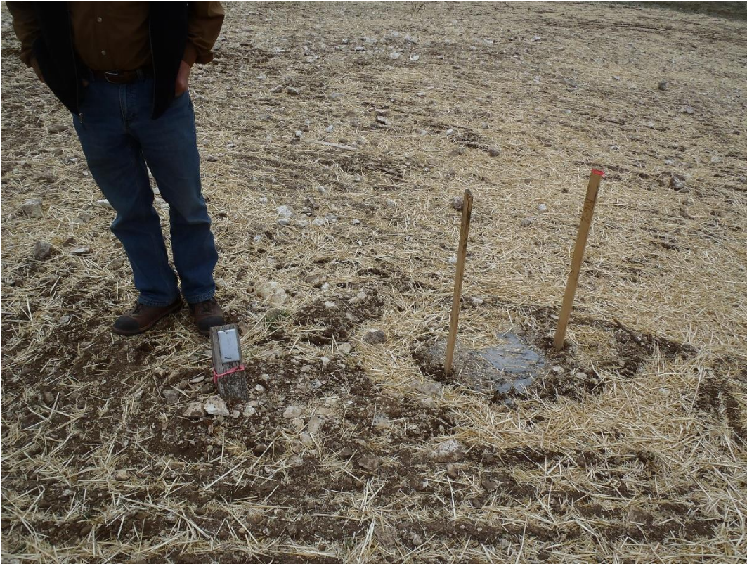
Photo 1. Boreholes K16-1 and -2.