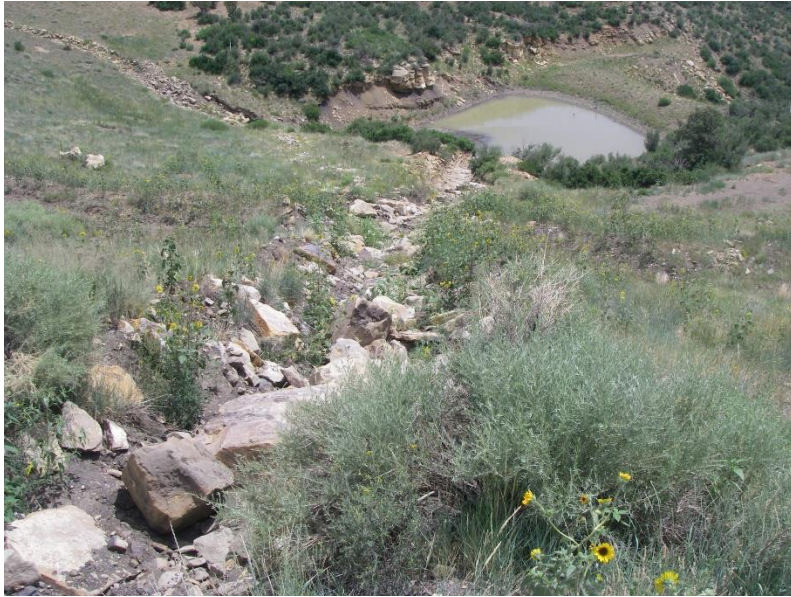
Fill 9 side channel