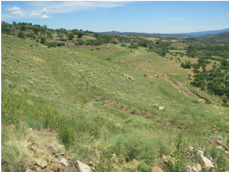
Fill 9 with excellent vegetation

Number of Partial Inspection this Fiscal Year: 1