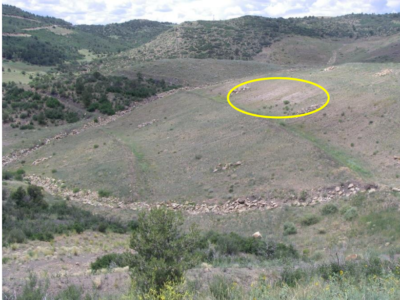
Fill 7 (seeded area in circle)