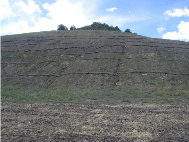
Hill above pond cleaning dump – need for more branches