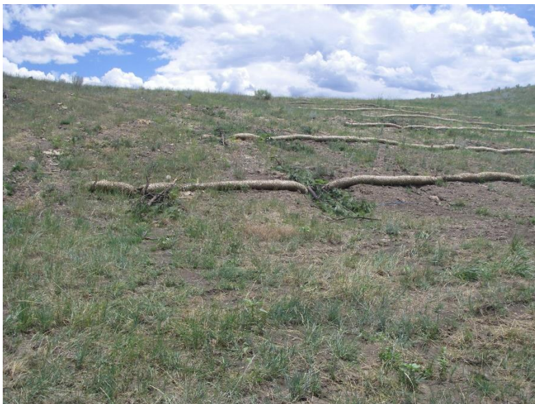
Rill repairs near shrub plot

Number of Partial Inspection this Fiscal Year: 1