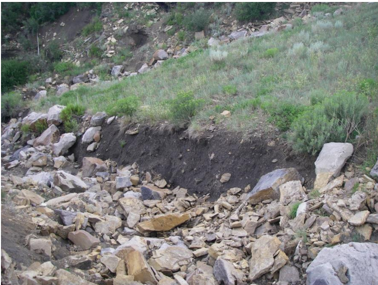
Channel below Fill 8 where additional rock work may be needed (if safe to access)

Number of Partial Inspection this Fiscal Year: 1