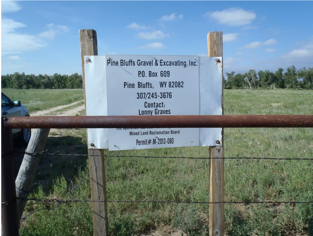
Photo 1. Permit sign at south end of County Road 23 (looking south).