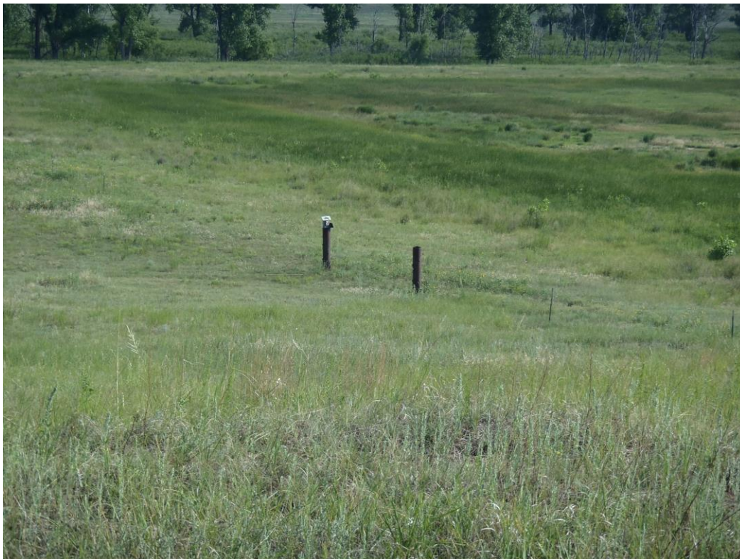
Photo 2. Typical steel posts delineating the permit boundary (south side, looking NNE).