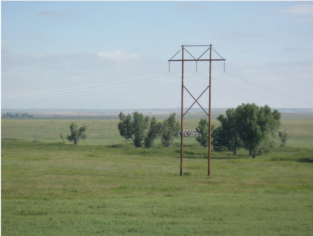
Photo 3. Electric transmission line crossing permit area (looking north).