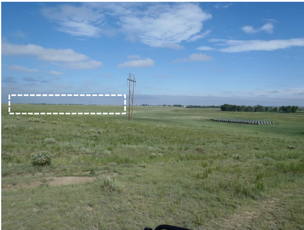
Photo 4. Electric distribution line on west permit boundary (left horizon, looking NW).