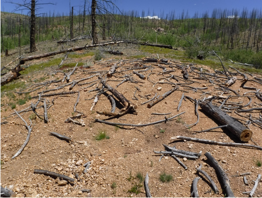
Photo 5. Backfilled excavation, small trees used to control erosion and aid revegetation efforts; looking north.