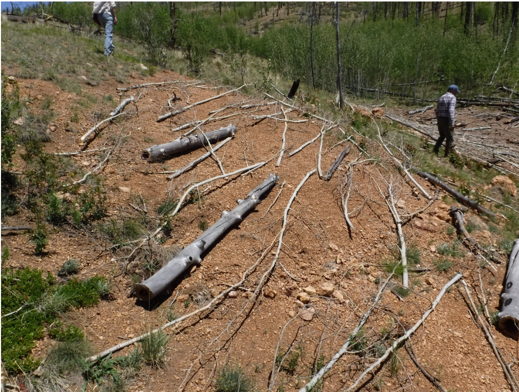
Photo 3. Backfilled excavation, small trees used to control erosion and aid revegetation efforts; looking east.