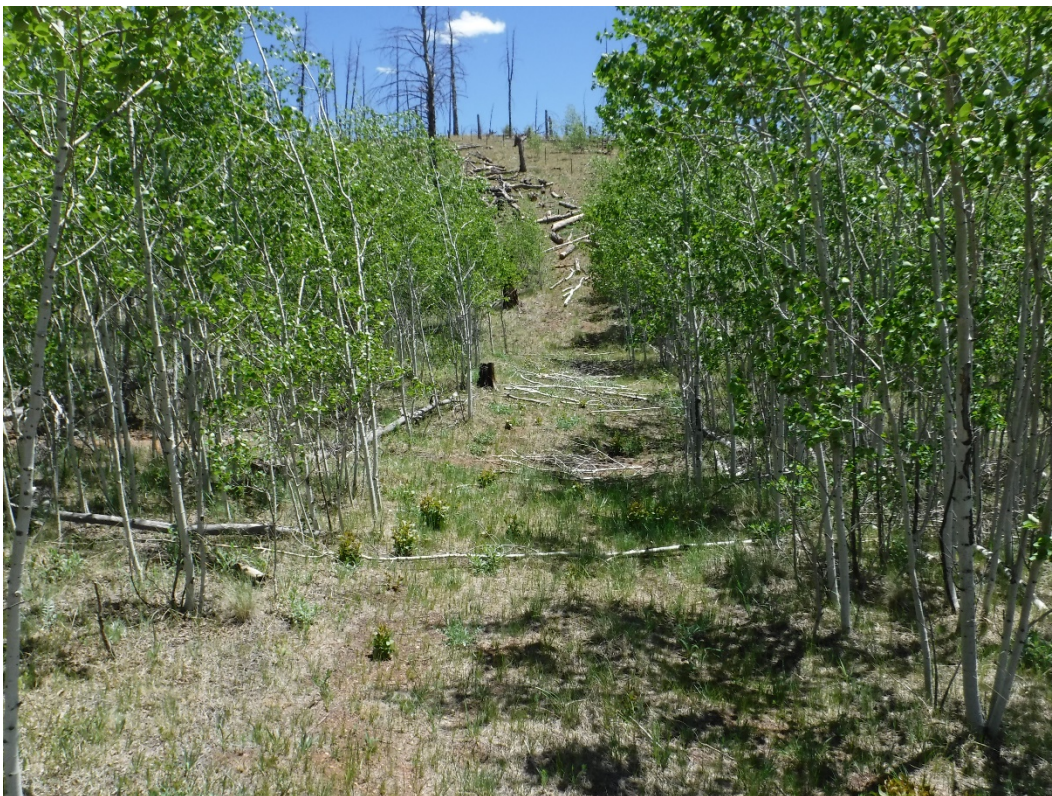
Photo 2. Temporary access road from FS 273 up to the dig areas; looking east.