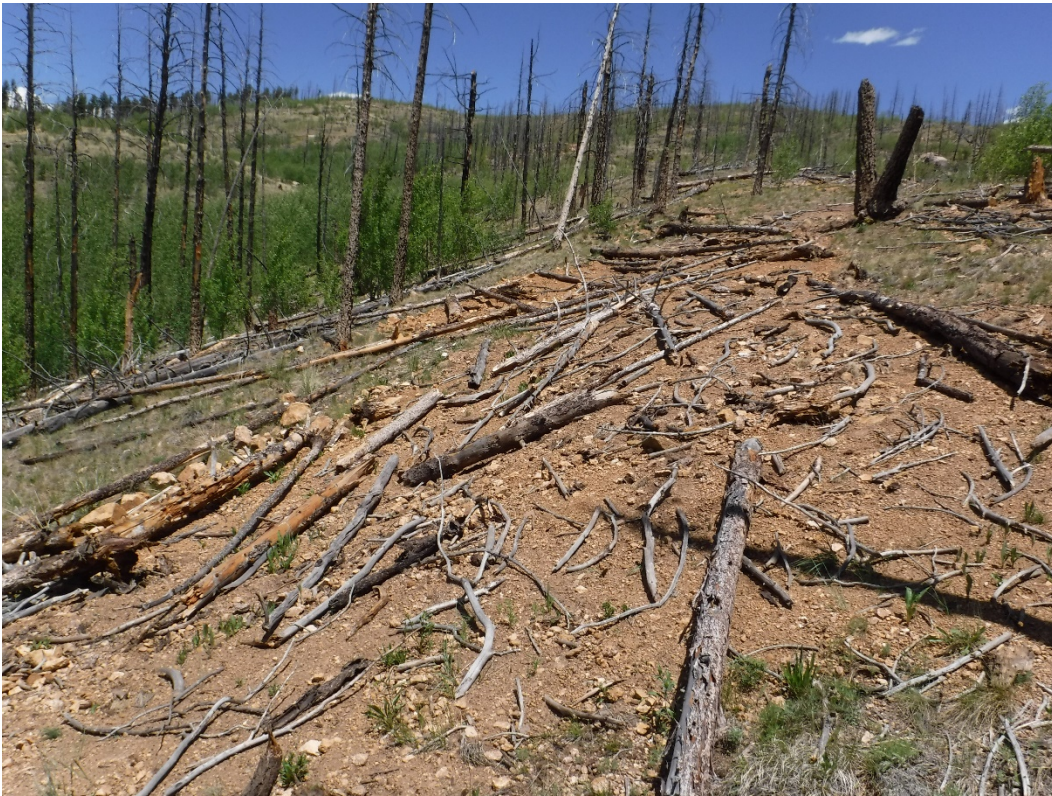
Photo 6. Backfilled excavation, small trees used to control erosion and aid revegetation efforts; looking north.