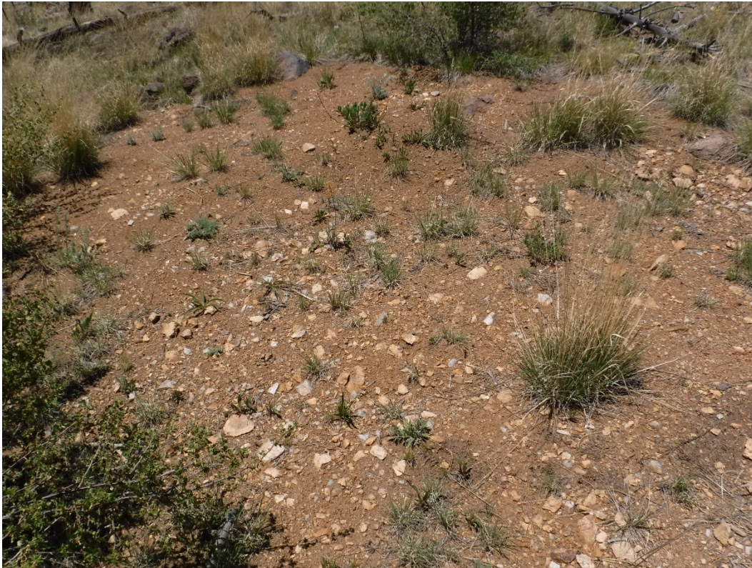
Photo 3. Backfilled dig area, grasses are beginning to establish; looking north.