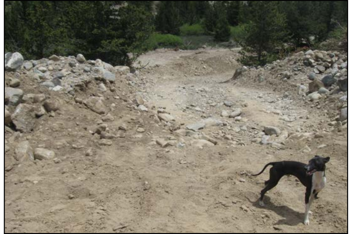
2. New access road constructed in southeast corner of mine. Photo taken facing downslope.