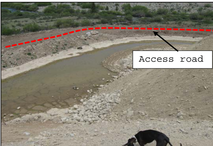
3. Access road constructed between mine pit and stormwater collection ditch.