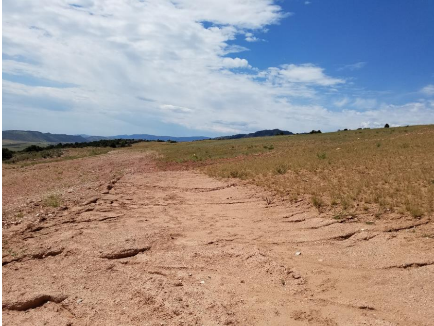
Figure 3. From the south end of the BF-1 area looking south.