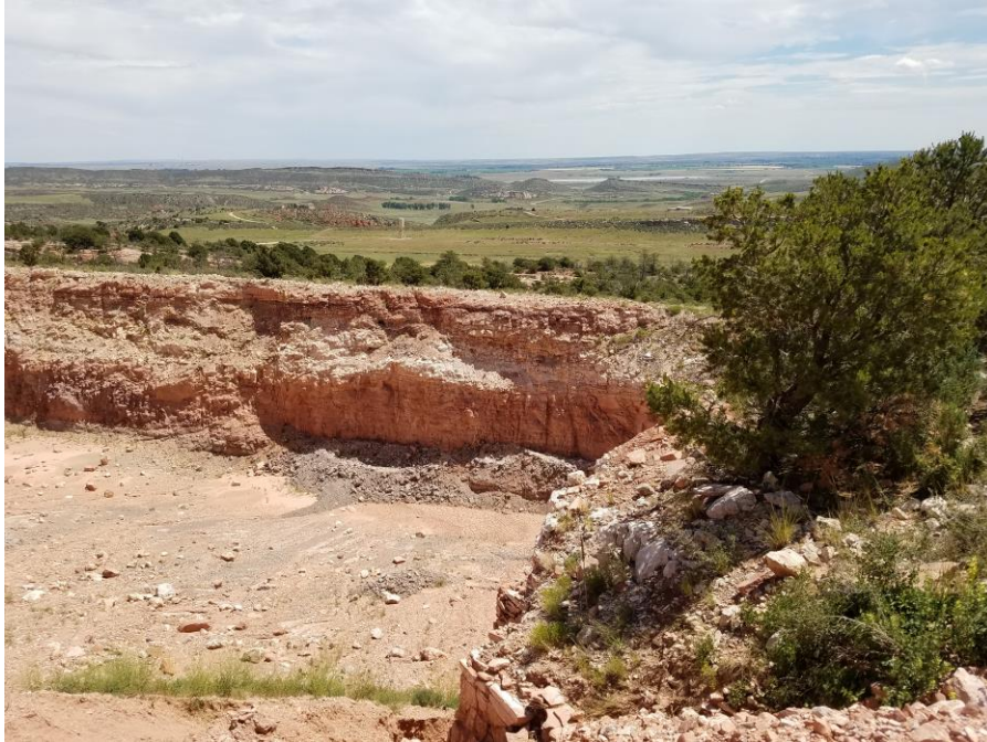
Figure 5. View of the southeast corner of the A3 mining area.

Brian Tideman Pete Lien & Sons, Inc. P.O. Box 1961 Fort Collins, CO 80225