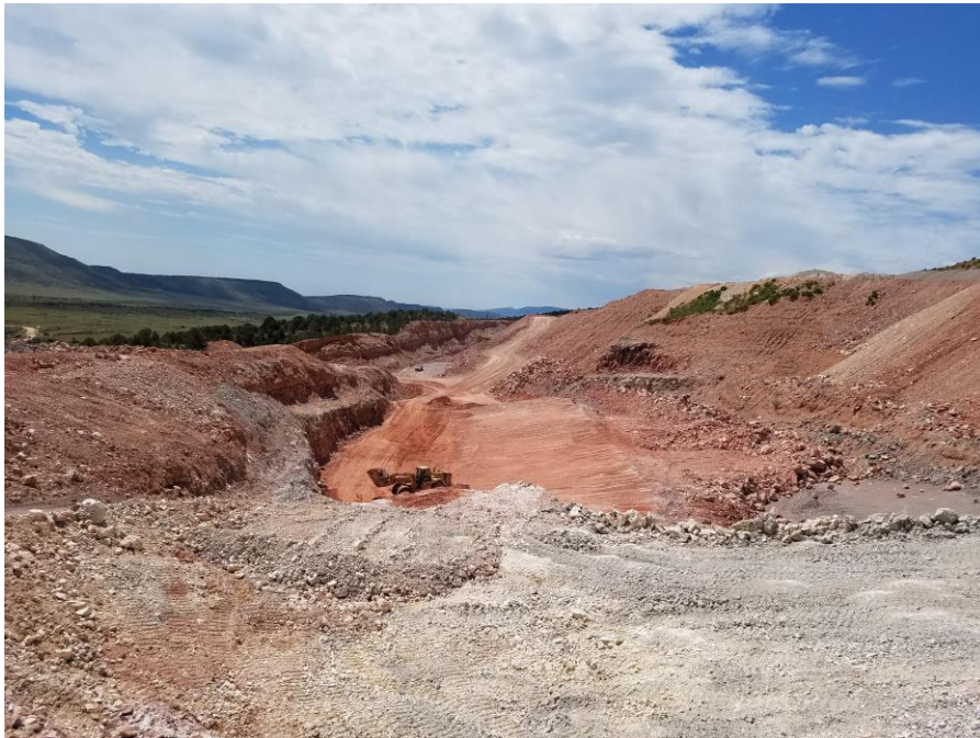
Figure 2. From Mine Area A4 looking south.