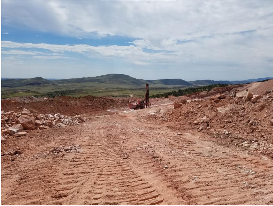
Figure 1. Blast pad preparation in Mine Area A4