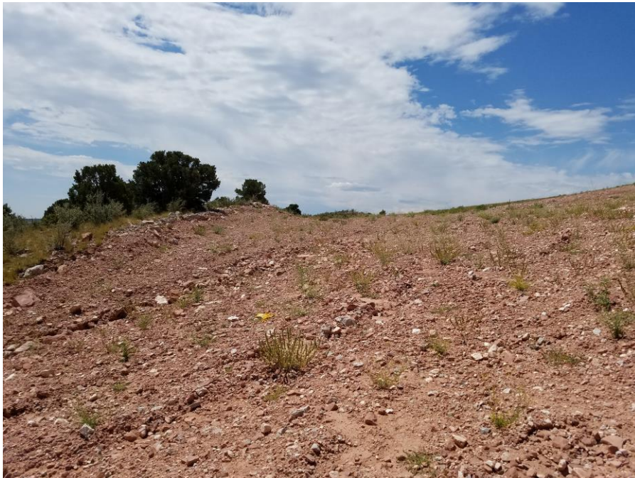
Figure 4. View of the southeast end of the BF-1 area.