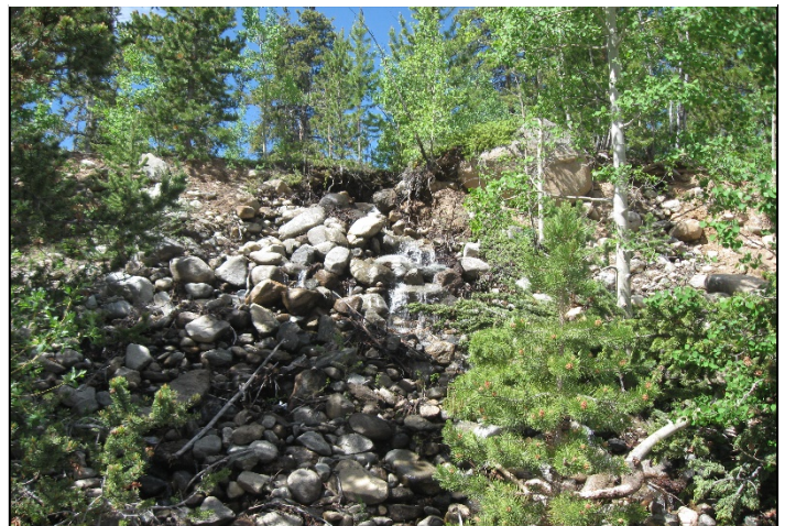
4. Platte City Mining Ditch discharging onto adjacent property. Note: no discharge pipe.