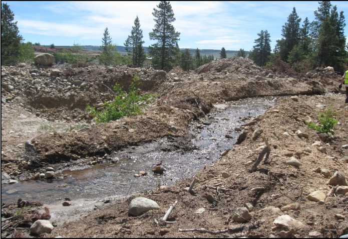
1. Platte City Mining Ditch.