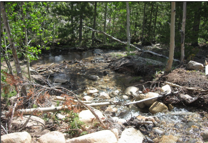
3. End of Platte City Mining Ditch.