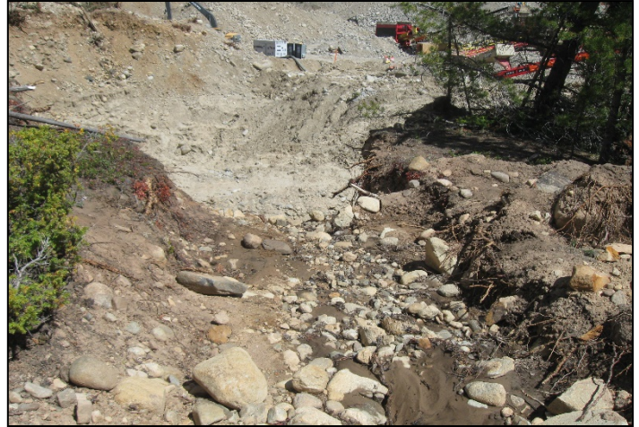
2. Diversion point from Platte City Mining Ditch into mine. Note: no water entering into permit area.