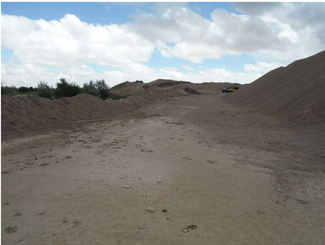
Photo 2. Storm water control berm around lower portion of the processing/stockpile area; looking southeast.