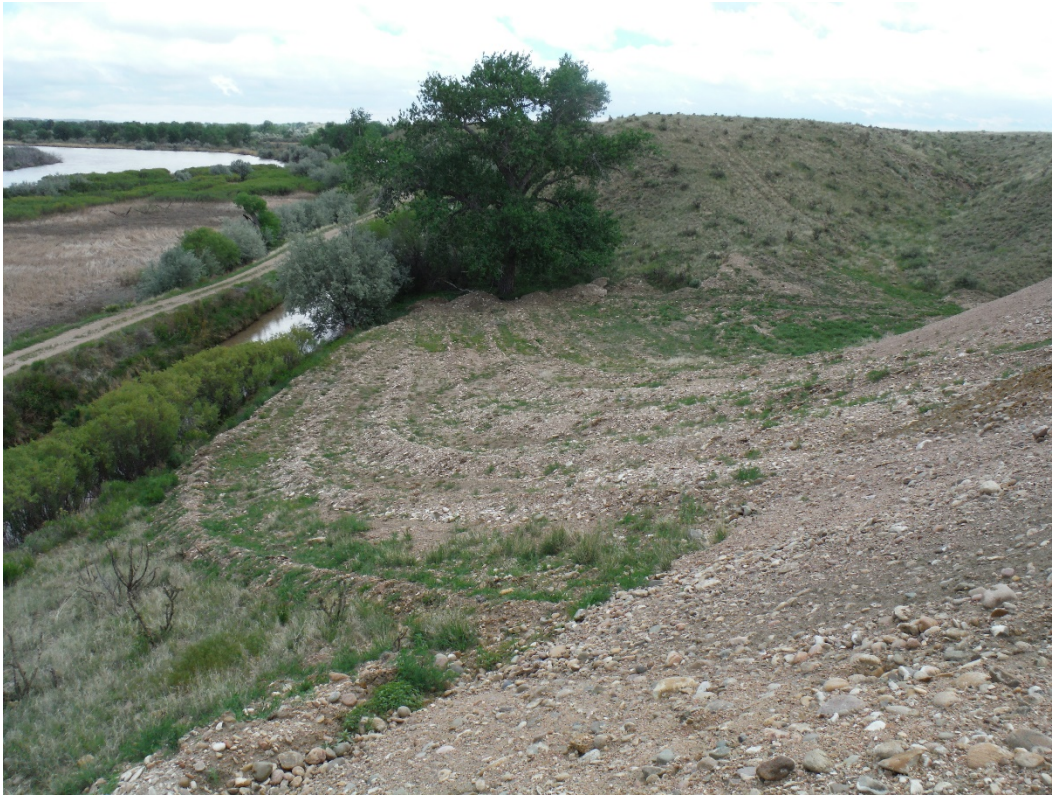
Photo 3. Drainage ravine where additional storm water management techniques are needed; looking southeast.