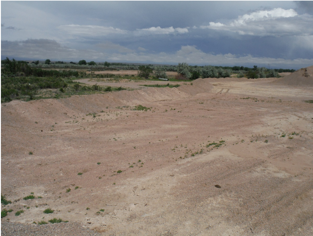
Photo 1. Storm water control berm around lower portion of the processing/stockpile area; looking northeast.