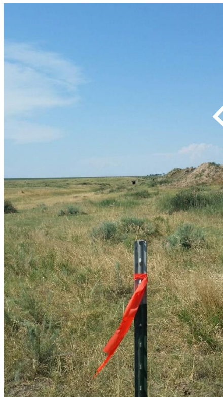
Photo 3. Replaced missing SW corner post (submitted by Permittee, looking north).