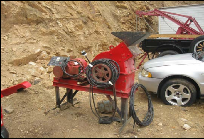
1. Portable hammer mill.