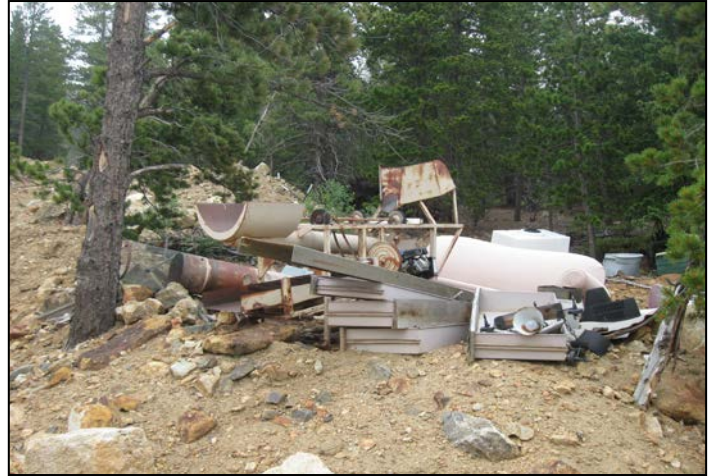
2. Sluice equipment.