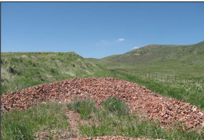
5. Overburden stockpile.