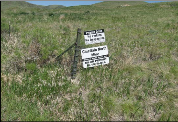
1. Permit sign at site entrance.