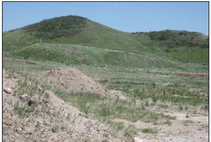
4. Topsoil stockpile.