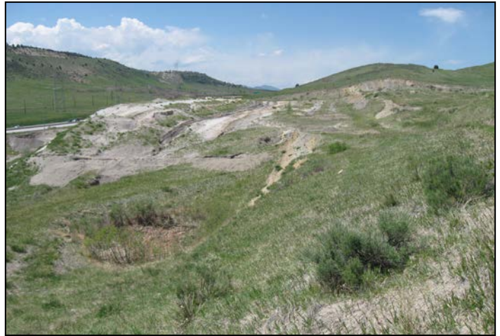
2. North end of pit, facing north.