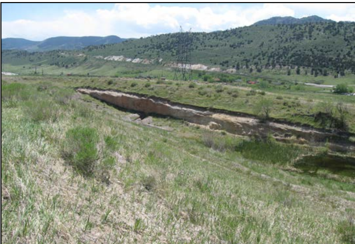
3. Pit highwall, facing west.