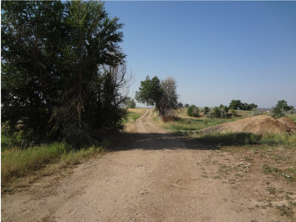
View of access road south of CR 74