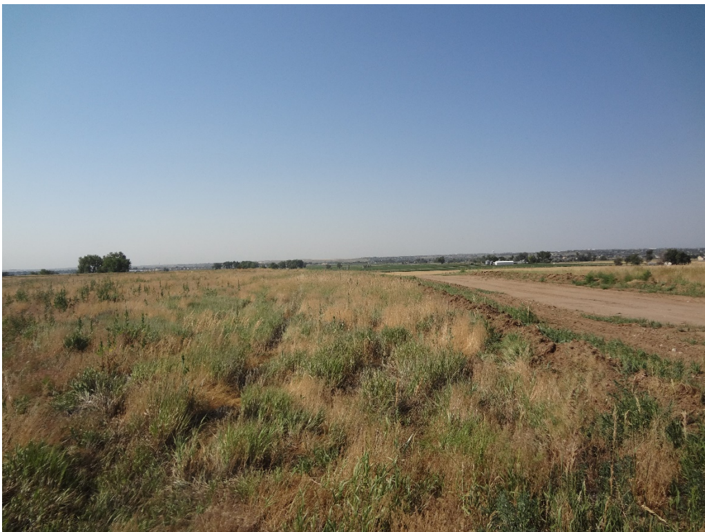
View of Phase 2 from NW corner looking south