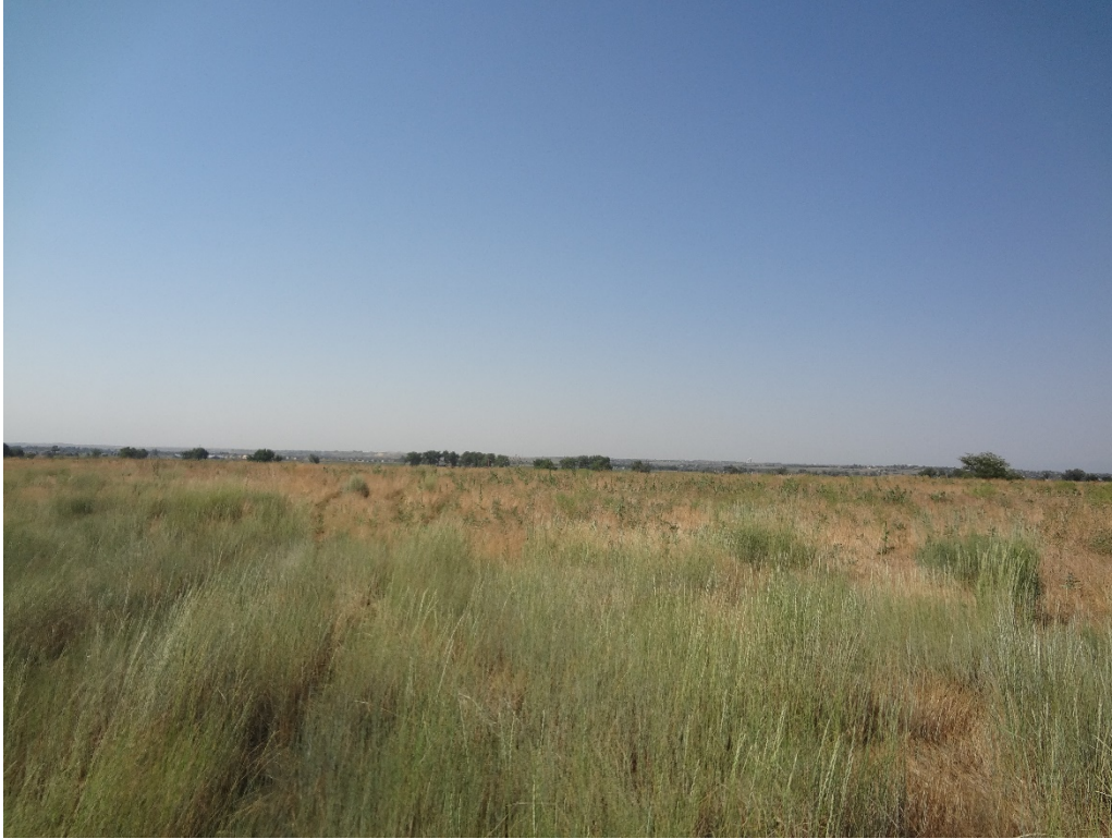
View of Phase 2 from NE corner looking south