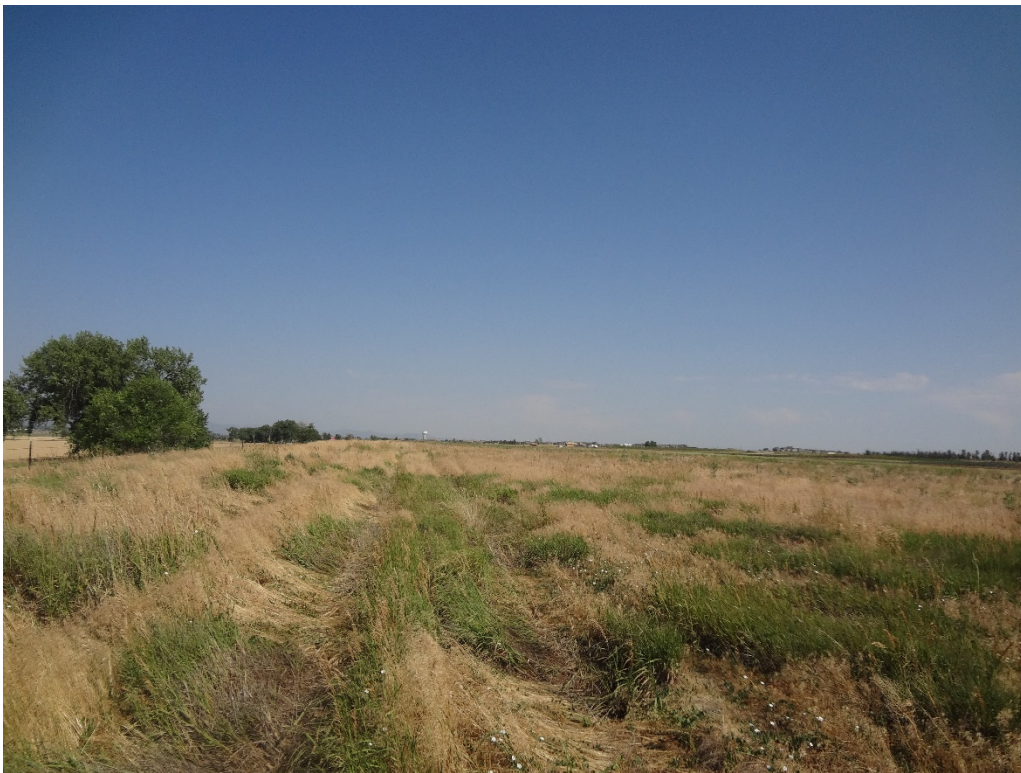
View of Phase 2 from SE corner looking west