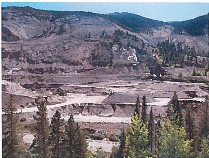
Figure 1: Overlooking site from Hwy 50