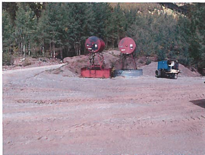
Figure 3: Fuel stored near site entrance