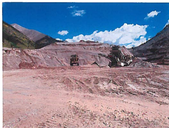
Figure 5: Active mine area (lower dig face)