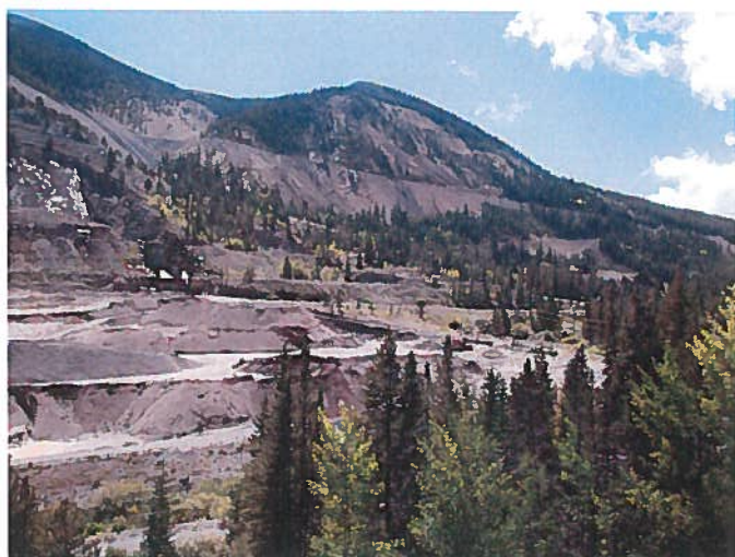
Figure 2: Overlooking site from Hwy 50