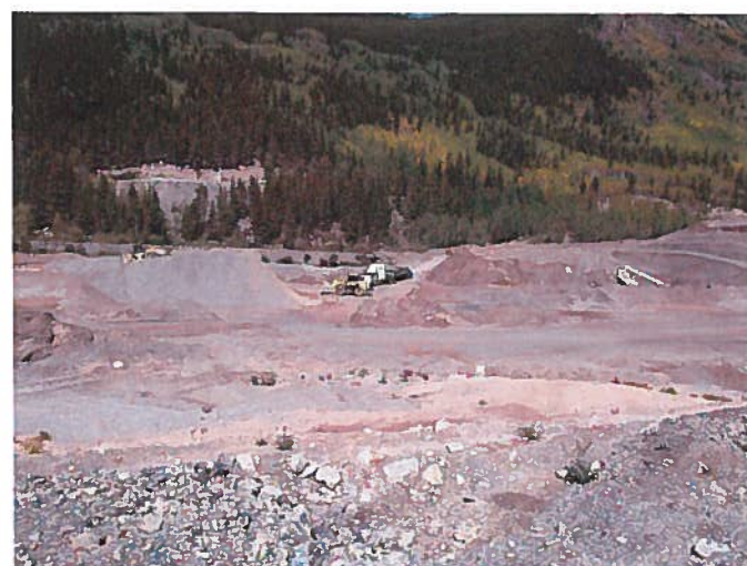
Figure 6: Overlooking mining area from scale