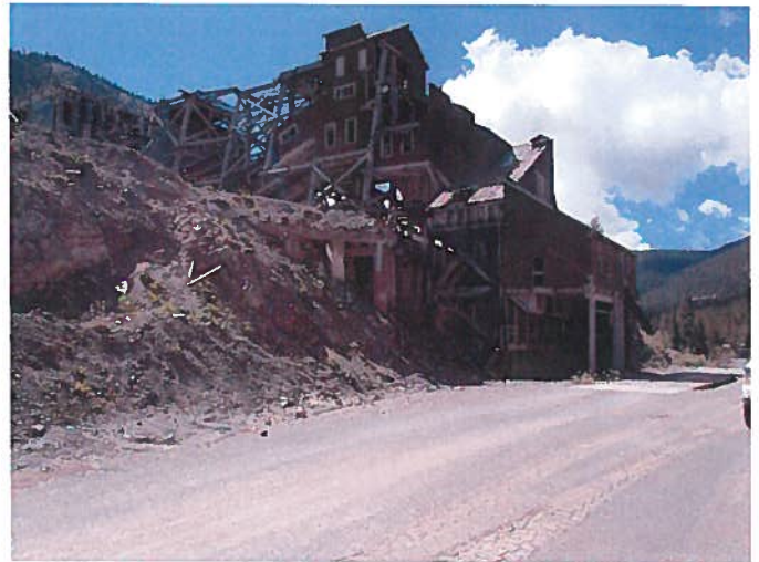
Figure 8: Scale located below historic mill facility

Bob Beadle Colorado Lime Company 1468 Hwy 50 Delta, CO 81416-3119