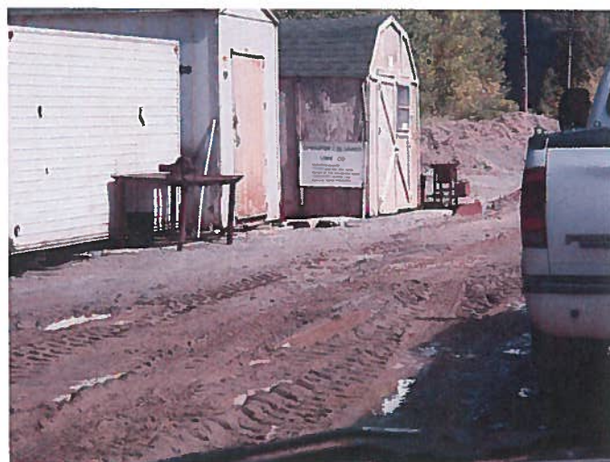
Figure 4: Equipment storage near site entrance