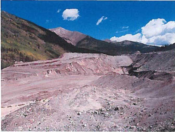
Figure 7: Overlooking mining area from scale