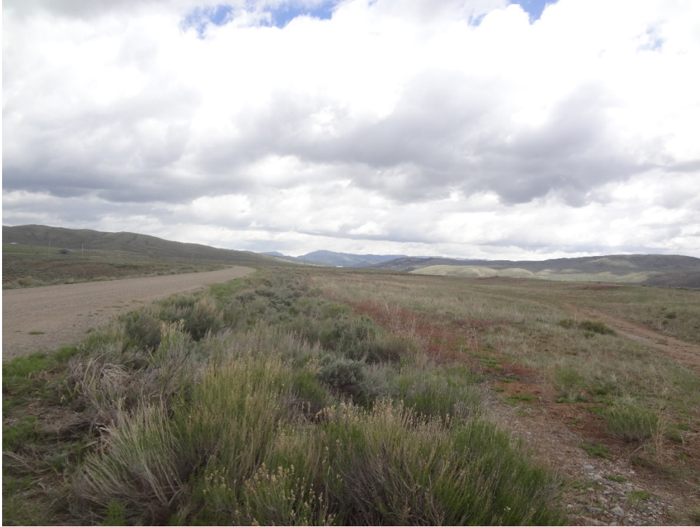
View of Phase 2 from the NW corner of the phase looking east