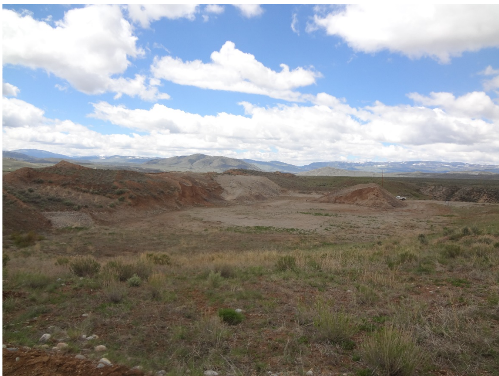
View of Phase 1 from the NE corner of the phase looking SW