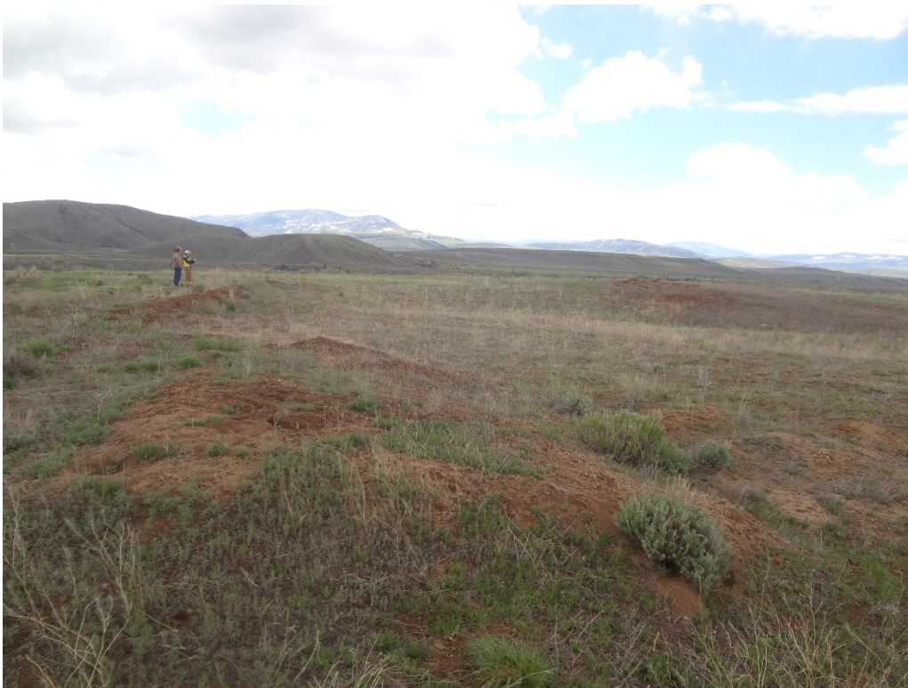
View of the berm in Phase 2 to be regraded looking north