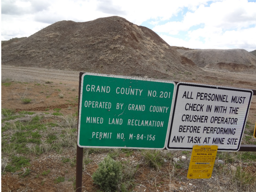
Scholl Pit mine sign