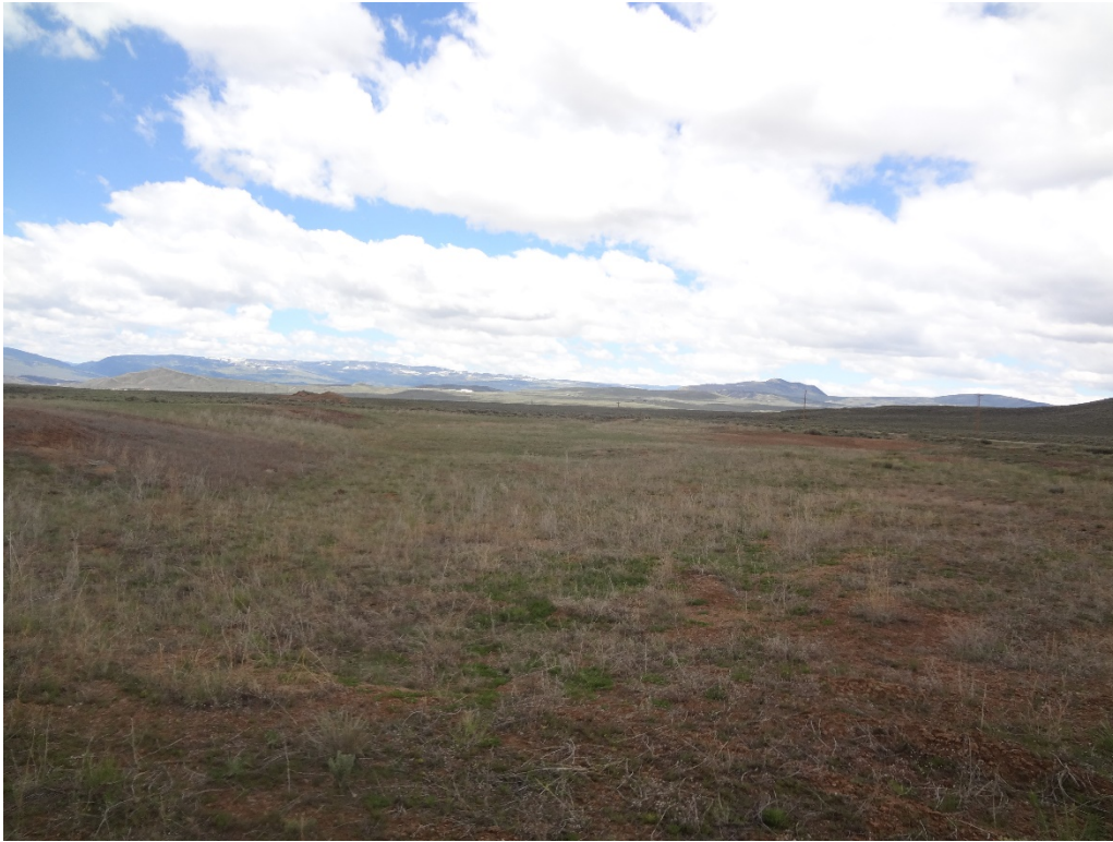
View of Phase 2 from the east extent of excavation looking west