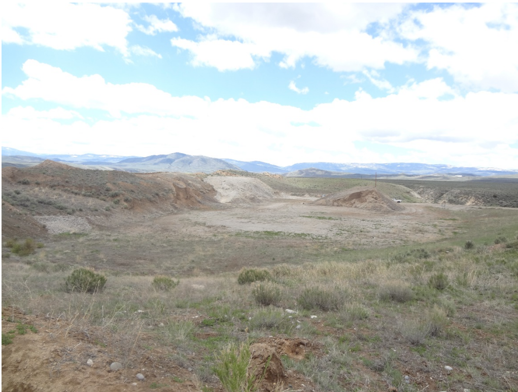
View of Phase 1 from the east side of the phase looking west