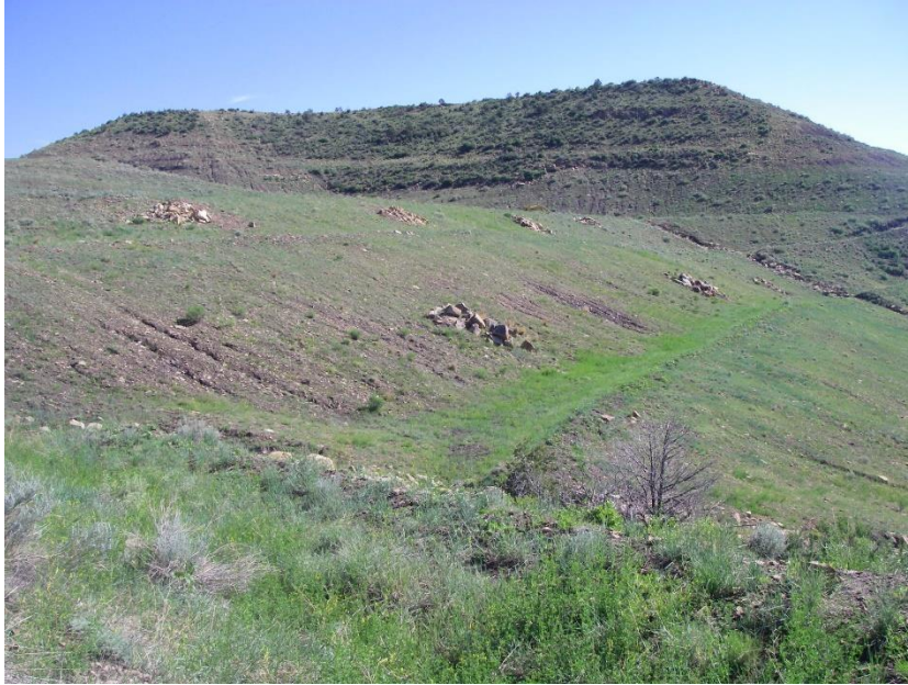
Rills on Fill 7