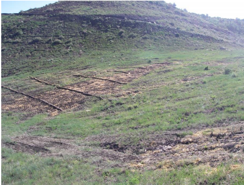
Erosion repairs near shrub plot