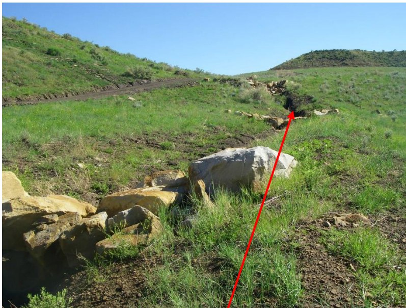
Channel above Pond 6