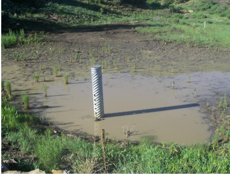
Sediment in Pond 5