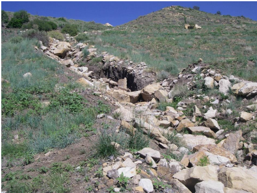
Side channel, aka west down drain, at Fill 9 (need for more riprap)

Number of Partial Inspection this Fiscal Year: 9