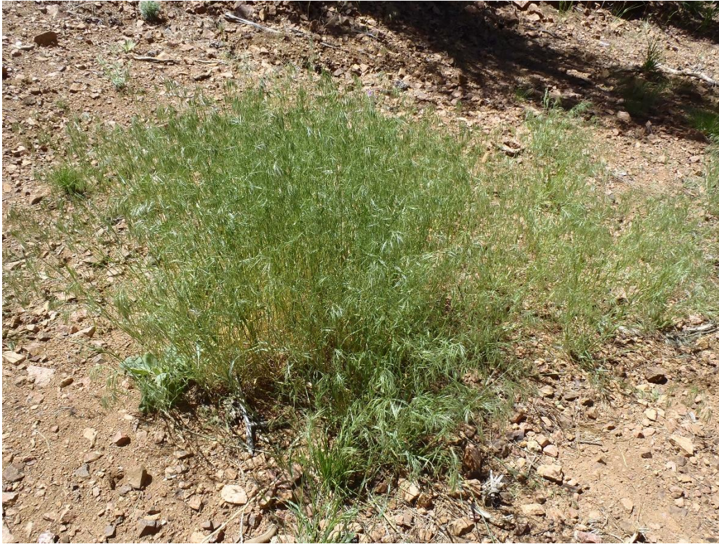
Photo 2. Downy brome at switchback below borehole HC006-15.