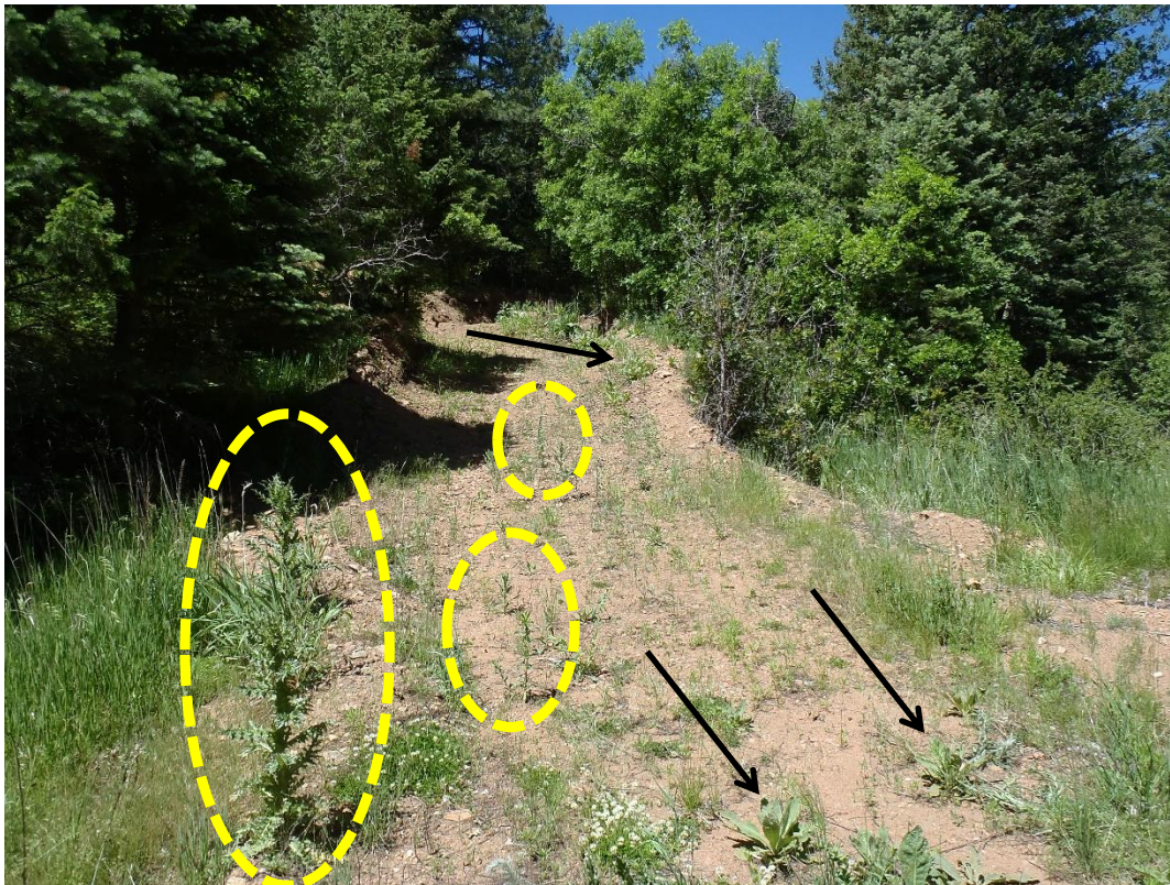
Photo 1. Scotch thistle (circled), common mullein (arrows) (looking west from LTC road).