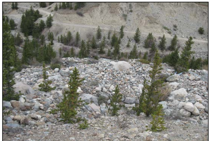
10. Historic disturbance along the Middle Fork of the South Platte River.