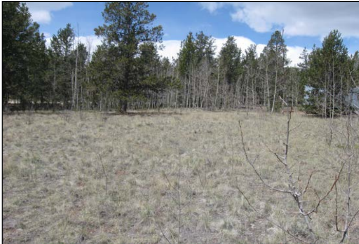
7. Typical vegetation surrounding the mine site.