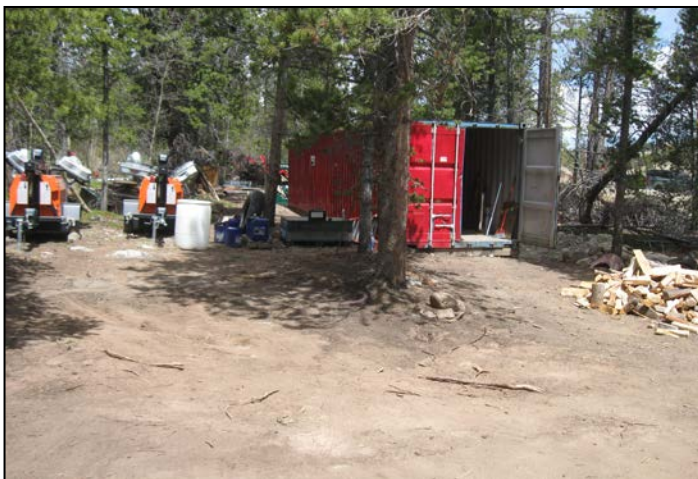
9. Equipment not associated with the mining operation.