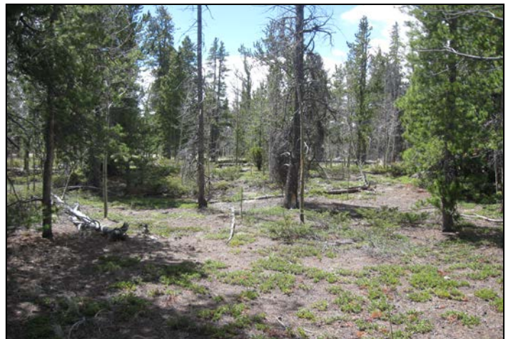
6. Typical vegetation surrounding the mine site.