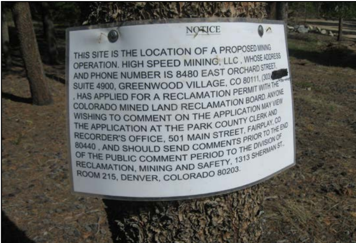
1. Public Notice sign posted at site entrance.