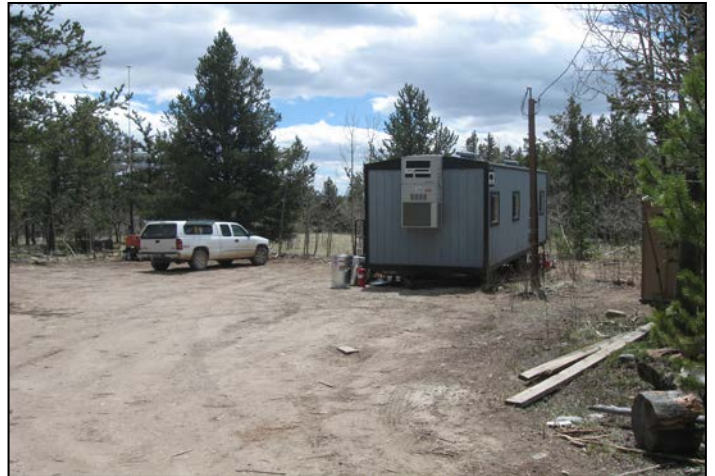
8. Portable trailer not associated with the mining operation.