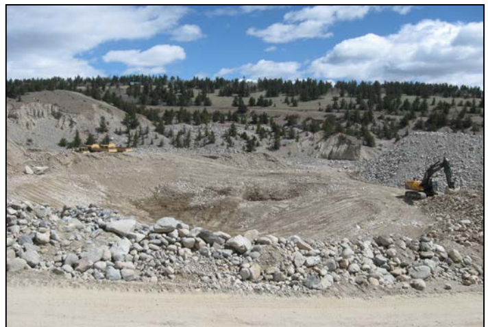
4. Overview of pit excavation, photo taken facing north.