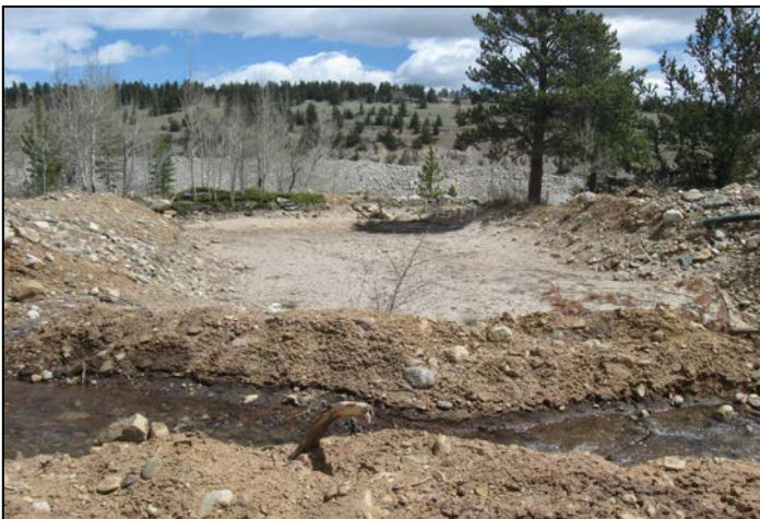
5. Platte City Mining Ditch flowing in front of the water holding pond.