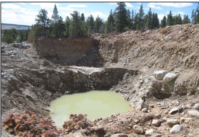
3. Wash pond.