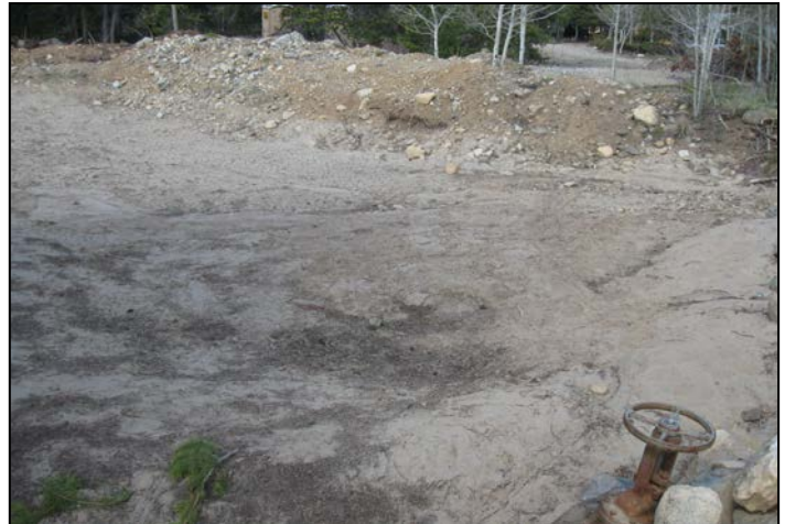
2. Water holding pond.