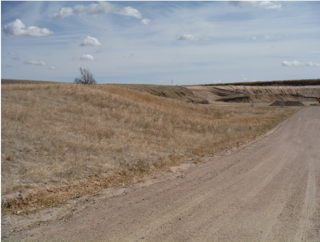
Photo 5. Revegetated slope in the northeast portion of the site; looking east.

Dave Hornung Kit Carson County P O Box 160 Burlington, CO 80807