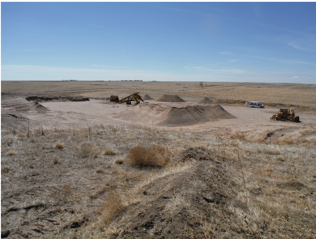
Fig 2. Site overview; looking southwest.