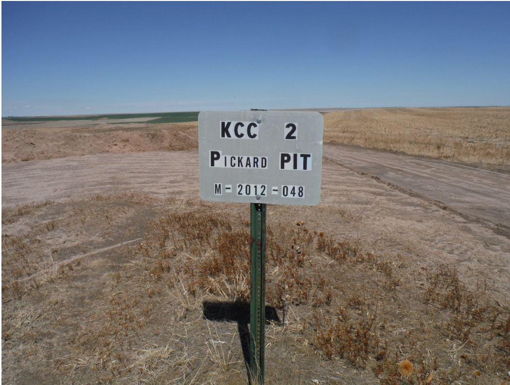
Fig 1. Mine identification sign; looking north.