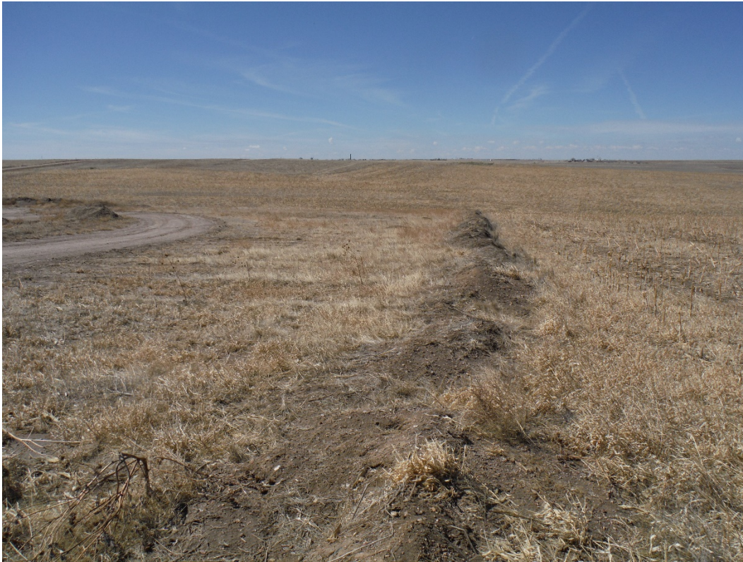
Fig 3. Small berm of topsoil along the northern permit boundary, appears to aid with stormwater control; looking west.